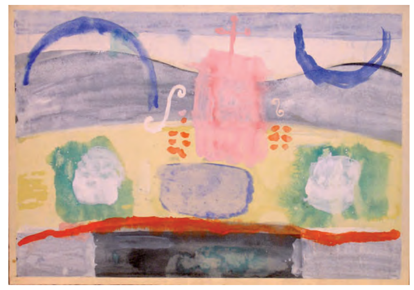
Jaroslav Malina. Krajina v červenci (Landscape in July, 1970): Tetraptych III.