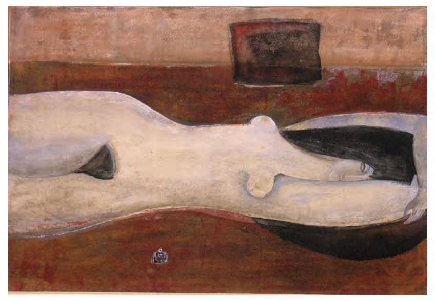
Jaroslav Malina. Červený polštář (Red Pillow, 1964)