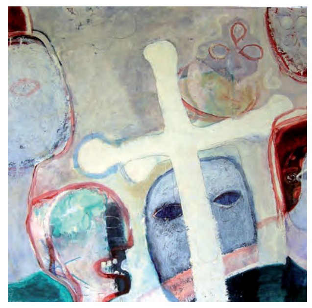
Jaroslav Malina. Cesta do ráje (The Way to Paradise, 1973).

2002) and the painting Autumn (1973). Both works focus on an image of a pale, young girl with vacant eyes. The sense of recent or impending death is contrasted in the works with flowers – poppies in War . The mixture of a youthful figure and a smiling skull framed by sabres renders a rather concrete association to the title depicted in the poster design, whereas Autumn conveys Malina's ambivalence towards a season of both plenty and decay. The painting is not entirely inscrutable, but it keeps the viewer at a discreet distance regarding any specific meaning.