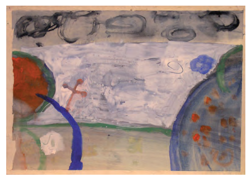
Jaroslav Malina. Krajina v červenci (Landscape in July, 1970): Tetraptych II.