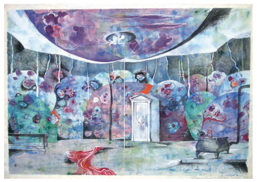
Jaroslav Malina. Slečna Julie (Miss Julie, 1988)

to achieve a pale landscape with minimal symbolic intrusion. The image could be a bird's-eye view of snowy countryside, or the hazy view outside a frosted window in winter; or perhaps the title is a pun based on the source of the word Baroque (which is Portuguese for a malformed pearl). The latter explains the gentle, but careful colour application and suggests a connection with the abundance of Czech Baroque structures scattered throughout southern Bohemia. The careful and deliberate use of colour, line, shape and signs in Malina's free work is not designed to produce immediate understanding, but rather to suggest possible meanings. He is similarly disposed to use open-ended metaphorical associations and abstractions when creating stage environments. However, by serving the intentions of a script through partnership with a director, the resulting designs are more obviously decipherable.