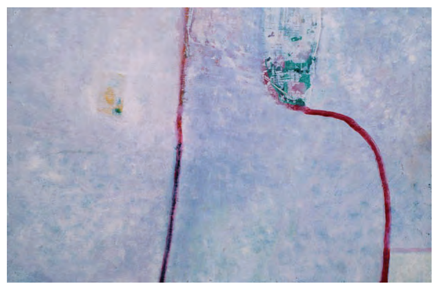
Jaroslav Malina. Barokní krajina (Baroque Landscape, 1997).