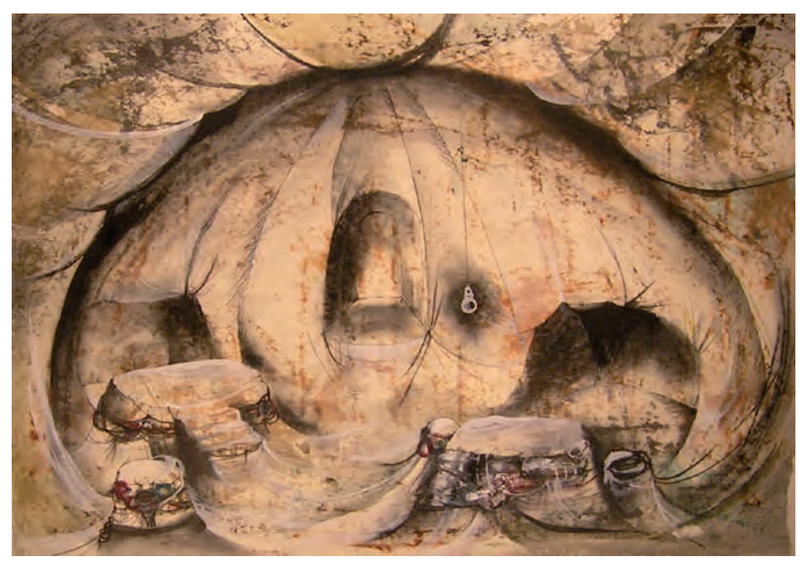
Jaroslav Malina. Uražení a ponížení (Insulted and Injured, 1985)