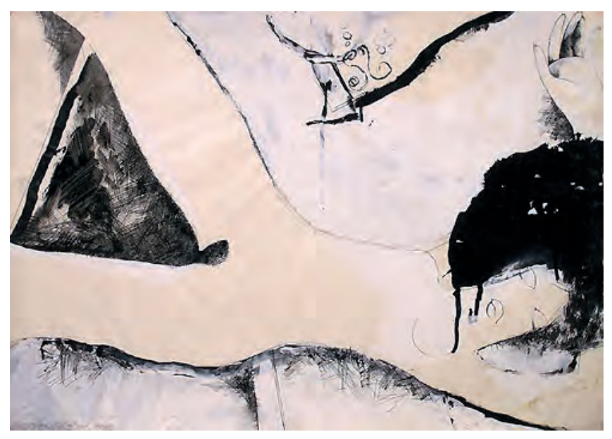
Jaroslav Malina. Dívka (The Girl, 1972)