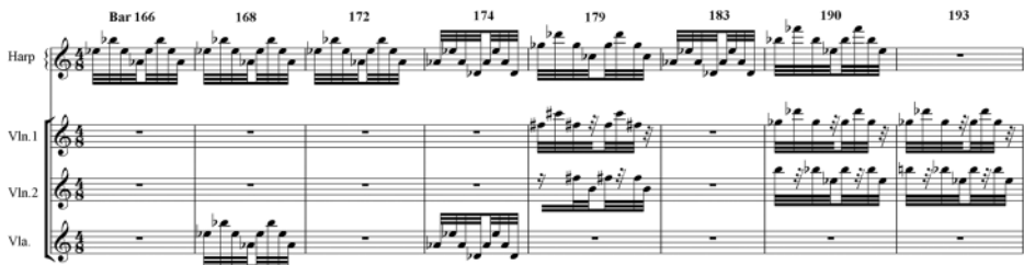
Ex. 8 Sinfonietta , II. movement: listing of all appearances of the accompaniment-motif 4.

Fig. 6 shows a graphical representation of the sequence of all four motifs. By closer examination of this table, we get the following results: