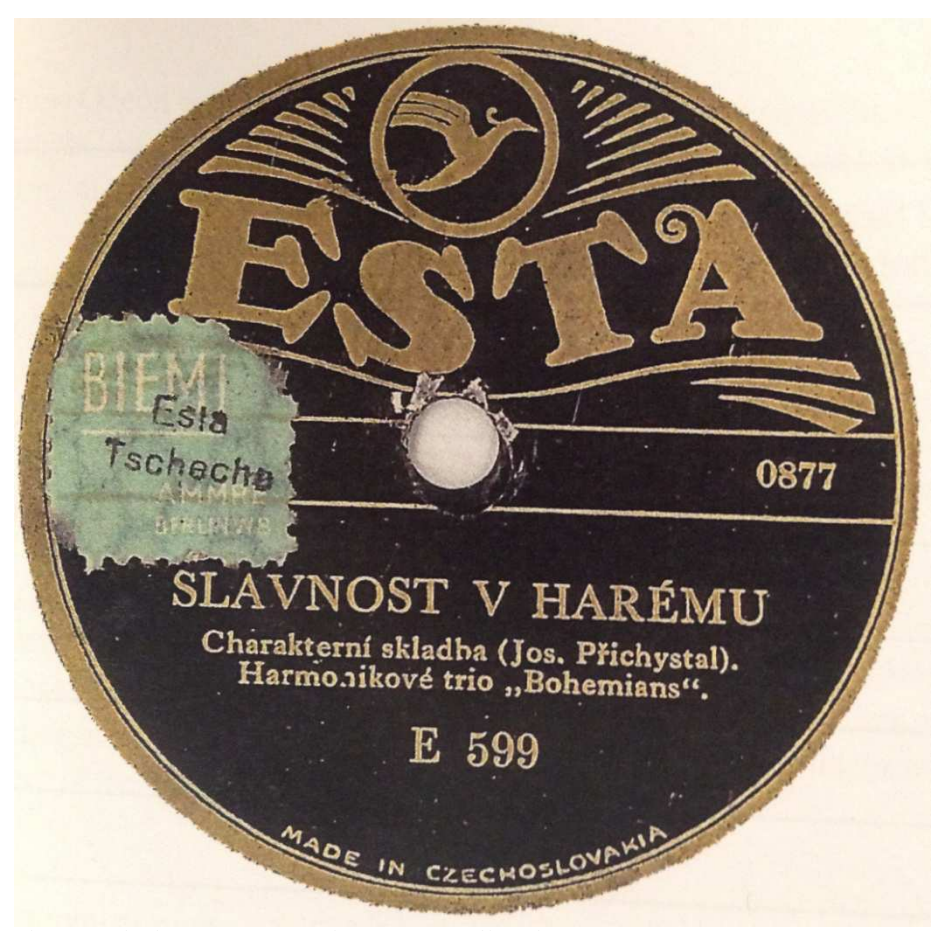
Fig. 2 Label on a gramophone recording by ESTA

One of the goals of our project is to get all the information right at all times. That is why we use the catalogues and shellac discs labels mentioned above.