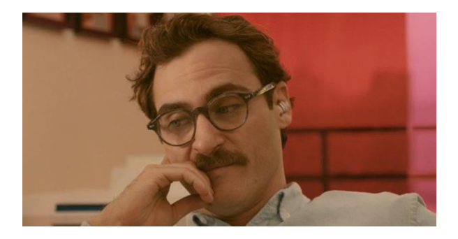
Fig. 4. Operation system called Her communicates with Theodore (Joaquin Phoenix) using speech synthesis<sup>41</sup>.

Takeaway message: Reading from wearables will be realized using text flow and speech synthesis.