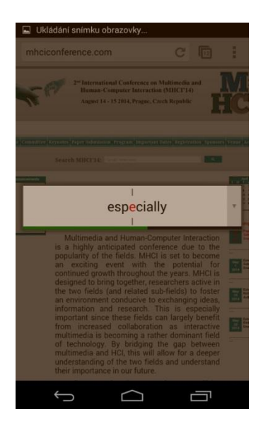
Fig. 1. Screenshot of A Fast reader<sup>35</sup> based on Spritz technology.

There is a strong interest in implementing Spritz technology into wearables. On the other other hand there are cautious opinions on psychological and cognitive aspects of reading using using Spritz. It is very often criticized for problematic information processing and significantly significantly less control<sup>33</sup>. Readers can have difficulties with the text flow. What happens when when reader wants to re-read the last paragraph because something was not understood correctly? Spritz also requires high level of attention not to miss any word. It is question how how much mental effort user must spend on concentration<sup>34</sup>.