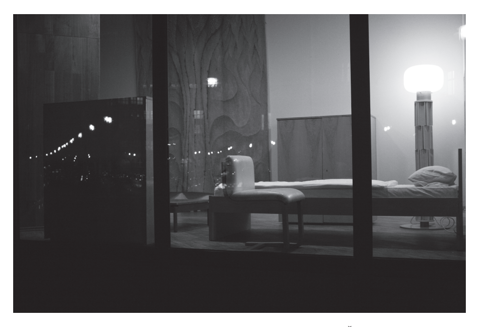
Fig. 6: The room - view from the street (viewers right)

Or at least this was the original idea, which in fact only stressed the paradoxical pointlessness of the existence of a department store in the everyday reality of so-called real socialism with its total lack of materials on one hand and the limited offer of ready-made furniture in the stores on the other. Lang managed to transfer the idea of the 'emptiness' of the period - in which the building was created - into his installation, thanks to the above-mentioned reinvention of the planning-and-consulting office. It gives the impression of a disturbing memento of ambitious construction activity within an intentionally minimalistic space - that is, at first sight, nearly empty. Lang's exhibition also includes free-standing reliefs which were originally located in DBK. The reliefs, made from wood and red polychrome, were designed by Václav Markupa.