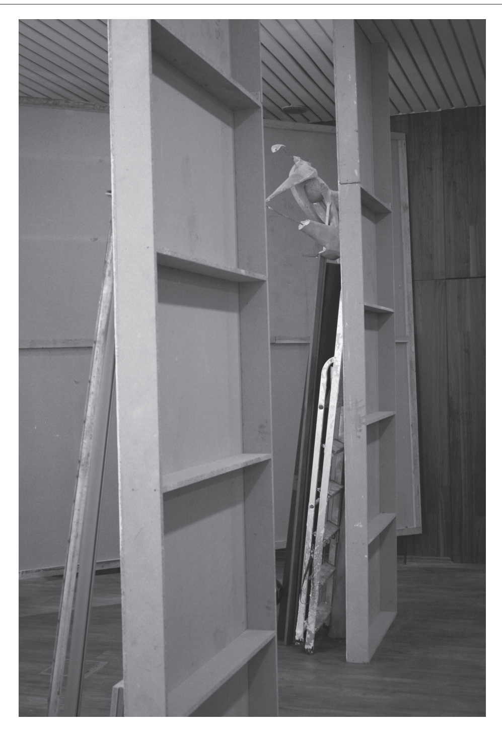
Fig. 5: The empty chipboard racks with the artistic objects behind