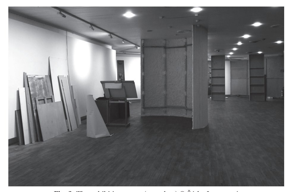
Fig. 2: The exhibition space (complete) © Šárka Lenertová

is made more sophisticated by viewer inevitably having to pass the real concrete column to get into the gallery (which is also supported by similar columns but in the square ground plan). Despite all this, the main purpose of the plaster column is not to expose the architectural elements of the building of the Czech embassy. The viewer finds out, having walked around the object, that the column is not complete –