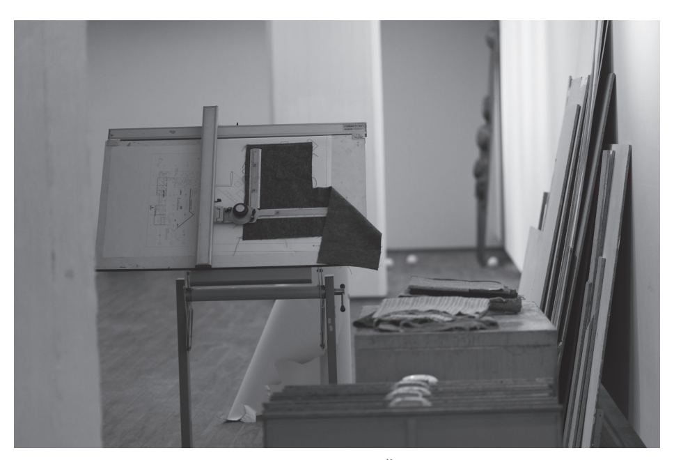
Fig. 4: The drawing-board