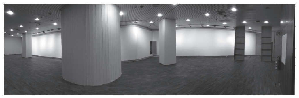
Fig. 1: The exhibition space (with the plaster column in the centre, without any additional objects)