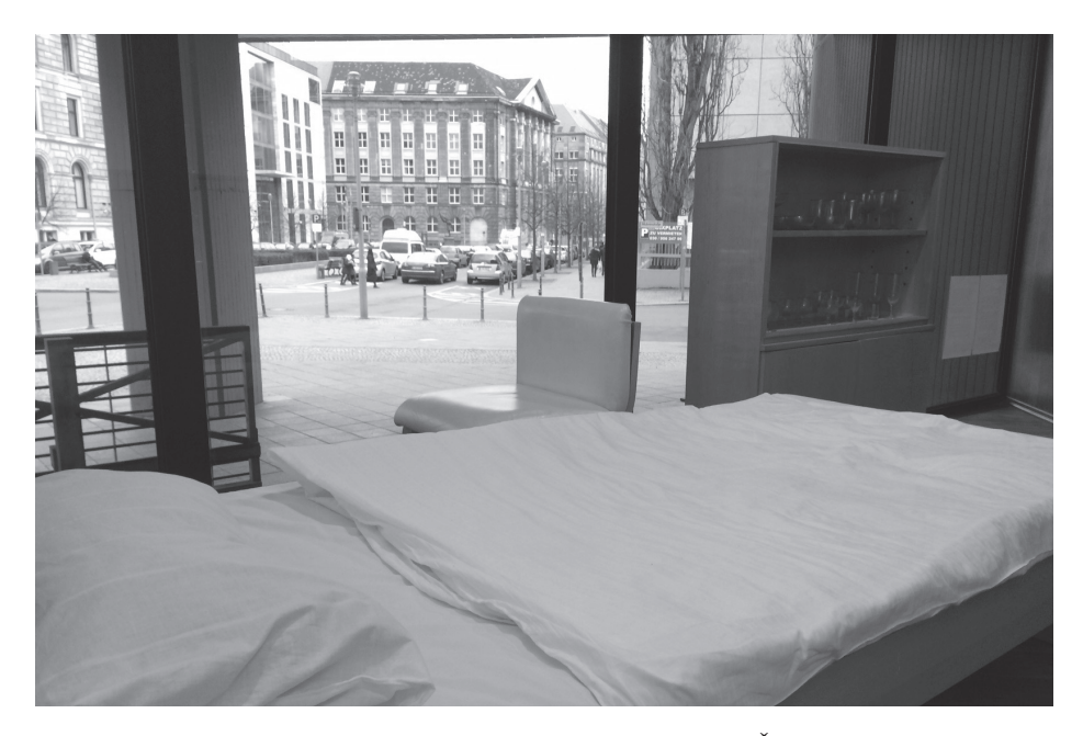
Fig. 8: The room - view from the room (daylight)

On the one hand it gives the impression of privacy and separation from the rest of the exhibition, and thus also the building, on the other hand this small simple tidy room creates a shop window. The bed can be used for visitors wishing to become part of the installation. The windowed wall of the room raises another interactive element of the installation; when people on the street outside, observe the room; back-dropped by their own reflections. Moreover, the glass wall of the gallery is situated close to metal gateway leading to the adjoining parking area of the embassy. The gateway is from time to time automatically opened and closed during arrivals and departures of cars, which is also reflected on the front wall of the room, adding to the feeling of an observed and exposed space. Last but not least, this fake room connects the whole exhibition with the building where