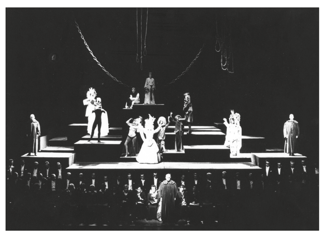
Fig. 2: A. Honegger: Joan of Arc at the Stake . National Theatre in Brno, 1969. IV. scene: 'Joan Given Up to the Beasts'.

open and more program-like in Brno. The line of political theatre did not come about without a link to Soviet theatre avant-garde or Rolland's People's Theatre. 11 The struggles with the censorship bodies were demanding and only certain pieces were successfully pushed through out of the planned titles. Opera, due to its highly stylized form which can soften any kind of political content, did not face such extensive censorship. Of course, the radical modernity of the dramaturgy and the staging method can be viewed as a political issue as by means of provocation it calls into doubt the audience and listening customs of the traditional opera public. A number of operas, however, acted as provocation merely from a thematic perspective. Even without any particular intention, operas such as The Nose, Wozzeck or The Condemnation of Lucullus, as recalled by certain participants, live on as a reference to the social and political atmosphere of the Normalization era. This is the way in which the staging of From the House of the Dead from the year 1974 was, for example, spoken about. It is known that Janáček's original conclusion had a pessimistic sound. After Gorjančikov is released from prison, the guard drives the other prisoners back into their cells. Later changes added an optimistic aspect in the form of the celebration of freedom. The return to Janáček's original