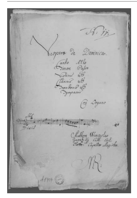
Fig. 1 Title page of the Guretzky's Vesperae de Dominica. Moravské zemské muzeum, Oddělení dějin hudby [Department of the History of Music at the Moravian Museum], call mark A 1717

Offertories, the records do not adhere to any particular rule. In some cases, the record provides a two-stave incipit of basso continuo and the soprano part, basso continuo and the initial part of the recitative, or only a record of the vocal part.