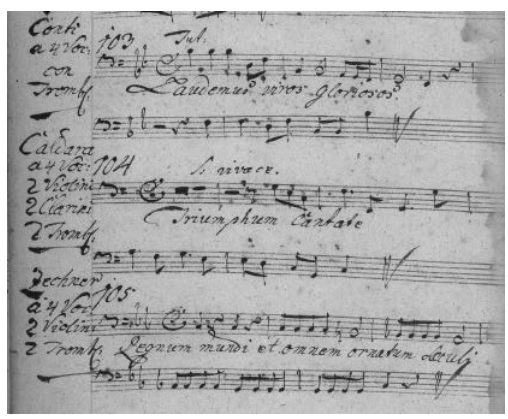
Fig. 2 An inventory record (main scribe), Archiv města Brna [Brno City Archives], fond V 2, manuscript no. 16/5

When elaborating the inventory, a distinctive feature of the individual compositions was apparently not their name: although the names are provided on title pages, they are not reflected in the inventory at all. This poses considerable difficulty when identifying the individual works in the amount of music sheets preserved up until the present. Ehrenhart's