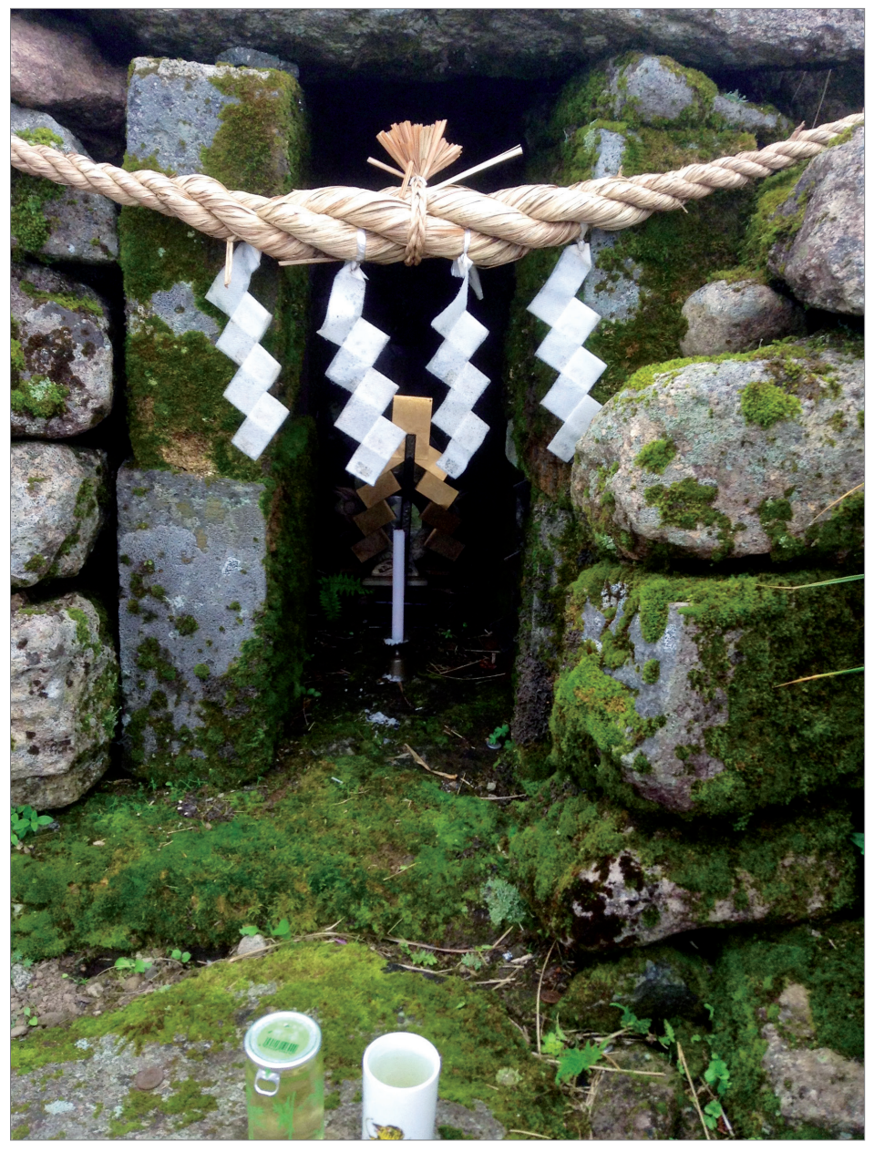
Fig. 45: A sacred spot at the top of Mount Gassan.