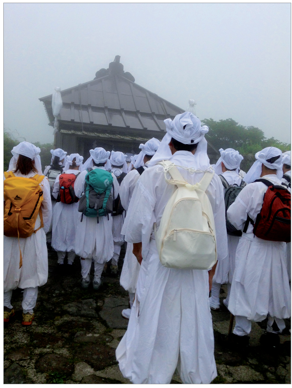
Fig. 46: Praying at Mount Gassan.