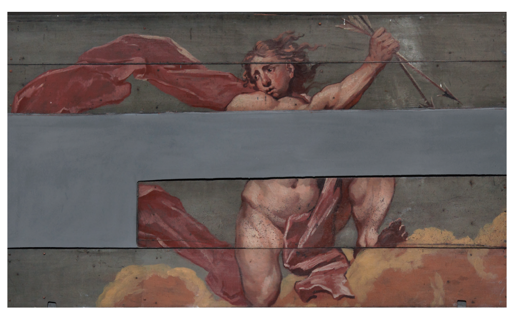
Fig. 4: Isaac Fuller, Resurrection (fragments), All Souls College, Oxford University.