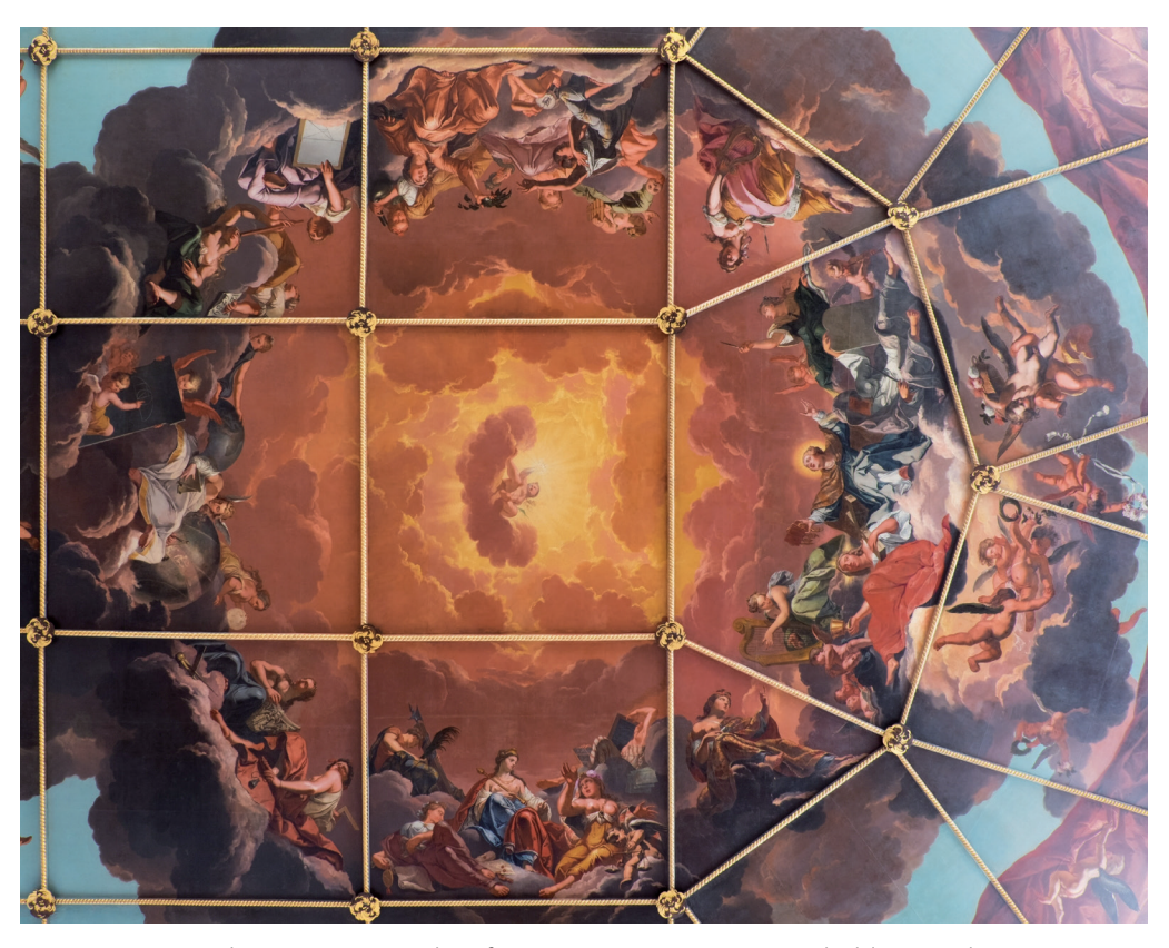
Fig. 6: Robert Streater, Ceiling fresco centrepiece (1670), Sheldonian Theatre, University of Oxford.

the three anti-virtues who are painted using a dramatic foreshortening which makes them appear to be tumbling from the sky. Indeed, surviving sketches of Jones's set design for Salmacida Spolia depict a figure of Discord who, as Geraghty shows, holds a clear visual correspondence with the figure of Streater's Envy (79).