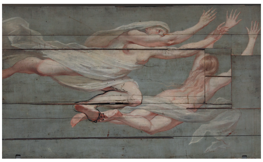
Fig. 3: Isaac Fuller, Resurrection (fragments), All Souls College, Oxford University.