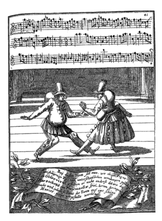
Figures 3 & 4: Prints from Gregorio Lambranzi's famous book of illustrations Nuova e curiosa scuola de' balli theatrali (New and Curious School of Theatre Dancing) printed in 1716 in Nuremberg. Two dancers on the left dance a sarabande, on the right two dancers perform a grotesque dance.

In the early years of the eighteenth century, the Italian opera was frequently criticized in London because some critics saw it as a foreign import sung in effeminate language which corrupted the English taste, English music, and theatre tradition (a case in point is John Dennis's An Essay on the Opera's, After the Italian Manner, which are to be Established on the English Stage: with some Reflections on the Damage which they may bring to the Publick from 1706). Were there instances of objections based on the artform's national origin in connection to the French dancing style or French dancers? Was French dancing ever viewed by the English as foreign in a negative way?