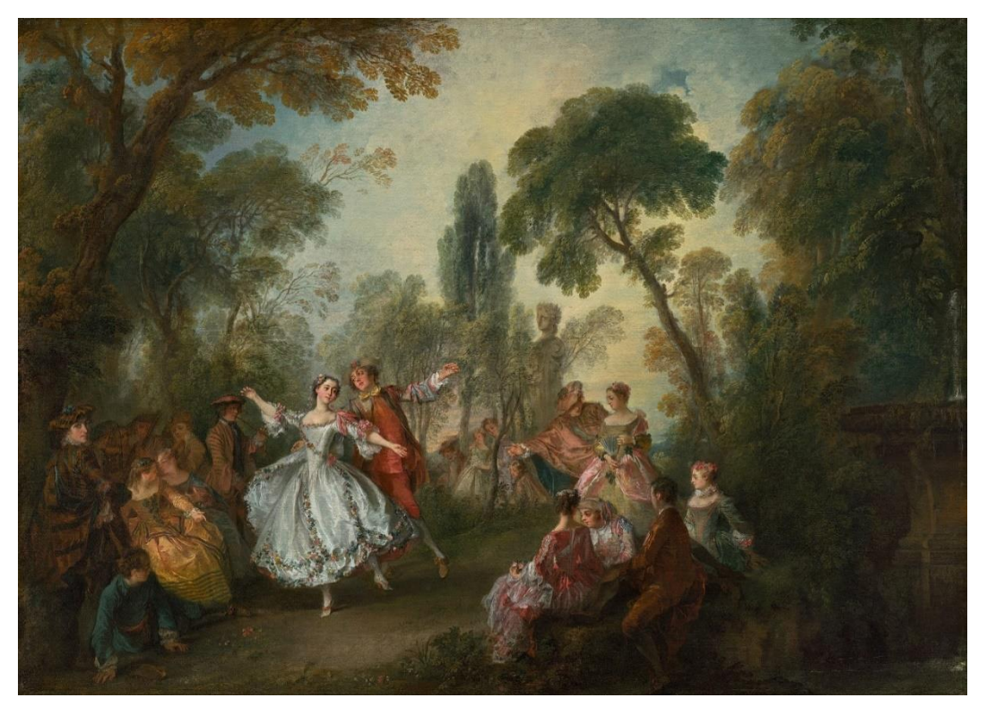
Figure 1: French dancer Marie-Anne de Cupis de Camargo, a ballet star of the Paris Opéra, painted by Nicolas Lancret in a stylized scene in a pastoral opera (c. 1730)

MG: In London's theatres, relatively little time was given to dancing during each performance, but it often ran through the whole evening – notably in the entr'actes, but also within plays (tragedies as well as comedies). From the 1670s it was included in dramatic operas, a few of which survived in the repertoire well into the eighteenth century, and from the late 1710s dancing was an integral part of pantomime afterpieces. The lack of evidence about performances during the late seventeenth century makes it difficult to chart changes and developments before the early 1700s, but there was certainly more dancing in London's theatres following the opening of the Lincoln's Inn Fields Theatre in 1714. The surviving newspaper advertisements and playbills show that dancing remained an important feature of theatre performances into the nineteenth century.