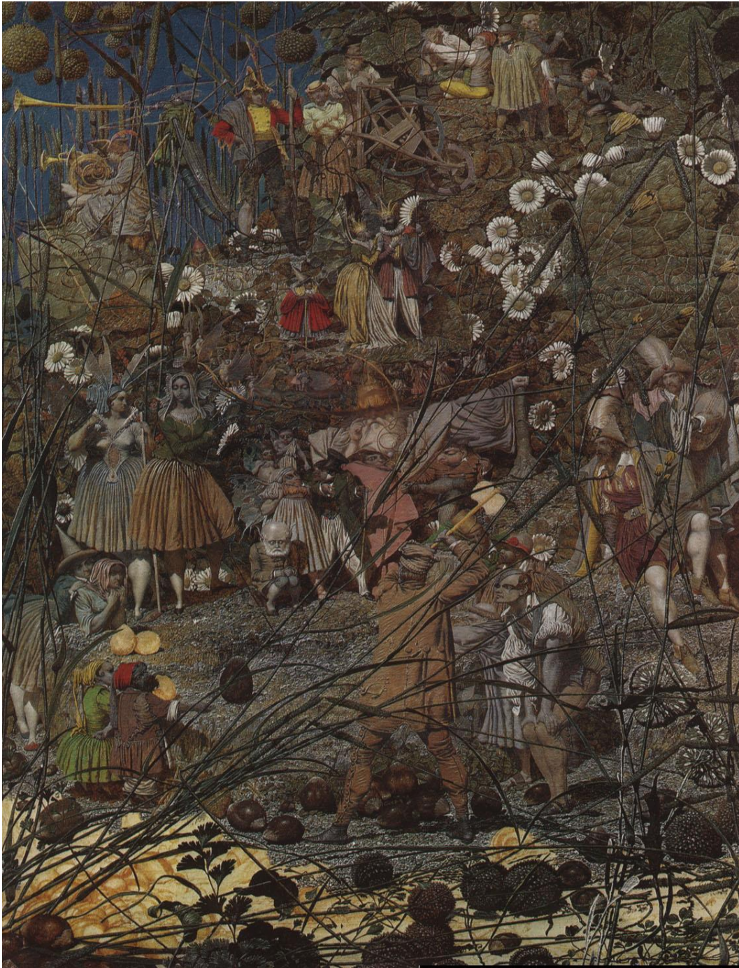
Figure 1: Richard Dadd: The Fairy Feller's Master-Stroke.