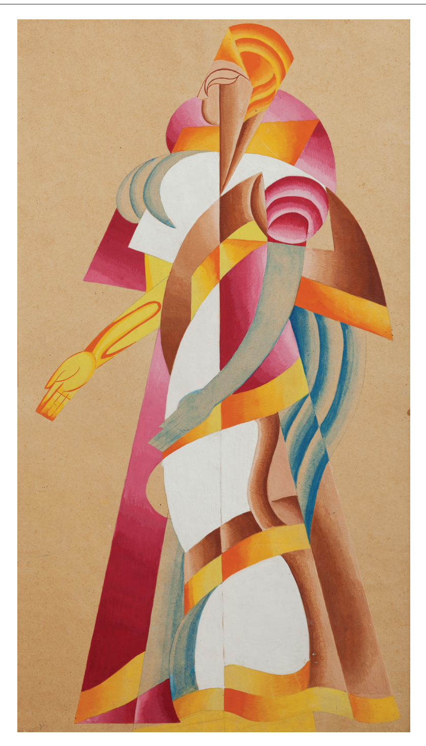
Fig. 1: Vadym Meller. Costume design for the Assyrian Dances , 1919. Museum of Theatre, Music, and Cinematic Art of Ukraine, Kyiv.