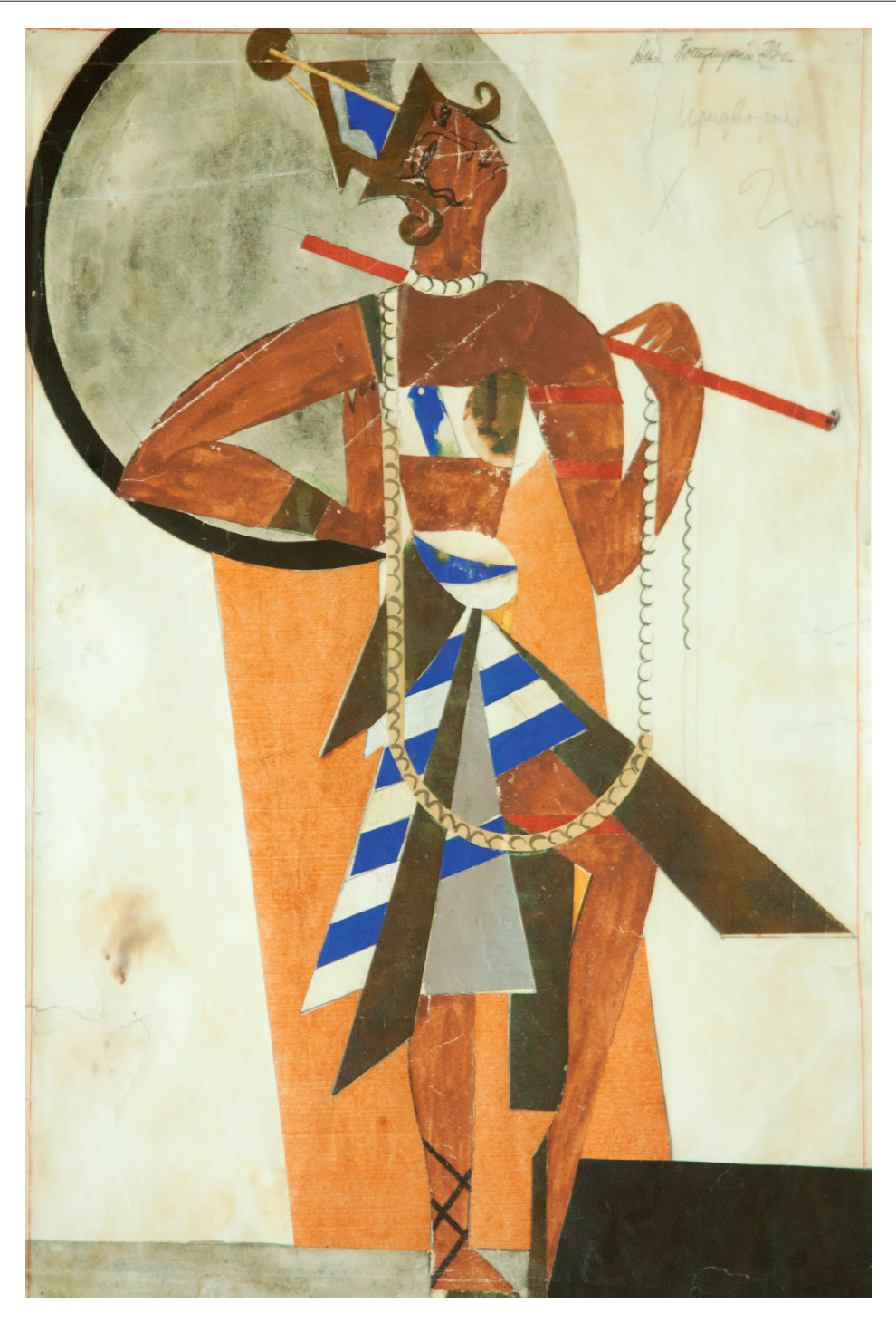
Fig. 2: Anatol Petrytsky. Costume design for the Nur and Anitra performance, 1923. National Culture, Arts, and Museum Complex 'Mystetskyi Arsenal', Kyiv, Ukraine.