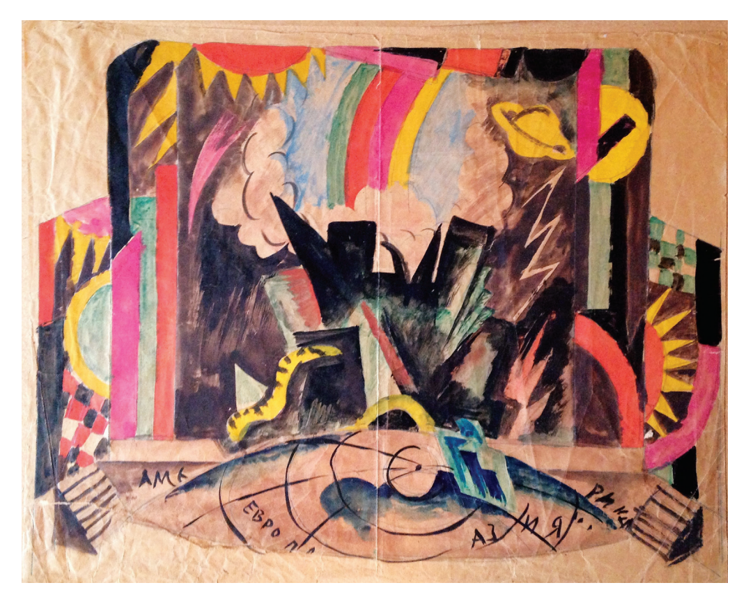
Fig. 5: Oleksandr Khvostenko-Khvostov. Set design sketch for the production of Mystery- Buff , 1921. Central State Museum-Archive of Literature and Art of Ukraine, Kyiv.

of the Jews against the Romans, led by Bar Kokhba, responded to the mood of the 1920s in Kyiv. According to Shor, the idea of abstract forms' dynamic plasticity corresponded to the aesthetics of the theatre of symbolist expressionism to the utmost. A stepped podium with different-in-height platforms unfolded along the entire width of the stage which went down, dissolving in the darkness of the stage. Wedge-like, pointed forms, on the contrary, came out and advanced from the blackness of spatial gaps, appearing as threatening, crushing, almost destroying with their mass. Their asymmetry and monochrome colour, combined with spots of red and blue or red and gold, intensified the tragedy of the production.