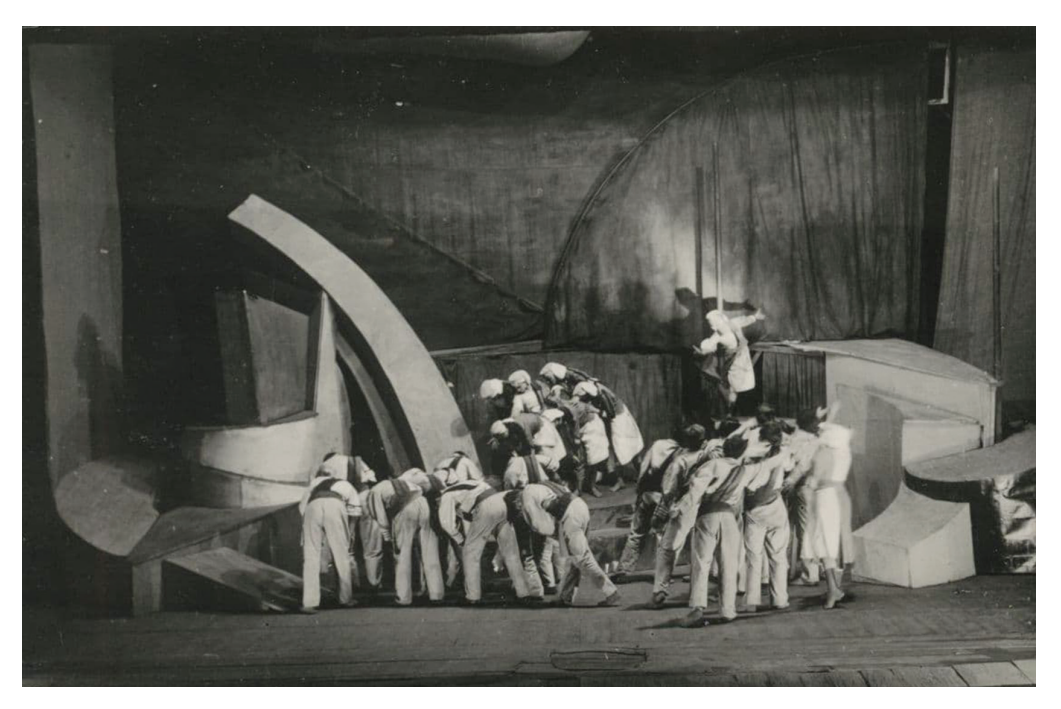
Fig. 4: Scene from the play Gas , 1923. Scenography by Vadym Meller. Museum of Theatre, Music, and Cinematic Art of Ukraine, Kyiv.

'nakedness' of structures and their subordination to functioning tasks, allowed Kovalenko (1992: 18) to define Vadym Meller's design for Gas as the first pro-constructivist project in Ukrainian scenography in the early 1920s.