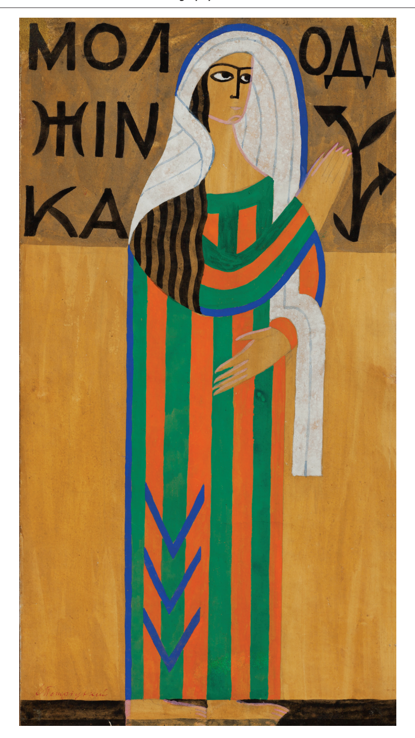
Fig. 3: Anatol Petrytsky. Costume design for In the Catacombs production based on the play by Lesia Ukraïnka, 1921. Museum of Theatre, Music, and Cinematic Art of Ukraine, Kyiv.