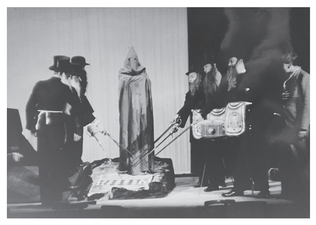
Fig. 3: The Treasure of the Jesuits in the Liberated Theatre: The Freemasons (JHFPA No. 069a).

the last Tableau, a grotesque exaggeration of the Freemasons, represented as members of the Ku Klux Klan (see Fig. 3).