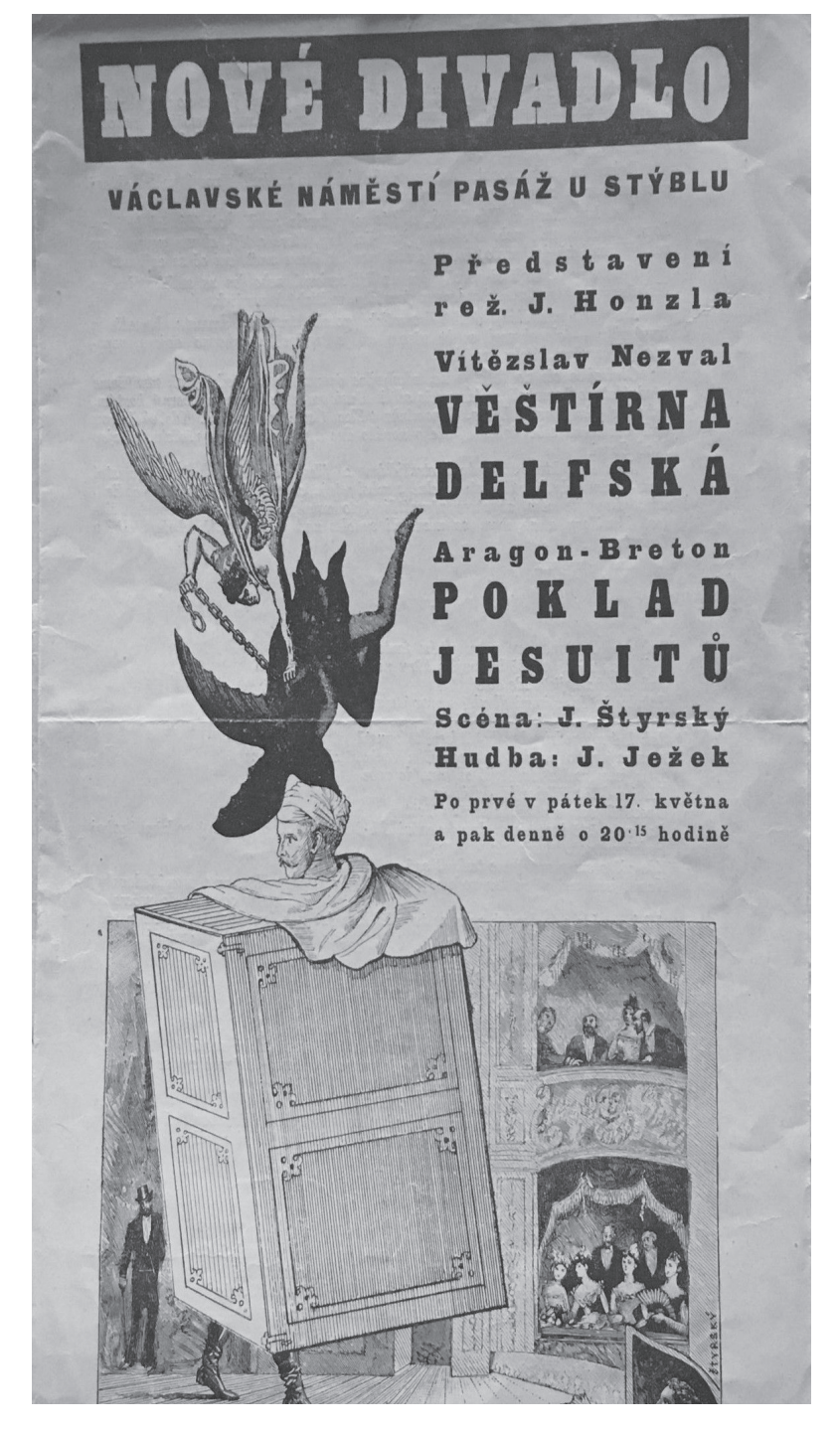
Fig. 5: The Treasure of the Jesuits/The Delphic Oracle. Programme. Illustration by J. Štyrský (JHFPA No. 069a).