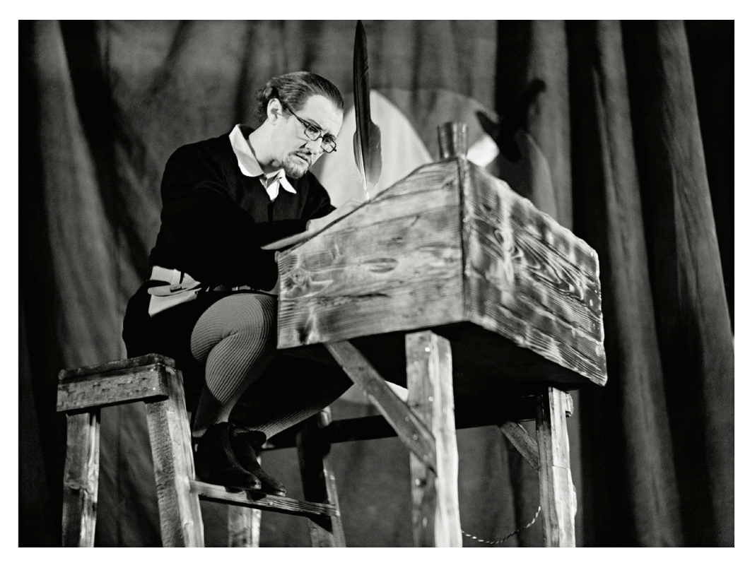
Fig. 14: Teacher Gustav behind the clerk's table.

(the prison and the mayor's chamber), Wachsman applied similar comic principles to those typically employed by the duo, such as their inversion of the meaning of the words soldier and thief, which formed the basis of the comedy of the image in the Yberland forest. Similarly, Wachsman's choice to transform the clerk's table into a podium highlighted the grotesque acting in this scene, as did Voskovec and Werich's use of an axe instead of a knife to cut cheese into narrow slices (Fig. 15) (PTÁČKOVÁ 1998: 228).