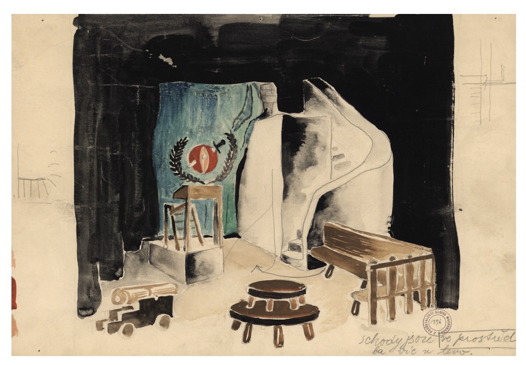
Fig. 13: The town hall, Wachsman's set design for Heavy Barbara (H6D-5089). Collection of the National Museum, Prague, Czech Republic.

453). It is worth mentioning that Feuerstein's style also inspired the scenography for Nebe na zemi [Heaven on Earth] (1936), which was created by Voskovec and Werich themselves. The duo likely discovered a stage form among Feuerstein's sets that closely corresponded to their needs and ideas, and then drew on it in later productions, even when Feuerstein did not collaborate, including Heavy Barbara . The sets of all these plays were based on the continuous transposition of a stable number of objects of scenic architecture on stage; their covering, uncovering, and varied decorating; and the verticalisation of the stage space through elevated ramps, stairs, and ladders.