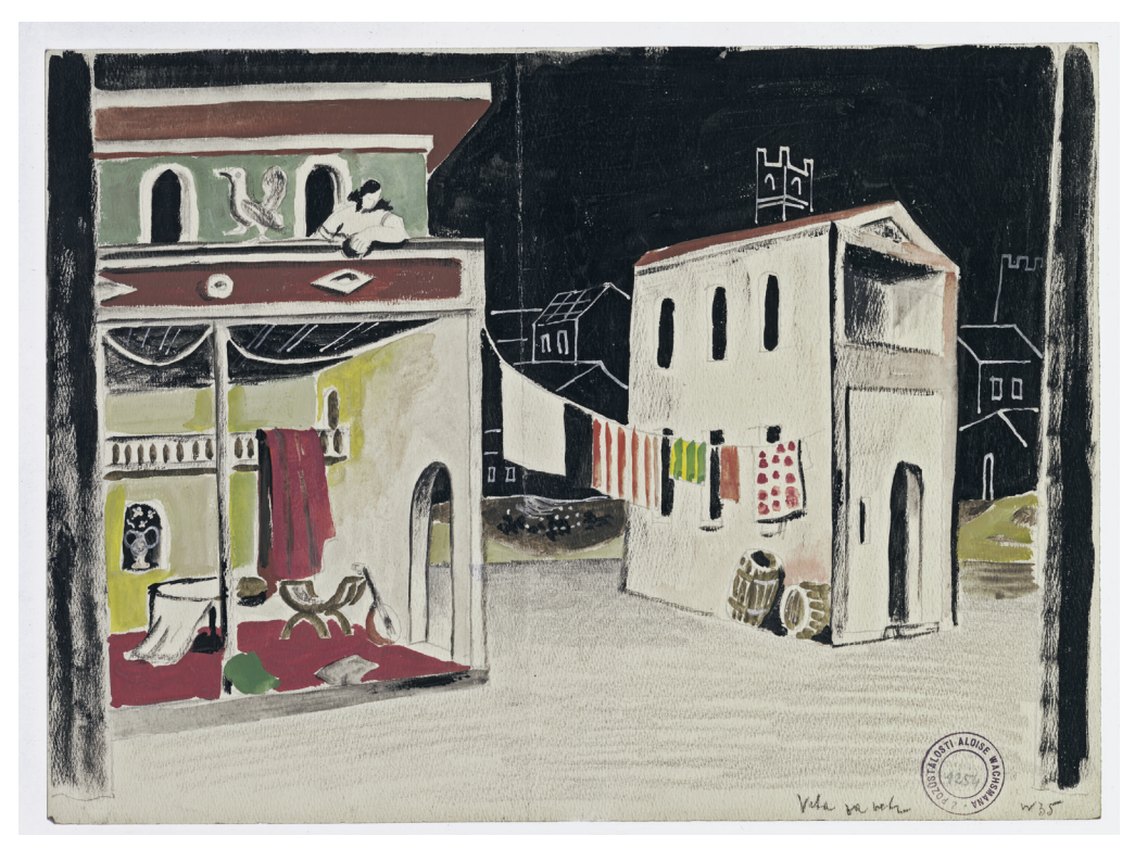
Fig. 1: Wachsman's set design for Measure for Measure . National Theatre, 1935. Theatre Archive of the National Theatre, Prague, Czech Republic.

however, did not capture a Flemish town or its parts with all the details found in Brueghel's work; rather, he chose a few solitary objects (typically houses), which he placed in a stylised form in the scene. Wachsman's stage designs for other plays, including Veta za vetu [Measure for Measure] (National Theatre, 1935) and Lazebník sevillský [The Barber of Seville] (National Theatre, 1936), employed a similarly unusual spatial composition and use of solitary buildings (PTÁČKOVÁ 1982: 160) (slightly resembling some paintings by Chirico).