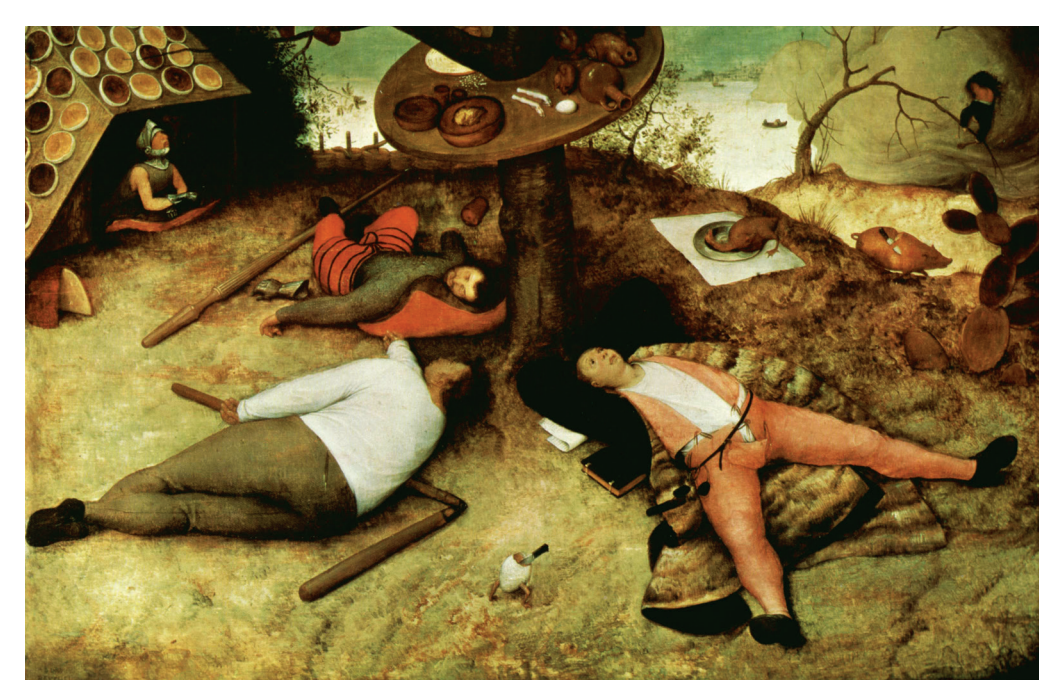
Fig. 3: Pieter Brueghel the Elder. The Land of Cockaigne , 1567. Alte Pinakothek, Munich, Germany.

Brueghel's paintings are crowded with objects which appear in unusual places and lose their normal functions. They are not, however, absurd decorations, but symbols providing essential information about the depicted world and/or the bearer of the object. For example, a dislocated kitchen and household utensils or dishes act as symbols of individual sins and perversions of this world: a spoon behind the ear is a symbol of gluttony and greed (e.g., The Peasant Wedding, The Peasant Dance, The Fight Between Carnival and Lent ), etc.<sup>12</sup>