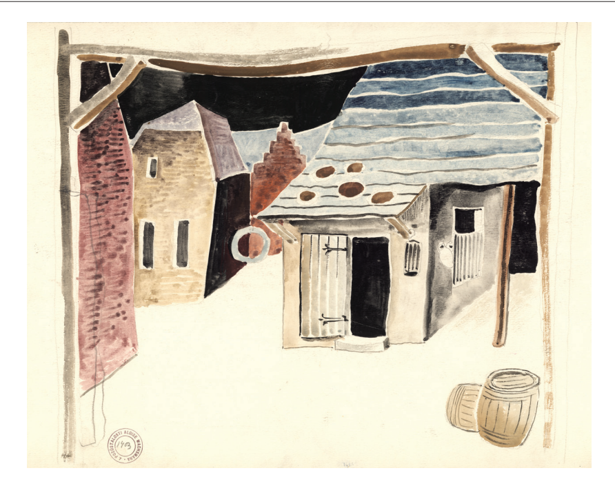
Fig. 6: In front of the inn. Wachsman's set design for Heavy Barbara (H6D-5091). Collection of the National Museum, Prague, Czech Republic.