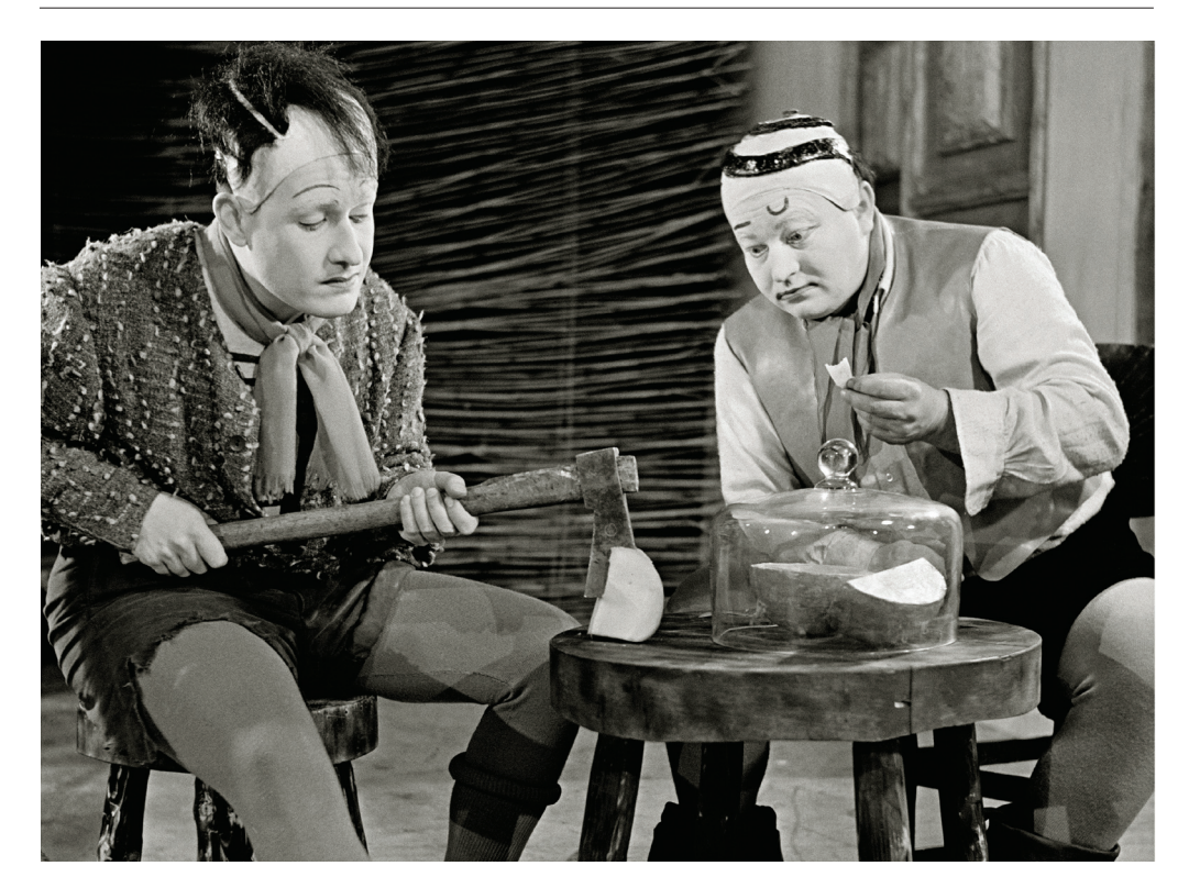
Fig. 15: Voskovec and Werich as mercenaries.

Wachsman further achieved comic effect through surprising contrasts (mostly high and low), which is considered a cornerstone of Voskovec and Werich's comedy, and which many of their scenographers tried to express through their sets (PTÁČKOVÁ 1982: 228). For example, in Zelenka's set for Caesar , the Doric columns do not form part of a temple or other magnificent building but adorn swimming pool cabins (PTÁČKOVÁ 1982: 228); in Executioner and Fool , Feuerstein and Wachsman decorated the prison (the execution block and guillotine) with flowers. Wachsman used this principle in Heavy Barbara , for example, in the city emblem of Eidam composed of a round loaf of red cheese, a (silver) sword, and laurel twigs, embroidered on a curtain in the courtroom of the town hall (Fig. 13). The design of the emblem (as well as the prison with flowers) offers another example of Wachsman's contribution to Voskovec and Werich's poetics of hovadno . 19