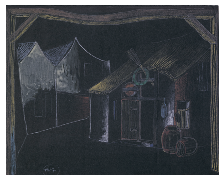
Fig. 4: In front of the inn. Wachsman's set design, likely for Heavy Barbara . Theatre Archive of the National Theatre, Prague, Czech Republic.