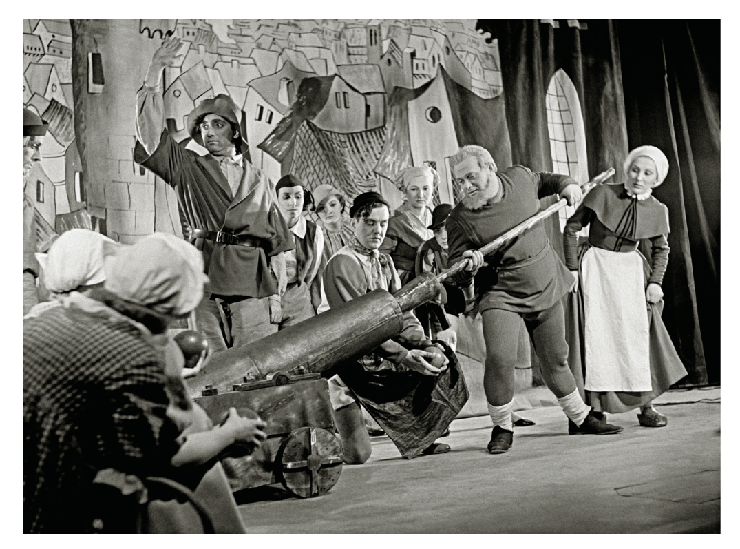
Fig. 16: Wachsman's painted curtain.

technique, Nezval used an apt expression for the alternation of perspectives: a view through binoculars and a view through a microscope (EFFENBERGER 1974: 198). This analogy perfectly characterises Wachsman's set design, in which 'everything – the painted town, the tavern inside and out, the thick wall of the prison [...] – fit[ted] and complement[ed]' (FISCHEROVÁ 1937: 13).