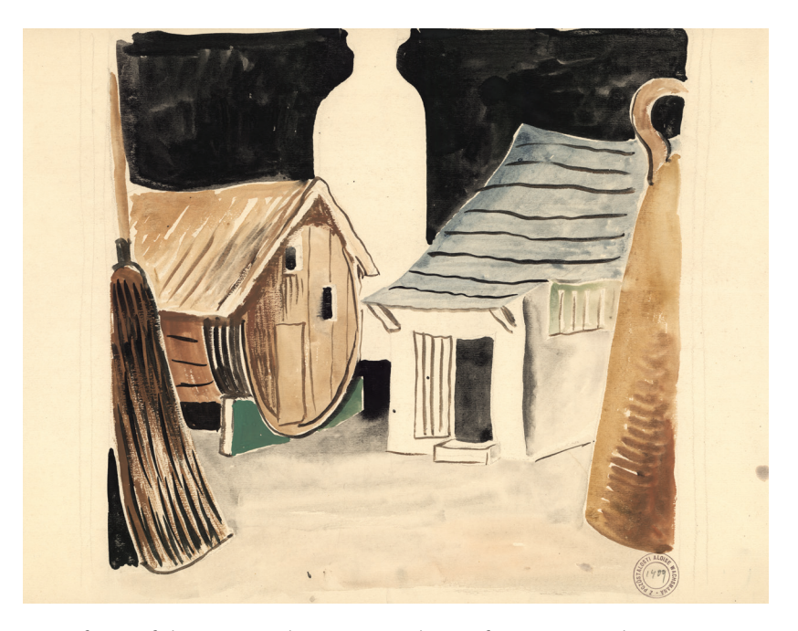
Fig. 5: In front of the inn. Wachsman's set design for Heavy Barbara (H6D-5088). Collection of the National Museum, Prague, Czech Republic.