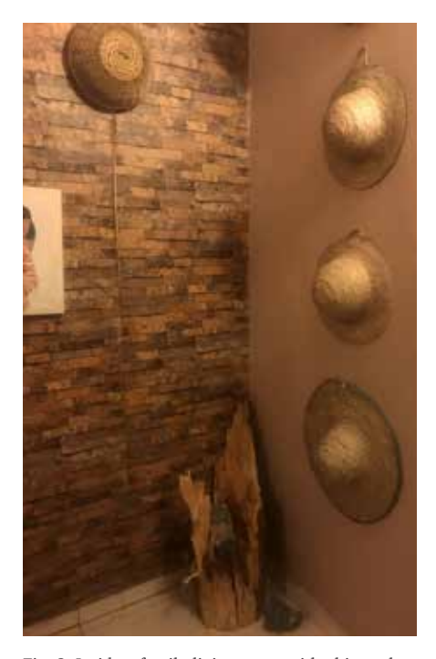
Fig. 2: Inside a family living space with objects that can attest to cultural history.

Museums in Nigeria will be described on three levels: home, shrine and palace (family, religion and government). Understanding these three levels that depict the private, private/public, and public museum will provide a glimpse into how the people perceive and represent their culture which is not aligned with the colonial concept. Museums are not an unfamiliar phenomenon in African culture to which Nigeria belong, as their concept addresses different levels of representational, interpretation and educational spaces. All that represents identity, family history, culture and a sense of place and belonging in Africa