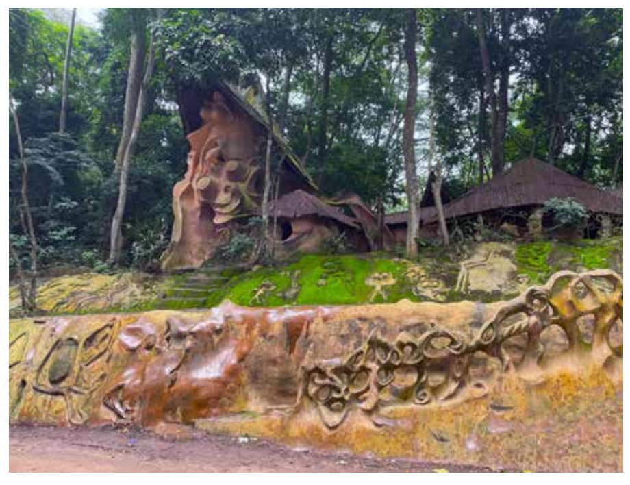
Fig. 4: Osun Osogbo groove as an example of a decolonised indigenous museum without wall.

acknowledge and highlight the diverse indigenous cultures in existence before the arrival of Europeans. Such acknowledgement implies inclusion of indigenous guidelines regarding modes of representation of their material culture. With visitor numbers constantly decreasing to school groups, Nigerian museums need to find ways of encouraging inclusion that will likely kickstart the process of decolonisation. Potential visitors need to see themselves as stakeholders to contribute to the emancipation process.