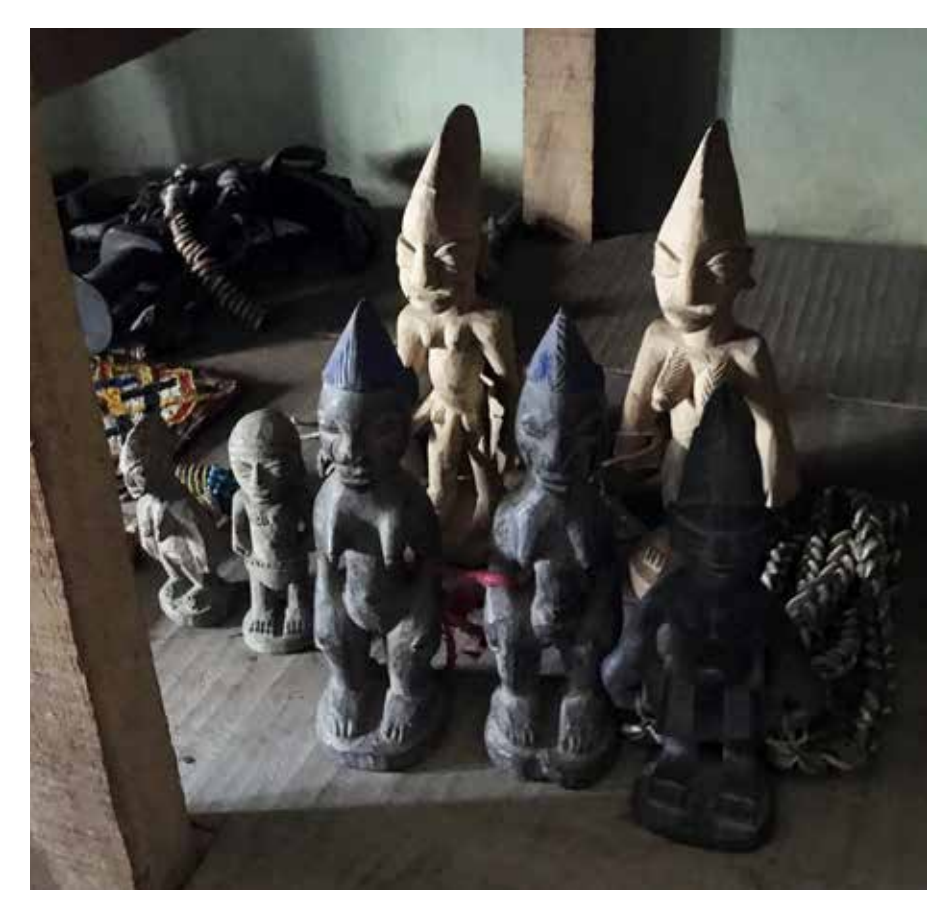
Fig. 3: Some collections in storage in public museum.

spoons, mortar, pestles, combs and stools. ^{\rm 34}