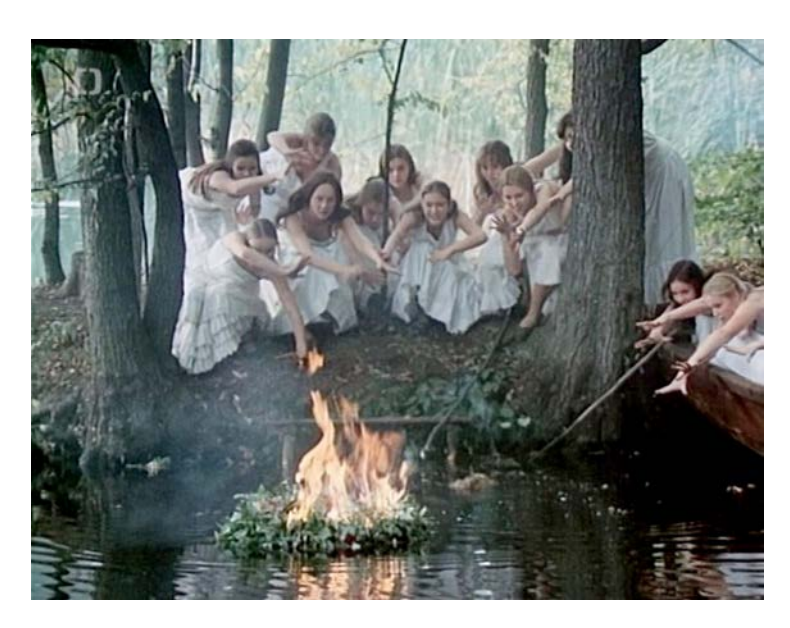
Fig. 5. Forest rituals (third movement). Source: Antonín Dvořák: Symfonie č. 9 e-moll, op. 95. "Z nového světa" [film]. Directing Vladimír Sís. Czechoslovakia, 1977.