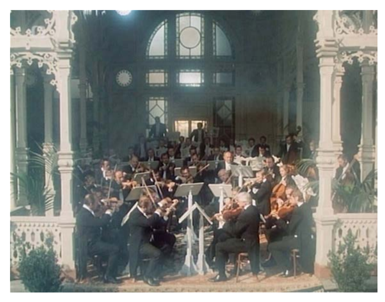
Fig. 4. Stylized concert shots.