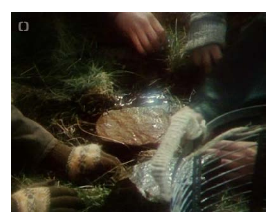
Fig. 6. Exterior scene showing the cleaning of wells.

With the second film, Dvořák's Symphony No. 9 , The Opening of the Wells shares folklore elements and a rural environment. Scenes depicting the ceremony of cleaning wells, as well as studio shots, are permeated with folk themes.