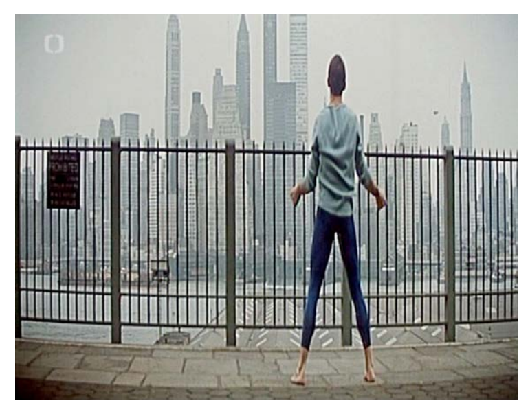
Fig. 1. New York City sequences.