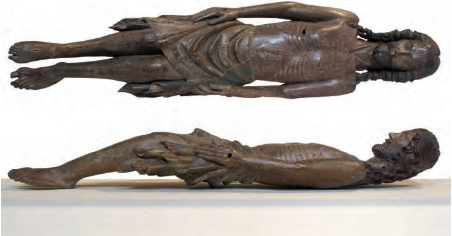
Illustration 3. Christ from the Holy Sepulchre in České Budějovice, around 1360. Front and Side View. Alšova jihočeská galerie, Hluboká nad Vltavou.

takes longer than expected and, on reaching the church door, the participants find it closed. A manuscript dating back to 1400-1409 is also part of a group of liturgical handbooks with this different agenda, having also the rubric concerning the top of the mount, but failing to mention the use of an ass (RATAJ 1999: 24-25, note 2; Národní knihovna , VI Fc 35).