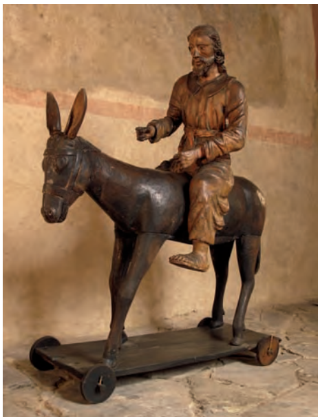
Illustration 1. Christ on an Ass Pulled During the Palm Sunday Celebration. The figure of Christ dates to the eighteenth century, the ass is of an earlier date; condition in 2009. Muzeum středního Pootaví , Strakonice.

The sacred object was destroyed in this astonishing action; nevertheless, the remarkable tradition of the procession with a statue of Christ on Palm Sundays resumed in the same way after the end of the Hussite Wars. Liturgical books preserved in great numbers describe the events of a ceremony of this sort regularly held in St Vitus Cathedral. 2 They were published at the end of the fifteenth century as imprints in a form that codifies the programme of performance throughout the previous century. Hence, in a breviary published in 1492, 3 it is first recorded that in the Church of St