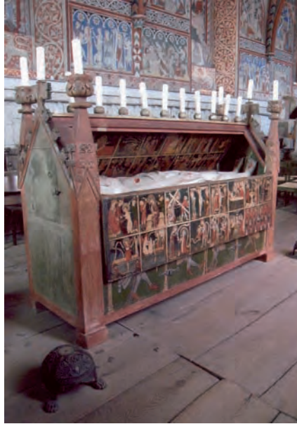
Illustration 10. A Portable Wooden Holy Sepulchre with the Figure of Christ. The Cistercian Monastery in Wienhausen, around 1290, repaired in 1448.

same can be assumed of Olomouc Cathedral). It is also likely that two statues were used this way in St Thomas Monastery in Prague. Following the already-mentioned entry regarding Christ's sculpture, destined for the Sepulchre, the 1409 inventory mentions two statues of the Resurrected Christ placed on the altar, a small one and a big one. 54 One interesting testimony about the arrangement of these kinds of statues is provided by a 1407 inventory of the Church of the Holy Spirit in Hradec Králové, which gives an entry 'with tunic' for the statue of the Resurrected Christ. 55 The statue itself is not mentioned here, so one can only imagine how this robe was intended to augment its realistic appearance.