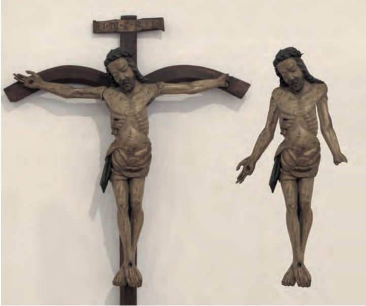
Illustration 6. Crucifix. Christ with Movable Arms to be Placed in the Easter Sepulchre, Boletice near Český Krumlov; around 1450, and as Fixed on the Cross with Outstretched Arms.

that above it, placed in the wall, was the skull of Bishop Andrew (EMLER 1884: 401). 26