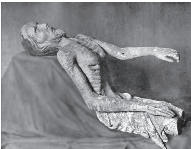
Illustration 9. The Pietà of Lásenice near Jindřichův Hradec. The Removed Figure of Christ. The National Gallery in Prague.

to a cross with bow-shaped arms, was also found in the small village of Boletice near Český Krumlov (Ill. 6-7). 46 Here, the local, originally Romanesque, Church of St Nicholas was modified at the end of the fifteenth century, at which time the presbytery and sacristy were rebuilt (POCHE 1977: 98-99). If the sculpture was made for this church and not for some other church in nearby Český Krumlov, then it could have been sculpted for the purpose of rebuilding. Even so, the existence of the Boletice crucifix could be a reflection of a similar practices performed in one of the other Český Krumlov churches.