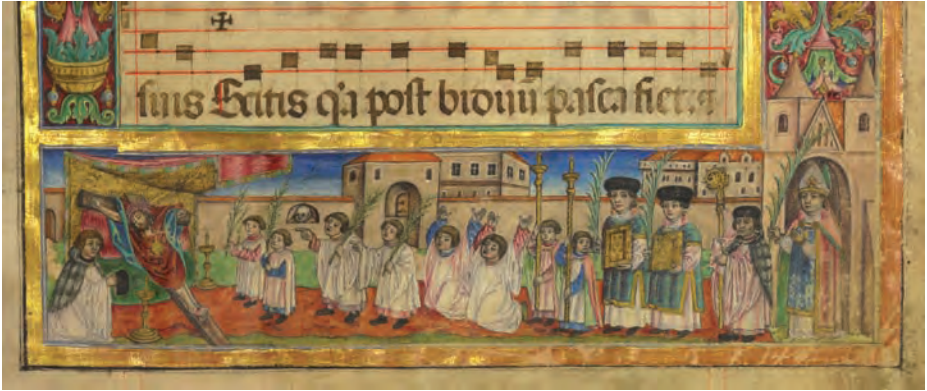
Illustration 2. The Procession on Palm Sunday, Setting Out from St Wenceslas Cathedral in Olomouc. Zemský archiv v Opavě – department Olomouc, collection Metropolitní kapitula Olomouc , CO 89 ( Passional of Jan Kalivoda ), 1525, fol. 1a.

that the procession came in through the gate of the town or the castle whilst, as it entered, the cantor chanted the response Ingredeinde Domino . The term ‘ intraverint portas civitatis vel castris ’ may accordingly indicate a single location for both events (if Prague Castle is to be understood in the older terminology to be civitas ). Otherwise, the procession would have had to enter the city first (in this case through Malá Strana) and from there progress through the south gate to the Castle grounds. Given that this gate was already walled up in the fourteenth century, this seems unlikely; so the procession had probably to gather somewhere near Strahov (an interpretation of the term ‘on top of the mount’), or on the north forefield of the Castle (at this moment symbolising the Mount of Olives, whence Christ descended into Jerusalem) to set out from there to the west gate of the Castle.