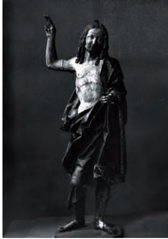
Illustration 13. Master of the Doksany Altar, The Resurrected Christ Intended to be Pulled on the Ascension Day Celebration, around 1521.

an idea of the intimate nature of performances of this religious celebration. As in the case with many ‘portable’ statues of Christ, the most important fact is missing for this statue: its provenance. 70 A similar difficult case is that presented by the statue of a Resurrected Christ from the Cistercian Monastery in Lusatian Ostritz. This is the earliest extant example with a characteristic iron ring still present in the top of the head, dating back as early as to around the mid-fourteenth century, and so the possibility of it originating in Bohemia is noteworthy. It might originally have come from the Cistercian Monastery in Tišnov (near Brno), which in the nineteenth century already belonged to this Lusatian monastery as a secularised complex. This may be attested to by its formal outlines, ascribing the statue to the work of the Master of the Madonna of Michle, or his workshop. 71 Uniquely then, it could be possible to associate this statue with a still-existing performance location, because