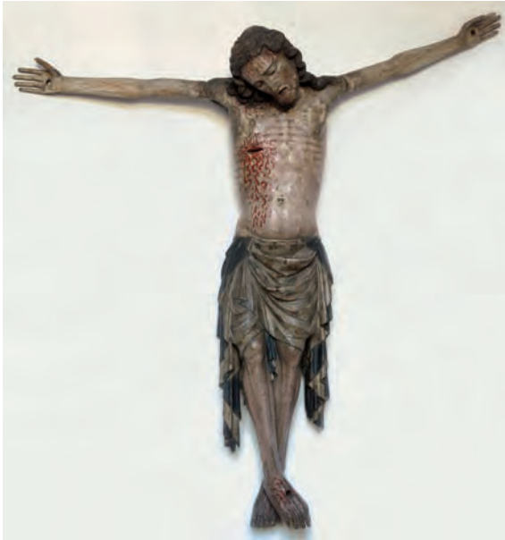
Illustration 4. Crucifix. Christ with Movable Arms to be Placed in the Easter Sepulchre from the Church of St Benedict at Hradčany in Prague; around 1350.

end of the fourteenth century). The fact that the St Peter at Vyšehrad manuscript was adjusted in line with contemporary St Vitus breviaries is also attested to by a rubric concerning the ass, written down in its already adjusted form (including the Saviour's statue and omitting the part concerning the bringing out of relics). The pulling along of the wooden statue of Christ mounted on an ass was thus also produced in Prague by the end of the fourteenth century at St Peter at Vyšehrad, and it is possible that it was at this time that the practice was first introduced, together with the St Vitus liturgy.