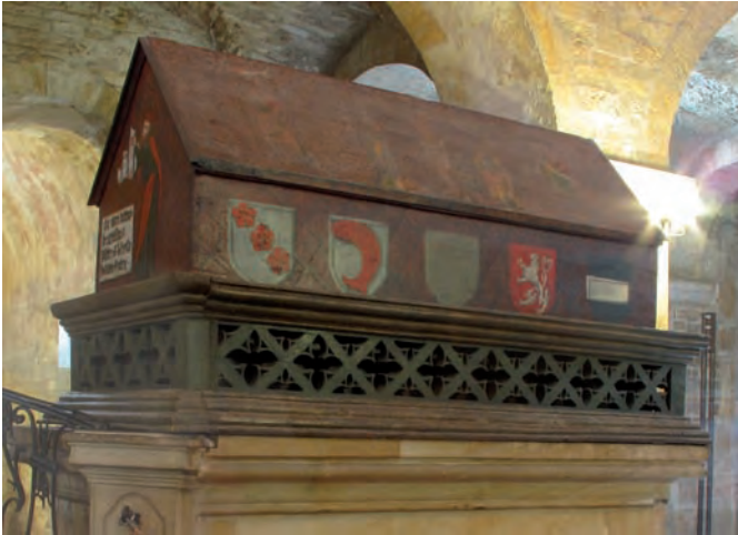
Illustration 11. The Tomb of Duke Vratislav in the Former Benedictine Church of St George at Prague Castle.

used on its own: laid in the Sepulchre or stood upright on the altar (BARTLOVÁ 2007). 58 The figure of Christ in a Pietà that originated in Cheb in West Bohemia also presents the Saviour as a separate figure; however its present condition does not make it possible to judge whether there was any intention here to use Christ's body in isolation, or whether the separation of the two elements of the sculpted ensemble was merely a result of construction procedures (ŠEVČÍKOVÁ 1974: 43, Tab. 1-2).