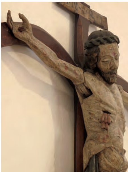
Illustration 7. Crucifix. Christ with Movable Arms to be Placed in the Easter Sepulchre, Boletice near Český Krumlov; around 1450. A Detail of the Joint Mechanics. Alšova jihočeská galerie , Hluboká nad Vltavou.

as it logically corresponds to the time at which the construction of St Wenceslas Chapel was completed (i.e. 1367). The chapel itself can thus be identified in the Romanesque basilica by the narrow space between St Wenceslas Chapel and the lobby behind the main entrance, 28 where the altar that concerns us probably also stood. It also seems that the Sepulchre of St Gaudentius was also removed from the demolished eastern crypt and placed here in the chapel. This was evidently only a temporary measure, because the altar and this Sepulchre were then moved to the western part of the basilica due to the construction of the new St Wenceslas Chapel. An inventory of 1415 also lists the altars of St Bernard and Our Lady of the Snows (TOMEK 1872: 246), while the St Gaudentius Sepulchre probably found its place in the western part of the basilica. 29