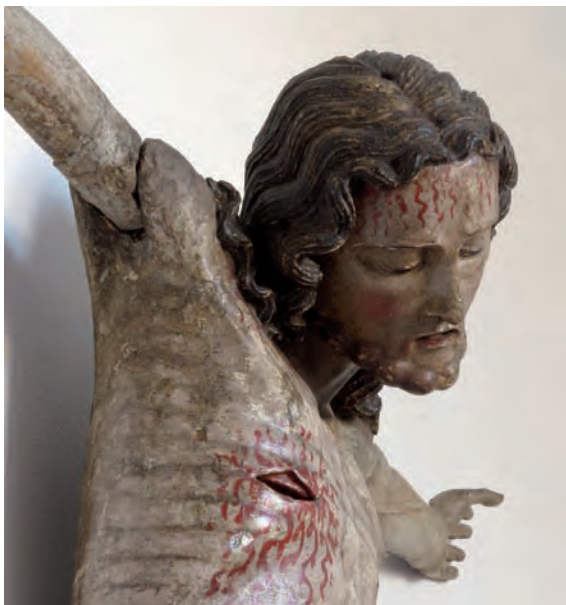
Illustration 5. Crucifix. Christ with Movable Arms to be Placed in the Easter Sepulchre from the Church of St Benedict at Hradčany in Prague; around 1350. A Detail of the Joint Mechanics.

of St John. Here, a surviving statue (Ill. 1), somewhat unconventionally, consists of two parts: an ass and a Christ that sits atop the animal as a separate object. The two sections of the whole date from different periods (a Baroque-style Christ probably dates back to the early eighteenth century, whereas the ass statue is older and is carved from different material). 20 Despite the aforementioned proximity of the Church of St Procopius to German-speaking lands, it is nevertheless possible that the practice of pulling the Palmesel at this site could have been a reflection of Prague ritual. The above-cited breviary of the Church of Our Lady below the Chain (where the practice was also said to have taken place) had in fact been, since the Hussite Wars and therefore up to the 1470s, in the possession of the Strakonice Commandery, from whence it returned to Prague (PETR 1990: 51). If the use of a Palmesel was not general practice in the Order of St John, it could have been introduced in Strakonice as a result of use of this breviary. What is also interesting in this case is the character of the Strakonice sculpture (i.e. the fact that it consisted