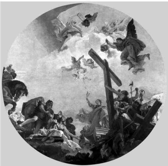
Fig. 2: Giambattista Tiepolo, The Discovery of the True Cross , 1745 ca., Venice, Gallerie dell'Accademia.