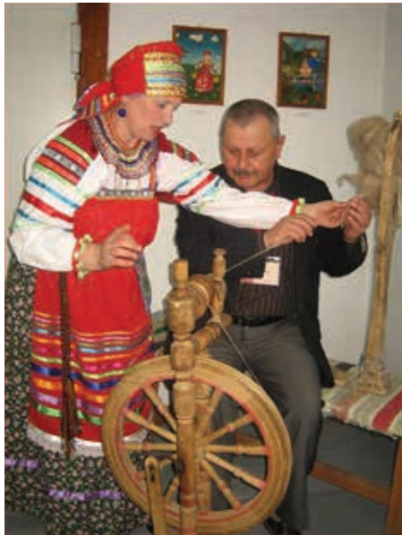
Local History Museum in Zhelannoye village.