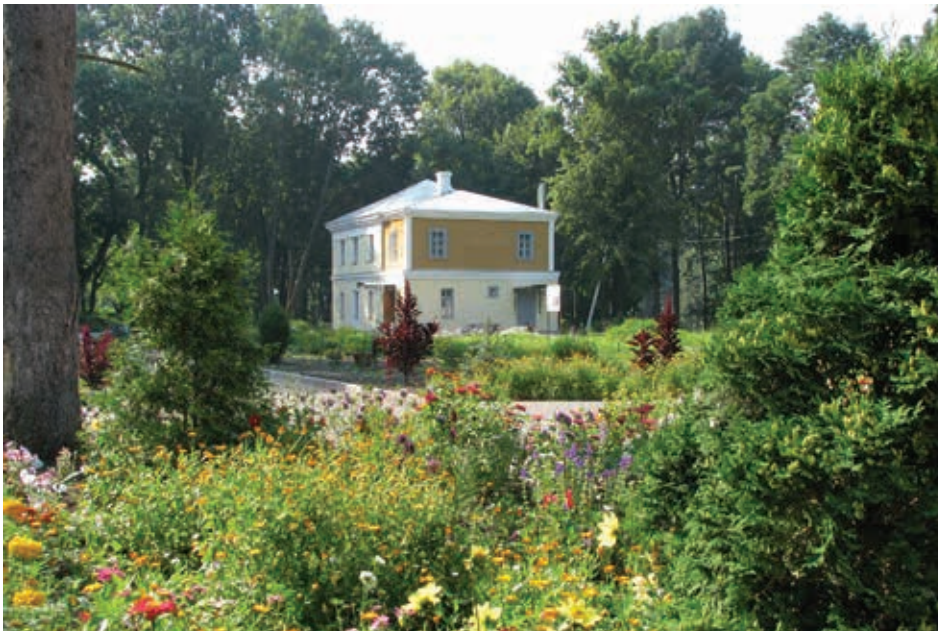
Estate of Sergey Khudekov.

resources for developing local areas and expand regional museum network 3 .