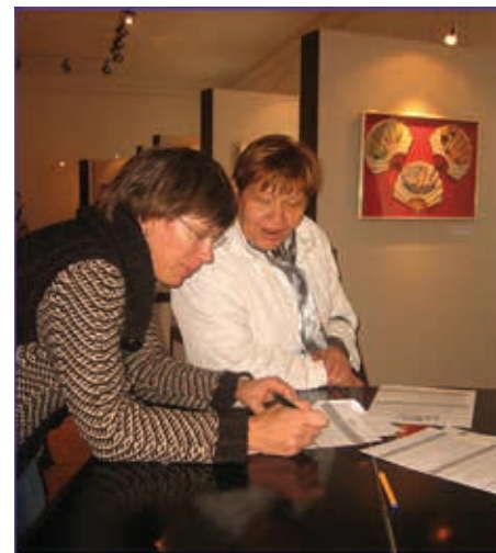
Study of museum audience in the Ryazan Museum-Reserve

In the Ryazan region, several museum-type facilities were created and gradually trans-