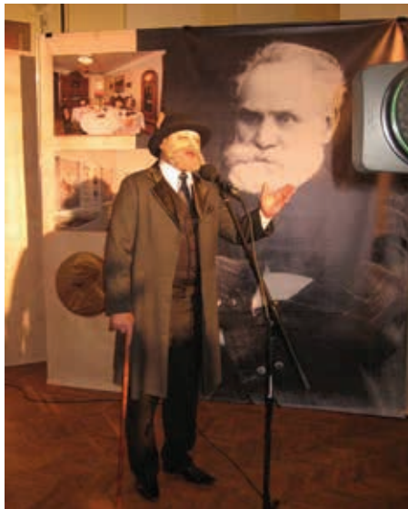
A travelling exhibition of the Year of the museums in Ryazan region (2013).

and documents), thus presenting the historical heritage of the entire region.