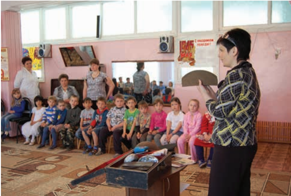
Historical Center of Local Lore in Shatsk.