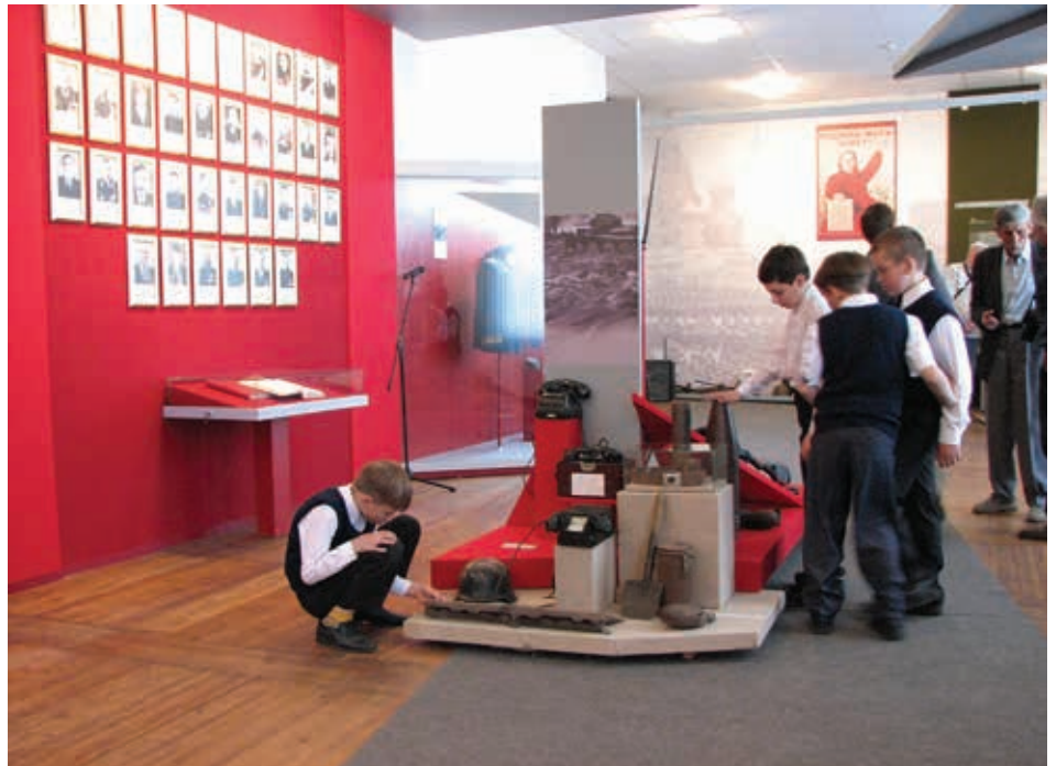
Pupils in the Local History Museum in Skopinsk.

Astafieva, O. (2013). Regional'naja kul'turnaja politika [Regional cultural policy]. In Chuvilova, I., & Shelegina, O. (Eds.), Novicii v muzejnom mire. Muzej kak kommunikacionny'j protocol. [Innovations in Museum World. Museum as a Communication Protocol. Collection of scientific articles] . (pp.11-23). Novosibirsk, Russia: NGU.