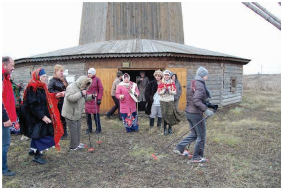
Windmill in Shatsk District.

In 2007, the Historical Cultural Environmental Museum Estate of Sergey Khudekov was created in the Ryazan region. The museum is located in Korablinsky district 30 km from the regional centre of Skopin. Today reconstruction works are being conducted in order to restore the historical outlook of the estate, develop service infrastructure, and preserve and reconstruct a unique local arboretum (botanical garden). The example of this museum speaks for the growing interest of population in new museum institutions and forms of heritage presentation. At a time when the attendance rate was in its decline during 2008–2010, only this museum (along with Tsiolkovsky Memorial House ) was able to raise this index to 6.2 thousand visitors per year (the population of Korablinsky district being 22.9 thousand people).