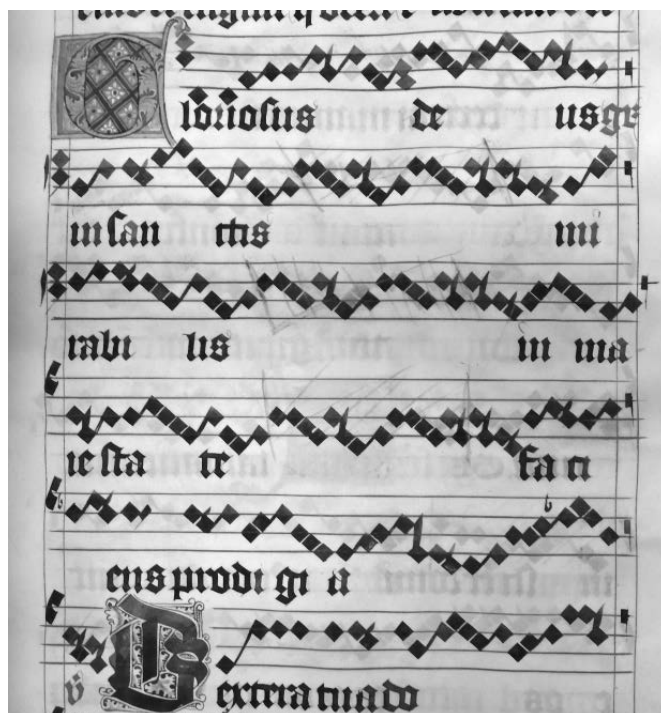
Fig. 3. AMB, V 2, Gradual no. 1, f. 227r – example of melisma shortening.