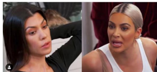
Figure 5 a screenshot of a meme posted on the Instagram profile “ripannanicolesmith” recreating the conversation of the Kardashian sisters while referencing a theory of Roland Barthes.

Kim: “You just THINK that all men are trash because you keep CHOOSING shady men! Maybe if you had actually READ Roland Barthes, you would know that language is never innocent. What does ‘man’ even mean?!”