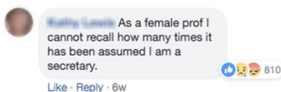
Figure 3 A screenshot of a comment reacting to the post in Figure 1.

As can further be observed in Figure 3 (Shit Academics Say 2018), which presents an excerpt from the discussion that was prompted by this post on the Facebook page, the community does not merely post memes to entertain its audience, but rather uses the entertainment as a channel through which vital academic experiences and issues of sexism, racism, professional mistreatment, and many of those already mentioned before, including depression or alienation, have a chance to be presented