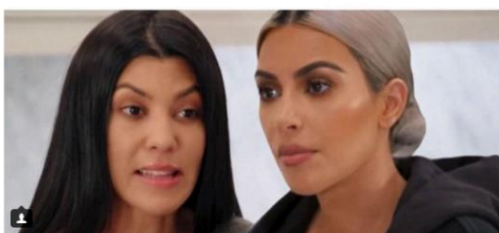
Figure 4 A screenshot of a meme posted on the Instagram profile “ripannanicolesmith” recreating the conversation of the Kardashian sisters while referencing a theory of Marshal McLuhan.

"I don't want to be a Kardashian anymore. Our Twitter fanfic fights—that you orchestrated after doing close readings of Marshall McLuhan and his thesis that advertising is the greatest art form of postmodernity—are making me want to die." -Kourtney Kardashian (2018)