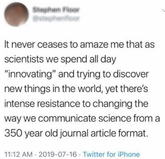
Figure 2 a screenshot of a picture posted on the Facebook page Shit Academics Say describing the accessibility and approachability of academia.