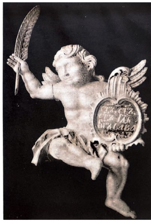
Figure 3: Eighteenth-century Wooden Putti Sculptures. Source: Hryhorii Pavlutskyi, On Representations of Putti in Wood Carvings of the Southern Russian Lands in the 17th and 18th Centuries, Kyiv 1904.

it is this playfulness that, for Pavlutskyi, was definitive when he sought the first putto in art. The first one he named was the Boy with a Goose. Children were, of course, depicted earlier, but for Pavlutskyi this particular boy embodied the playfulness and childish boldness that every putto possesses. Conversely, the temporary 'death' of the putto in the Middle Ages he attributed to an absence of playfulness, which was then rediscovered later.