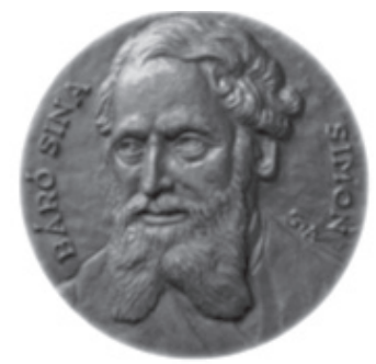
Figure 3. Simon Sina medal. © Nikos Fokas

This is obviously a rich heritage that the current Greek minority in Hungary has incorporated into its ethno-cultural identity as its own tradition. However, of course, its identity is still fundamentally defined by the fact that it is a community that emerged after arriving in Hungary due to the Greek Civil War. Next, I will present some characteristic details of this community. This phase of the presentation consists of three parts. First, I discuss the main facts of the arrival and reception. These are well-known and well-researched stories