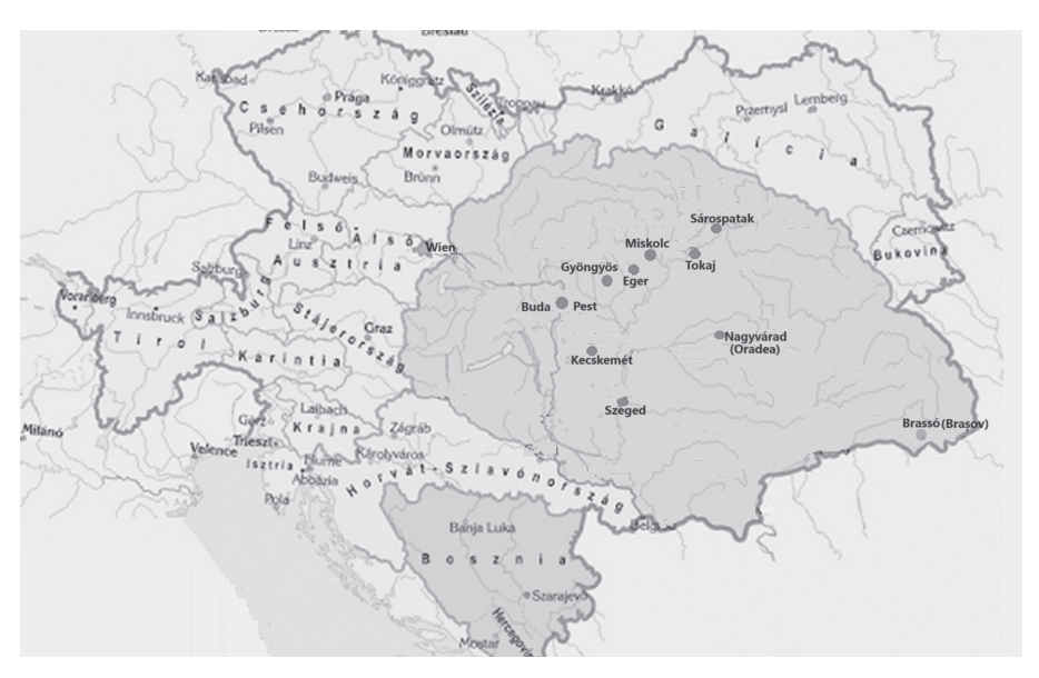
Figure 1. Greek communities (see the dots) in the Kingdom of Hungary during the 17<sup>th</sup> and 18<sup>th</sup> centuries.

The building of the "Bridge of Chains" started in 1839, with Count István Széchenyi, a descendant of a noble family, as the originator and George Sina as