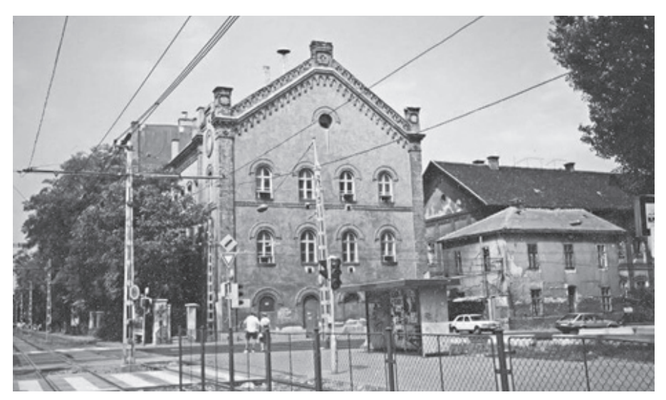
Figure 4. The main entrance of the "Tobacco Factory" in 1963.

The first apartment we got in the Tobacco factory... it was a 4 \times 3 -meter apartment, a 4 \times 3 -meter room, two beds, where I slept in one bed with my sister, and my father slept in the other bed with my mother.