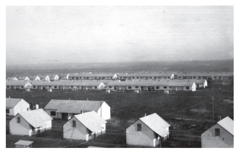
Figure 6. The Greek village under construction. © Vlachos - Raptis - Fokas (eds.) 2017.

Petridis and Fokas, who were in Poland. Petridis was a mechanical engineer, and Fokas was an architect; so that they could participate in constructing a Greek village. The construction of the village began in May 1950 (cf. Figure 6). The first inhabitants of the Greek village - as it was called then - moved in in November 1950. This village, named the village of Beloiannisz after the execution of the communist martyr, still exists today, and Greeks, even though they are minority, still play a dominant role in the life of the village.