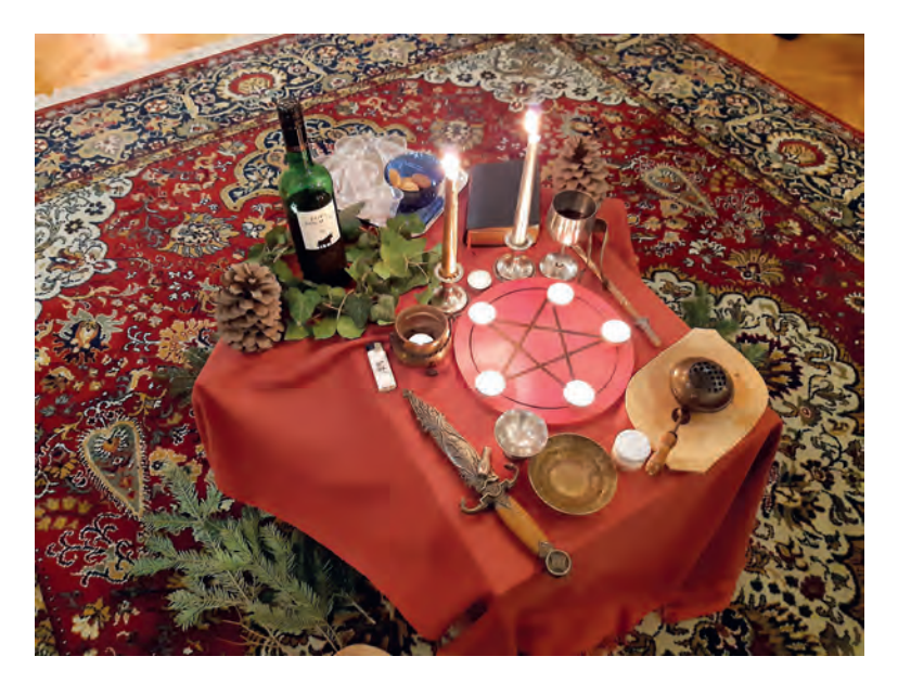
Fig. 2. Objects seen are a pentacle, an athame, a chalice, wine, candles, salt, and Book of Shadow

I saw a Berkano Wicca coven's altar during an open ritual of the winter solstice in Budapest in December 2021 (Fig. 1). Such objects included a red wooden pentacle as the focal point of the magical circle; an athame representing the masculine aspect of the universe; a chalice or a glass representing the feminine aspect; and several candles on the altar, two of them representing the God and the Goddess, and four in the cardinal directions calling the protectors or personifications of North, West, South, and East. I also saw incense being burned, salt both on the altar and to create a magic circle, wine and cookies (both for offerings and for the communal feast), a magic wand, and some plants as a representation of nature. This picture is a typical example of what a coven's altar looks like during a ritual (Fig. 2). However, such features are not all obligatory and can vary from coven to coven, and even between rituals during the year.