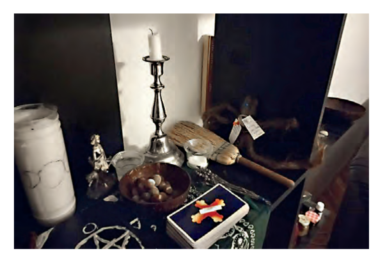
Fig. 5. Objects seen are a broom, tarot cards, and voodoo doll made of hair

This occasion should be considered a privilege, as commonly, a witch would not want to share their sacred space – because of its private, sacred nature, and because it is connected with a sense of belonging and connection to the spirit and higher entities. Another interviewee put pictures of their loved ones on the altar, as well as a necklace inherited from their grandmother. He said it acts as a portal to the spiritual world so that they can communicate with the dead and keep the connection from afar.