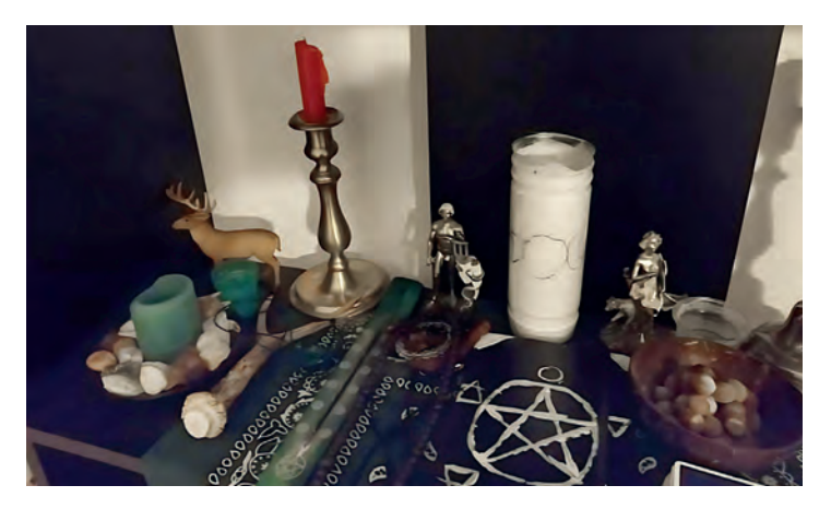
Fig. 4. Objects seen are a pentacle, idols, candles, crystals, and incense