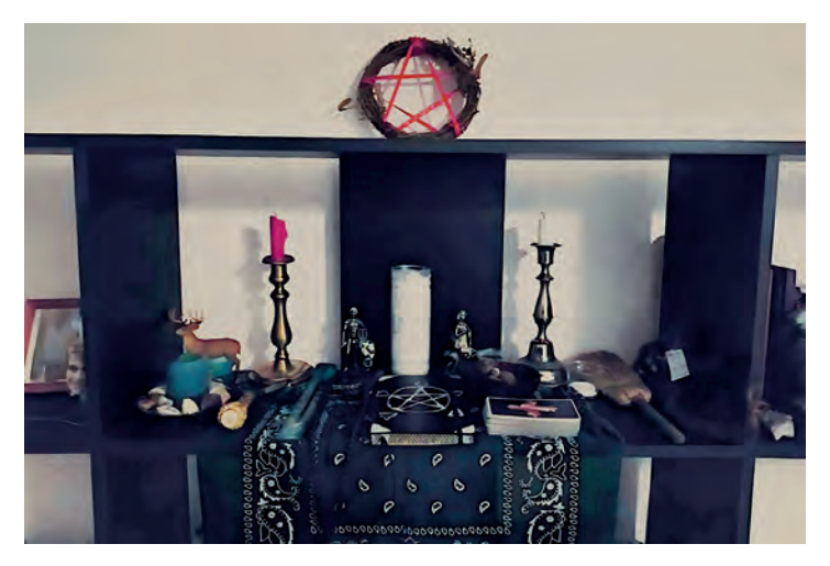
Fig. 3. Private home altar of a Berkano student

to share photos<sup>50</sup> of their altar and explain the presented image in depth and with personal meanings (Fig. 3). We can see at the pictures the objects this person uses on his home altar, such as pentacles, candles, idols, a broom, a tarot deck, and a voodoo doll made of hair (Fig. 4 and 5).