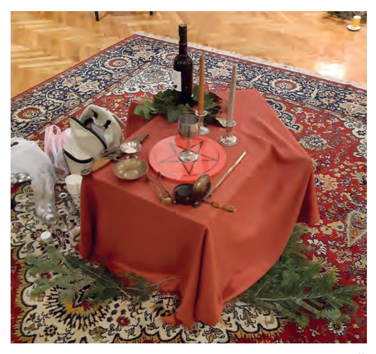
Fig. 1. A Berkano Wicca altar during winter solstice ritual<sup>49</sup>

For solitary Wiccans, the ritual is even more personal, unique, flexible, and individualistic in nature. They make a salt circle and take out all of the objects from their home altars. But there is no itinerary regarding what they should do chronologically. They make it as flexible as possible to accommodate their needs; sometimes they just perform the ritual to attain divination, help, or guidance, or to celebrate the sabbaths. One of my interviewees performs their ritual in private; nobody may enter the room or disturb them during spellcasting or meditation. An interviewee told me that he performs the ritual naked because he believes that it will appeal to the Goddess and God he works with.