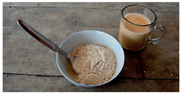
Fig. 1. Tibetan tsampa ready to be mixed with tea, Lower Mustang, Nepal ^{16}

Consequently, we searched for a particular food which was fundamental or inevitable for all missionaries but, at the same time, largely alien to Tibetan food culture. This requirement led us quite directly to bread as a staple food of the Bible and a key concept in Christianity but somewhat unlike the omnipresent Tibetan tsampa (rtsam pa) – a roasted barley flour, which was and still is the Tibetan staple food and also the key ritual foodstuff (Fig. 1). And since Moravian missionaries, as the principal translators of the Tibetan Bible, were so dutiful in their work, an intriguing topic immediately manifested itself. Thus, and therefore, this paper deals with the question of how these early translators (and their successors) approached the concept of bread and its transfer into Tibetan culture, thereby asking why tsampa was not considered as a suitable local equivalent. And, by extension, is it even possible to think of tsampa as such a parallel for the Biblical bread – either as a staple food (i.e., the daily bread or food in the Lord's Prayer) or as a sacrament (i.e., the bread or Eucharist in the Last Supper)?