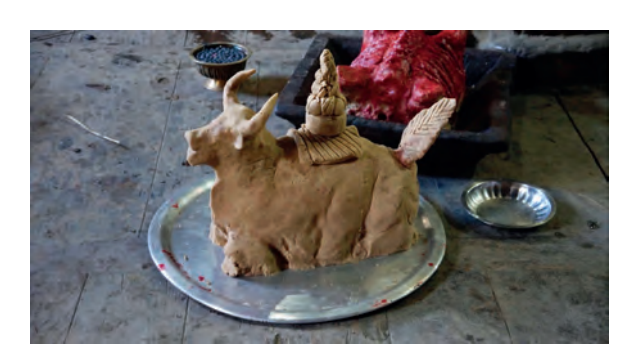
Fig. 3. Tsampa used for effigies in an annual ritual in Lubra village, Mustang, Nepal<sup>53</sup>

However, it is tsampa which is often being regarded as the Tibetan identity marker per se – both in Tibetan and Western discourses.<sup>54</sup> As early as in the 18<sup>th</sup> century, Ippolito Desideri remarked: "They do not eat wheaten bread, but zamba [= tsampa], which is the flour of ground parched barley mixed with a little water, generally hot, into very small balls which they eat with their meat."<sup>55</sup> Similarly, when Berthold Laufer questioned Odorico de Pordenone's presence in Tibet, he did so by confronting Odorico's notes on the abundance of bread and wine in Tibet with his own experience: