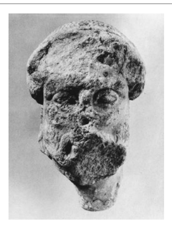
Fig. 1. Head from a Herm, Inv. no. S 211, Agora museum of Athens. An Early Classical herm, battered on the face and beard (after Harrison 1965)