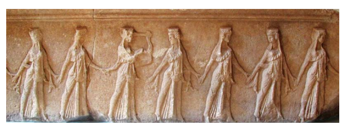
Fig. 8. The Samothrace frieze, Inv. No. 2455, Louvre. A relief depicting a row of dancing maidens (after https://commons.wikimedia.org/w/index.php?curid=102595)