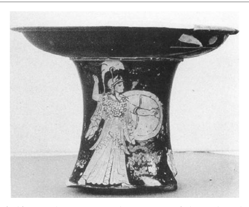
Fig. 5. Neck of red-figure oinochoe, Inv. No. 14793, The Agora Museum of Athens. Archaistic depiction of advancing and striding Athena (after Harrison 1965 )