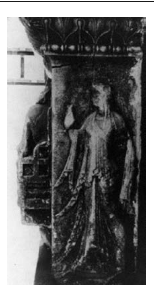
Fig. 6. Epidaurus Base relief, Inv. No. 1425, National Archaeological Museum of Athens An archaistic figure holding an oinochoe, probably Hebe (after Fiolitaki 2001 )

Obr. 6. Reliéf z Epidauru, inv. č. 1425, Národní archeologické muzeum v Aténách. Archaizující postava držící oinochoé, pravděpodobně se jedná o Hébé (podle Fiolitaki 2001 )