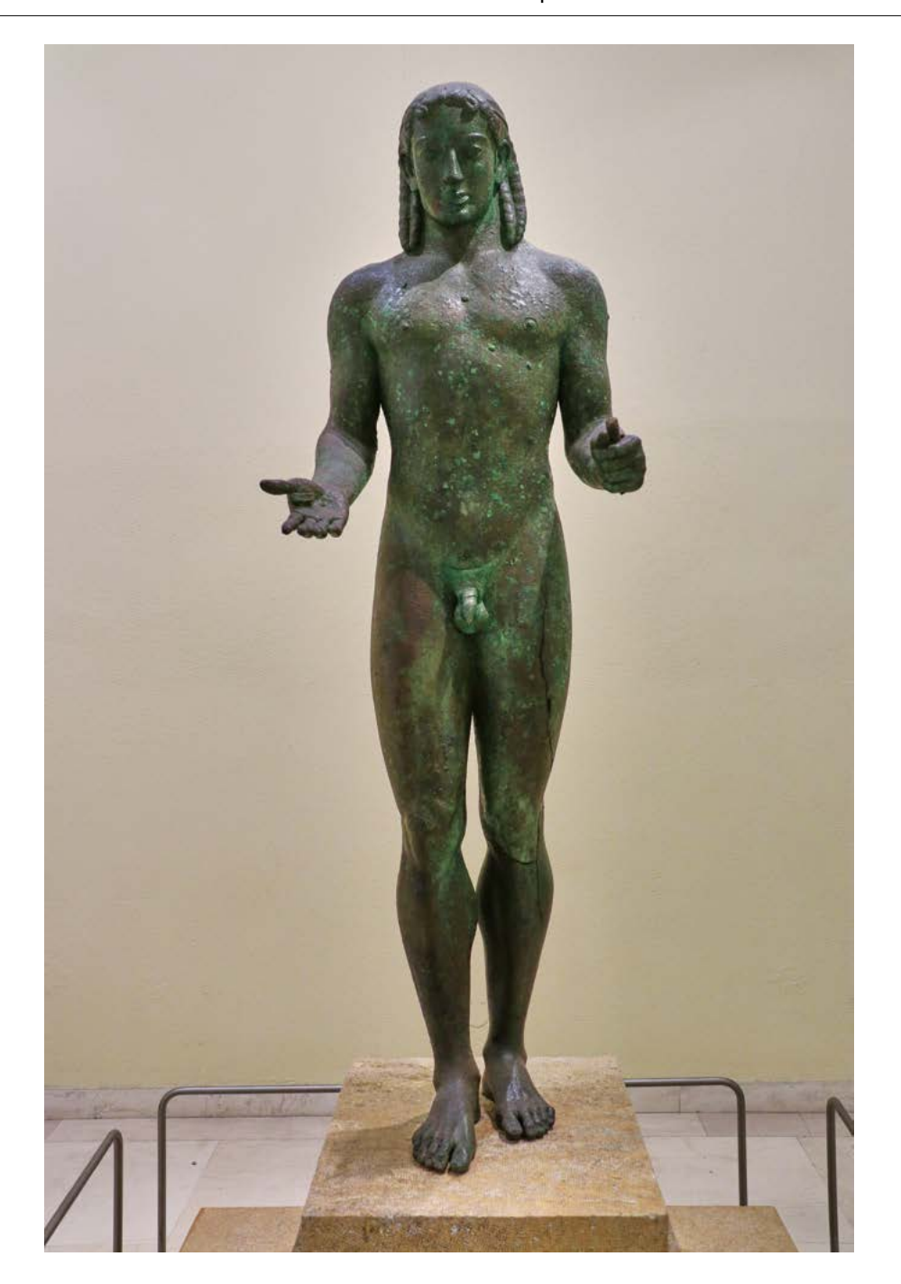
Fig. 10. Piraeus kouros, Inv. No. 4645, Piraeus Museum. An archaistic bronze kouros advancing on right leg (after https://commons.wikimedia.org/w/index.php?curid=71024254)

Obr. 10. Kúros z Pirea, inv. č. 4645, muzeum v Pireu. Archaizující bronzový kúros vykračující pravou nohou vpřed (podle https://commons.wikimedia.org/w/index.php?curid=71024254)