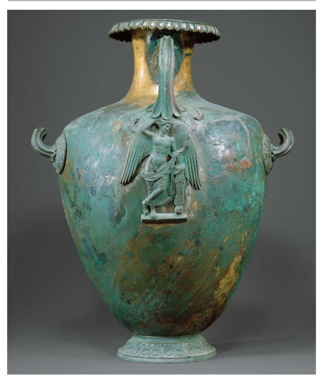
Fig. 9. Bronze Hydria, Inv. No. 44.11.9, Metropolitan Museum. A bronze hydria depicting Eros leaning on a kore statue (after https://www.metmuseum.org/art/collection/search/254515?searchField=All&sortBy=Relevance& where=Greece&what=Bronze%7cHydriae&ft=hydria&offset=0&rpp=20&pos=9)

Obr. 9. Bronzová hydrie, inv. č. 44.11.9, Metropolitní muzeum. Bronzová hydrie s motivem Eróta opírajícícho se o sochu koré (podle https://www.metmuseum.org/art/collection/search/254515?searchField=All&sortB y=Relevance&where=Greece&what=Bronze%7cHydriae&ft=hydria&offset=0&rpp=2 0&pos=9)