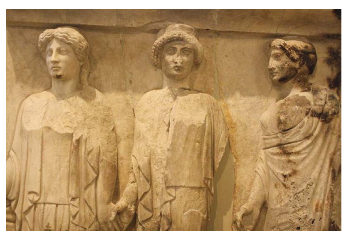
Fig. 4. The three Graces of Socrates, Inv. No. 2043, Piraeus Museum. A relief of Three Graces, the upper part is preserved