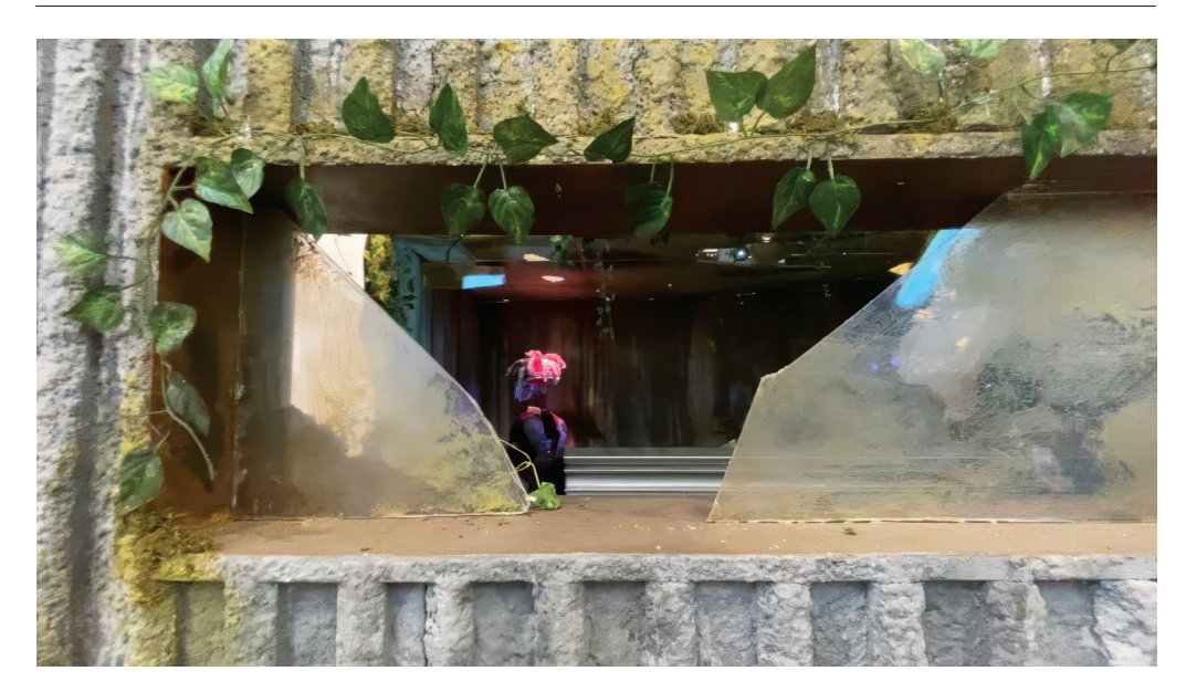
Fig. 2: Canadian Exhibition. PQ 2023.

ray of work presented in each exhibition. This comes with a risk though, that the work on exhibit may or may not be read as scenography to some.