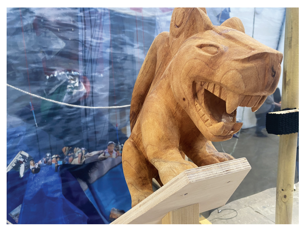
Fig. 5: Mexican Exhibition. PQ 2023.

Quebec's exhibition (Fig. 6), like Mexico, also uses its design to focus on specific social considerations. However, where Mexico designs a showcase of performance/politics, Quebec brings attention to the performance/politics of design. It positions scenographers as a limited resource, focusing on the precarious nature of the profession in a changing world. Though less explicitly ecoscenographic in its construction or concept, it engages the important question of survivability as a designer for living arts. In addition to the current exhibition, the Quebec team has commissioned a digital twin to archive its 2019 exhibition, focused on the environmental impact of the profession, which is shared via virtual reality. This expands this edition's valorisation of the scenographer, to maintain links with their previous consideration of the scenographer's valorisation of the stuff which gets used to realise their designs.