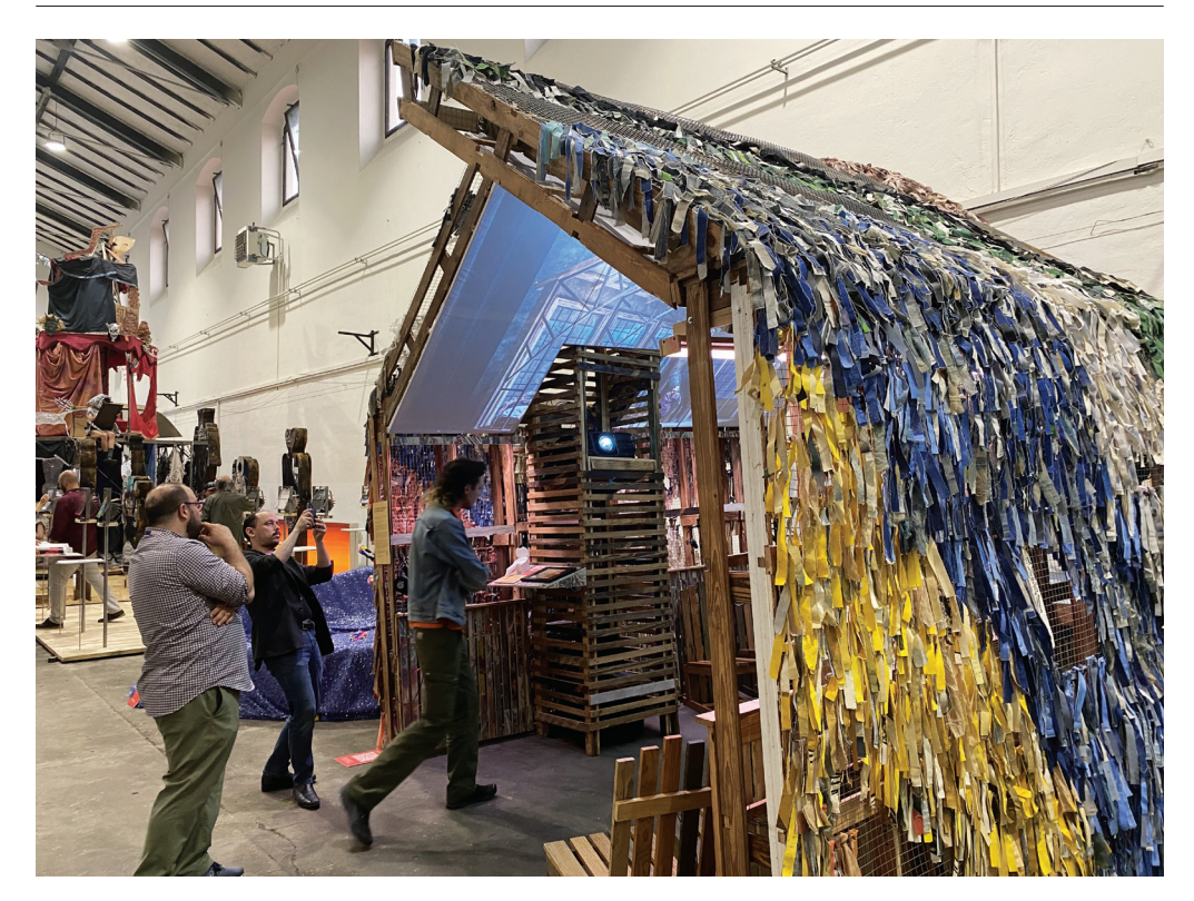
Fig. 4: USA Exhibition. PQ 2023.

is without the will to make the necessary changes. This existential issue is a cultural issue foremost.