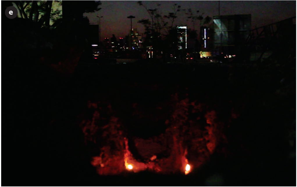
Fig. 3a-e: Stills from A Breath into a Hole . Lebanon, 2020.