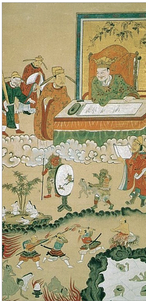
Fig. 2: Detail from the Hon rokudō jūō zu (kept in Shōzenji, 17th century, 3rd plate of 7) originally published in the Tateyama Museum of Toyama (2001).

King Enma. In some representations, however, these tools can be found portrayed solely with Enma. 54