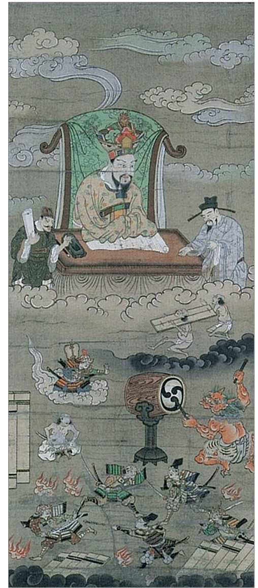
Fig. 1: King Taizan. Detail from the Hon Jizō jūō zu (property of Dairakuji, Edo period 18 th century, 8 th of 11 parts) originally published in the Tateyama Museum of Toyama (2001).

Recurring motifs are also human heads (a woman's head and a man's head) responsible for the records of sinners' deeds. There are also frequent motifs of tools of justice which are used by the Kings in the process of judgement. One is the scale of karma in which sinners are weighed against a counterbalance, usually portrayed as a boulder. And the second tool is the karma mirror, in Japanese known as jōhari no kagami 浄玻璃鏡 (also 浄頗梨鏡), showing the deeds from the previous lives of sinners (Figure 2). Japanese, Tibetan and Chinese texts of the Scripture on the Ten Kings mention the scale in the fourth court of King Gokan 互官, while the karma mirror is mentioned in the fifth court of