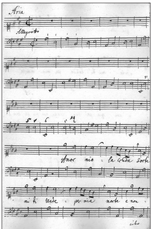
Fig. 6a and 6b

The cover page and beginning of Bernasconi'a aria Amor mio la cruda sorte from the Attems collection (SI-Mpa, no. 42, with kind permission)