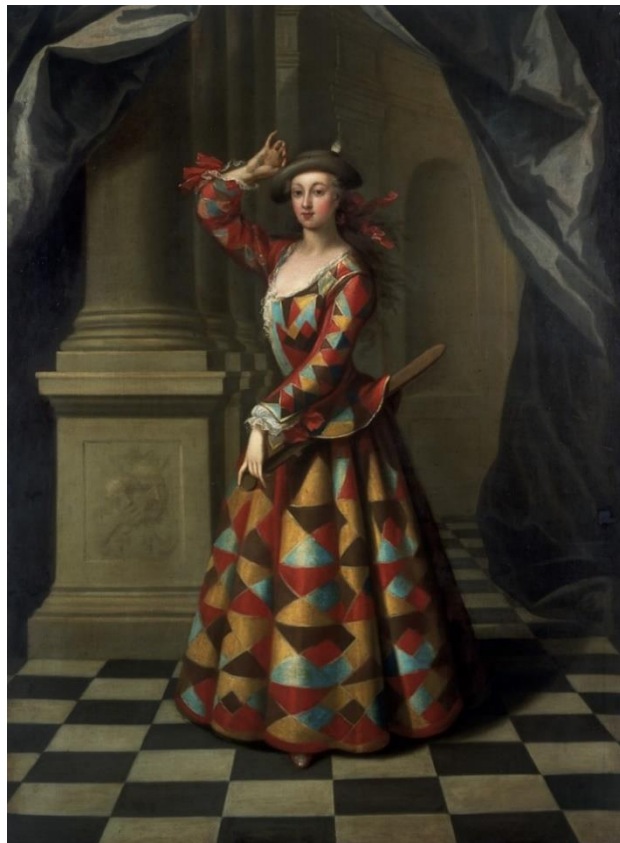
Figure 5: John Ellys’s painting of the actress-dancer Hester Booth (née Santlow) as a Harlequin Woman, c. 1722–1725.

Mrs Santlow was not unique in being both a dancer and an actress for she had several predecessors, going back to the 1660s, as well as a number of contemporaries. She was unusual, however, as both a leading actress and the company’s leading dancer with extensive repertoires in both genres which went far beyond those of other dancer-actresses. There were no true dancer-actors – although there were actors who regularly performed individual speciality dances, there were no actors who took both