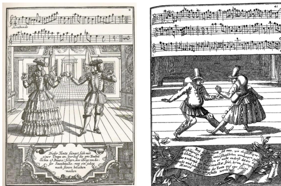
Figures 3 & 4: Prints from Gregorio Lambranzi's famous book of illustrations Nuova e curiosa scuola de' balli theatrali ( New and Curious School of Theatre Dancing ) printed in 1716 in Nuremberg. Two dancers on the left dance a sarabande, on the right two dancers perform a grotesque dance.

In the early years of the eighteenth century, the Italian opera was frequently criticized in London because some critics saw it as a foreign import sung in effeminate language which corrupted the English taste, English music, and theatre tradition (a case in point is John Dennis's An Essay on the Opera's, After the Italian Manner, which are to be Established on the English Stage: with some Reflections on the Damage which they may bring to the Publick from 1706 ). 5 Were there instances of objections based on the artform's national origin in connection to the French dancing style or French dancers? Was French dancing ever viewed by the English as foreign in a negative way?