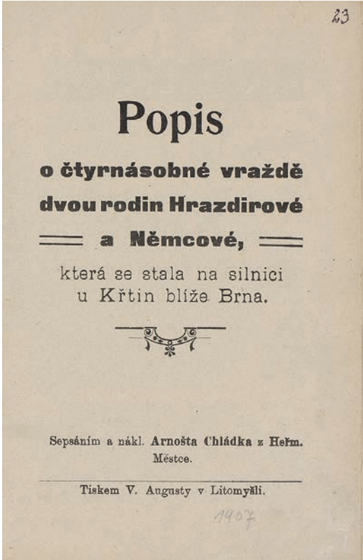
Figure 3. The "Song" broadside ballad. Chládek, Arnošt: "Píseň o čtyřnásobné vraždě dvou rodin Hrazdirové a Němcové, která se stala na silnici u Křtin blíže Brna" ("A song about the quadruple murder of two families, Hrazdíra and Němec, which happened on the road by Křtiny near Brno"). Litomyšl: Vladimír Augusta, [after 1907], sign. VK-0000.216, přív.66, MZK.