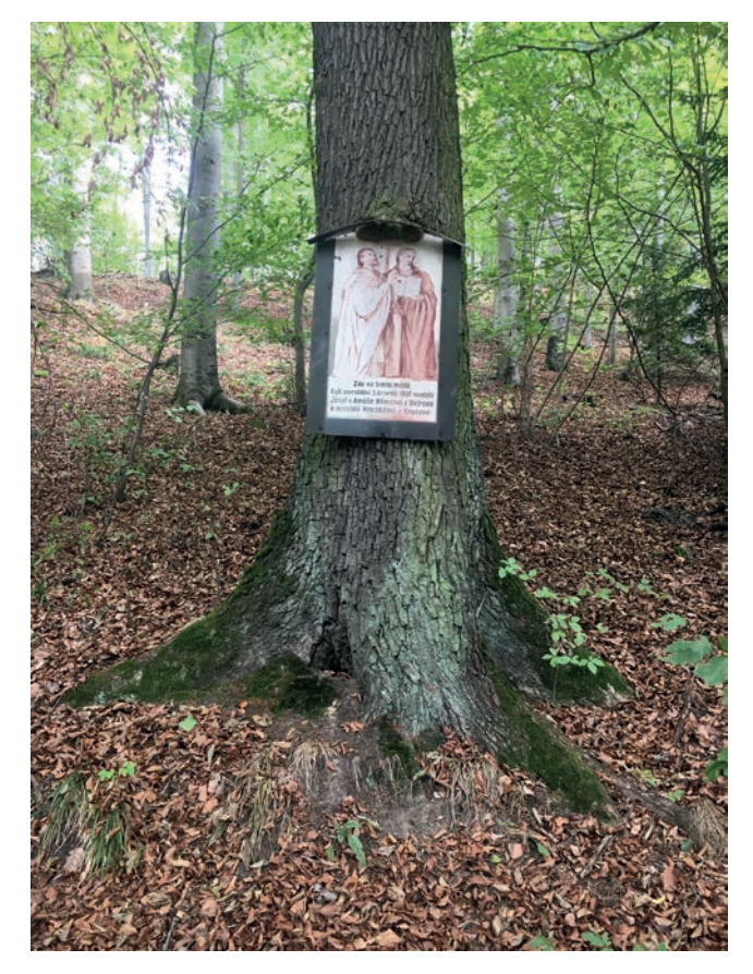
Figure 5. A memorial plaque at the site of the crime near Křtiny in 2019.

The constant creation of a shorthand to link re-cycled information, often combined with the need to present only a small fraction of the event in popular or tabloid tropes, distances future readers, listeners, and users from the possibility of knowing the story and maintaining any type of memory of the described event.