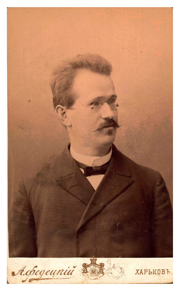
Fig. 3 F. Kučera, 1894.

However, the first performances of the newly formed orchestra in May 1898 were extremely successful, as reported by an anonymous author under the pseudonym S. P. in the newspaper Southern Lands: F. Kučera began giving daily summer symphony concerts in the Garden of the Commercial Club. Musical evenings for Kharkiv residents, exhausted from the off-season contemplation of vulgarity and stupidity, with which we are treated by the 'étoiles' of summer venues, are just a treasure, and they are also very affordable.<sup>745</sup>