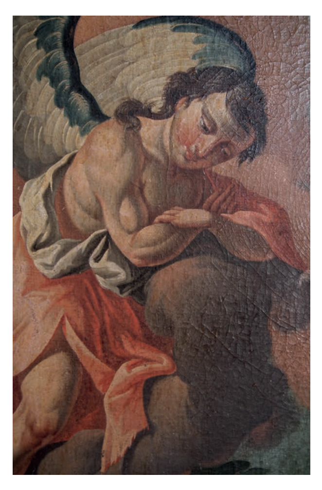
9 – Johann Georg Walter, Angel from the Baptism of Christ , detail of the high altar painting before restauration, 1765. Modra, Church of Saint John the Baptist

atively easy accessibility to Bratislava and Trnava. Possibly it allowed him to work at various sites. The lower cost of living in Modra could also have been a factor.