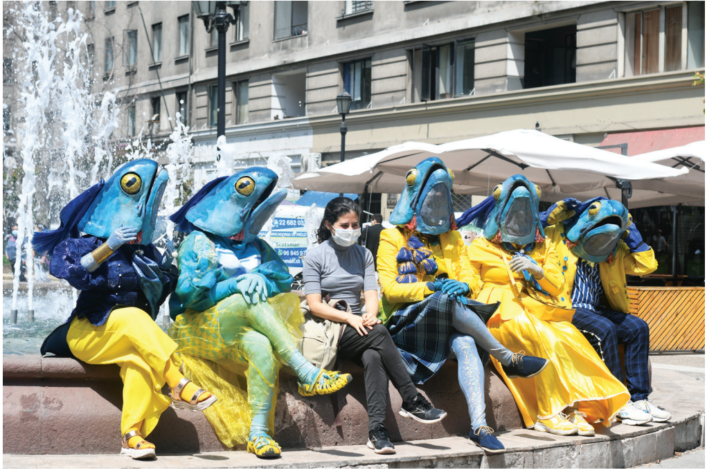
Fig. 1: Peces Caminando! [Walking Fish!] by Complejo Conejo. PQ 2019.

Walking Fish! consisted of five performers, ‘the fish’, who walked through the city collecting and imitating the movements, gestures, and actions of passers-by, while they walked following a previously designed route (Fig. 1). This show had three presentations during PQ 2019, varying between 1 and 2 hours each time and was presented in different places, the most significant for this article being its presentation in the historic centre of the city of Prague, facing a large number of tourists and locals at the same time. The ‘fish’ followed a series of rules self-imposed by the group, such as not speaking or communicating physically or non-verbally, restricting themselves only to imitation and moving forward as the only possibility.