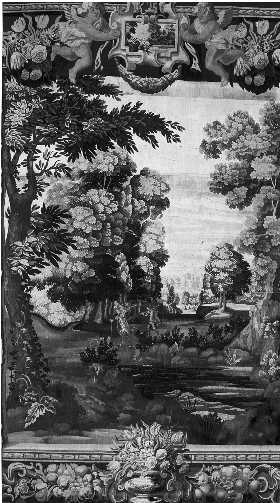
Fig. 7: Landscape with two hunters (Inv. Nr. UO 482 T).

wide borders, is not preserved (or more accurately, until now it has not been possible to identify it with any of the preserved series), but it is described in the correspondence between the art dealer Luigi Malo and Piccolomini, who wanted to buy a set of verdures for a gift. The description corresponds exactly to the appearance of the Ptuj verdures. Erik Duverger even thinks it would be possible that the mentioned series was the one described in the inventory from 1695 for Český Krumlov. 41