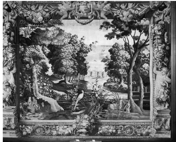
Fig. 5: Landscape with lovers, a bird and a horse (Inv. Nr. UO 484 T).