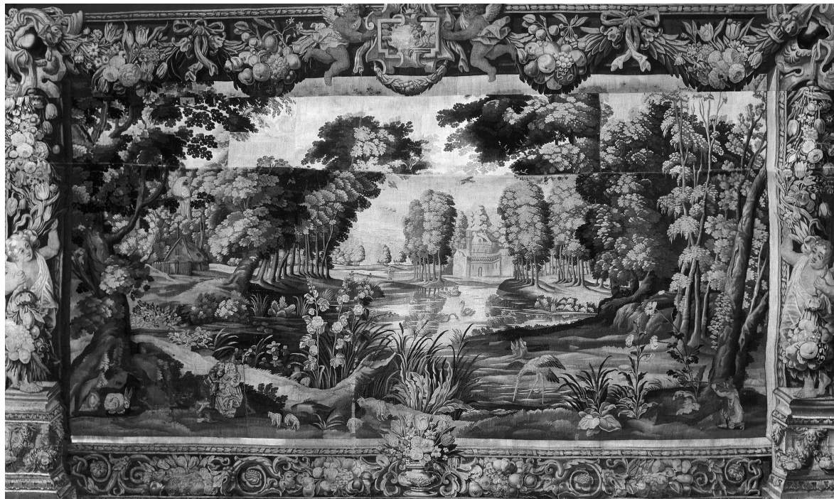
Fig. 3: The heron hunt (Inv. Nr. UO 483 T).

The six tapestries in the Regional Museum of Ptuj show landscapes with a girl by a pond, 21 with two hunters, 22 with the heron hunt, 23 with lovers, a bird and a horse, 24 with the duck hunt 25 and with the hunter with a dead duck. 26 The landscapes are densely wooded; however they open in the centre of the composition where ponds with a glittering surface are visible. In the distance there are houses, a castle, a church with a tall bell-tower and even a whole village. In the foreground the colours are green (as daylight has faded the colours through the centuries, the green has lost a lot of yellow and is now closer to blue) and brown, in the distance they are bright and shiny. In the near foreground there are bunches of grass and leaves of disproportionate size. The perspective is stressed with tree trunks tilted towards the interior of the composition. The landscapes are inhabited with animals and people. Ducks and swans are swimming in the