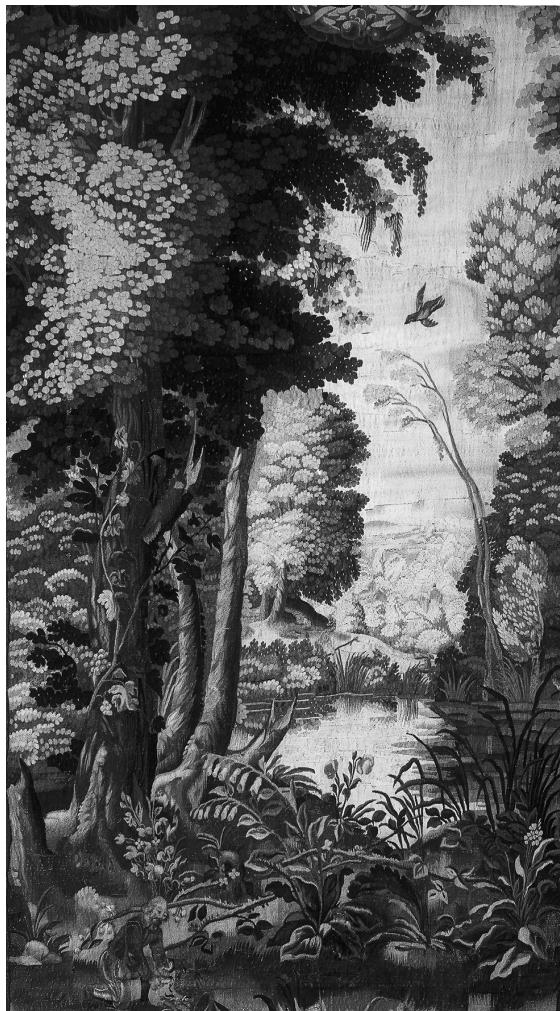
Fig. 8: The hunter with the dead duck (Inv. Nr. UO 487 T).

wide borders, is not preserved (or more accurately, until now it has not been possible to identify it with any of the preserved series), but it is described in the correspondence between the art dealer Luigi Malo and Piccolomini, who wanted to buy a set of verdures for a gift. The description corresponds exactly to the appearance of the Ptuj verdures. Erik Duverger even thinks it would be possible that the mentioned series was the one described in the inventory from 1695 for Český Krumlov. 41