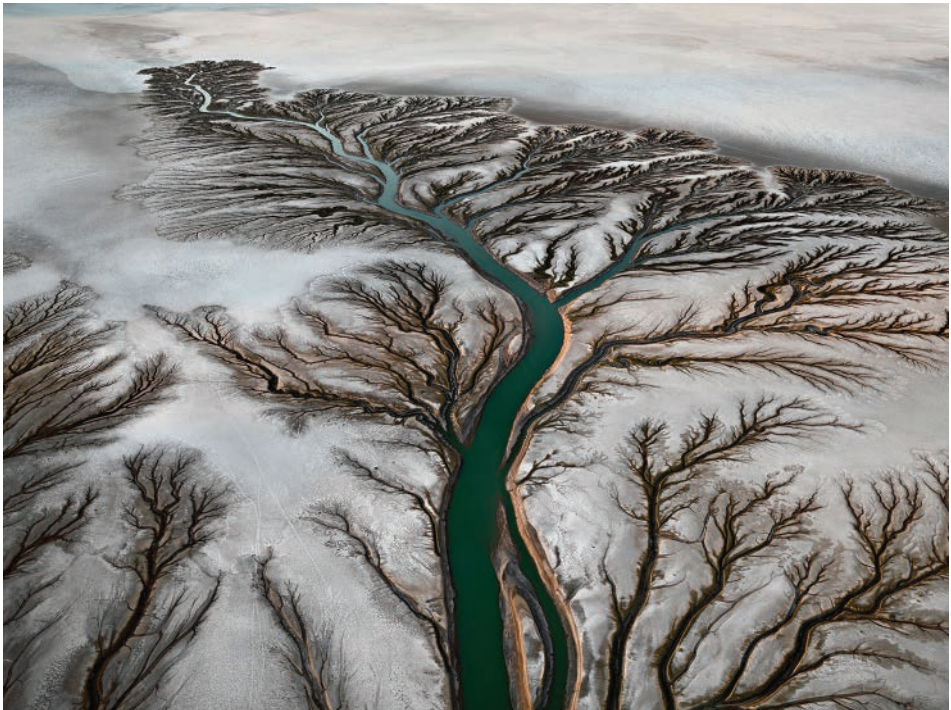
Figure 5. Watermark photograph by Edward Burtynsky, used with permission of Mercury Films

This transformative process, engaging the abstractions of the universal out of the particular, is fully manifest in Watermark (2013), co-directed with Ed Burtynsky. The photographer wanted to make a film in support of his major photography project Water and turned to his friend Baichwal for guidance (Burtynsky 2013).