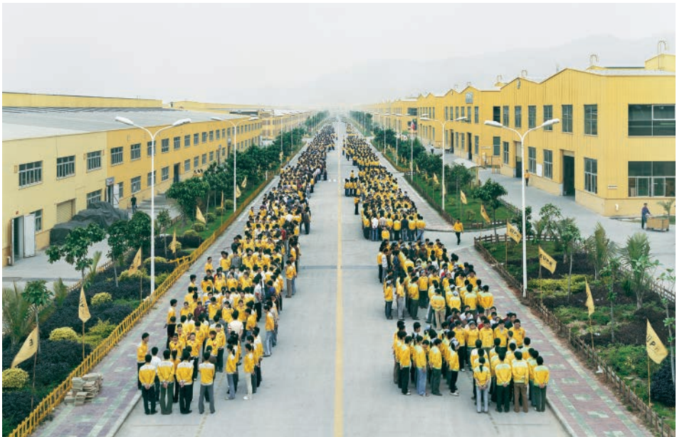
Figure 4. Manufactured Landscapes , photograph by Edward Burtynsky used with permission of Mercury Films