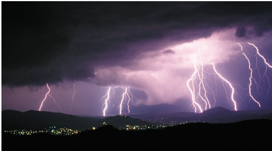
Figure 2. Act of God , used with permission of Mercury Films

were not there when Ralph took his final breath, nor are we inside the mind of the boy as witness. We only have Auster's gaze at the camera when he finishes reading, as if to say I was there, but also to refuse the pretense of interpretation or the "magical thinking" of divine rationalization.