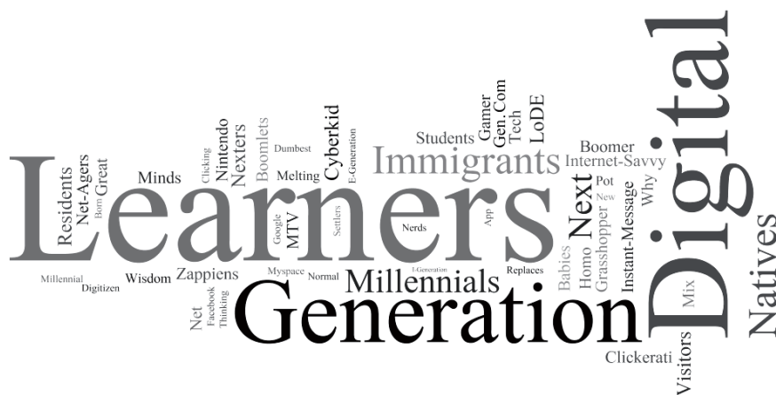
Figure 2 Terms used to characterize students in the digital era