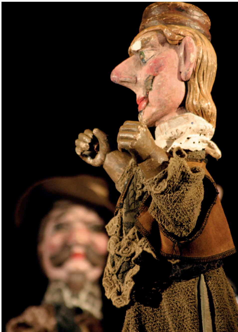
Fig. 18: Tomáš Dvořák's production of The Three Musketeers ( Tři muřetýři ). Scenography by Ivan Nesveda. The Alfa Theatre, Plzeň, 2006.