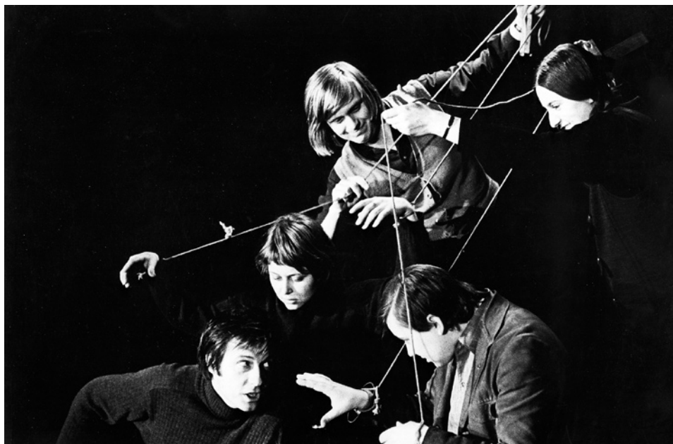
Fig. 5: The Led Theatre ( Vedené divadlo ).