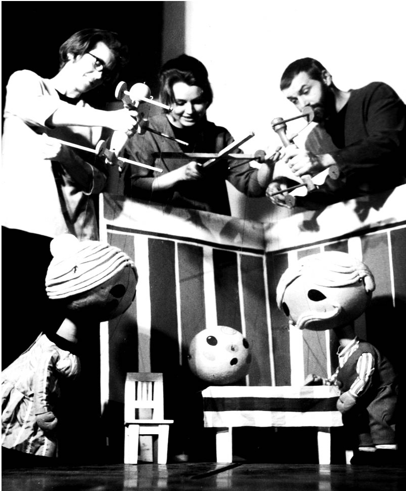
Fig. 8: Jindřich Halik's ground-breaking production of Jan Malık's Speckles the Ball ( Mıček Flıček ). The Central Puppet Theatre ( Ustřednı loutkove divadlo ), now the Minor Theatre, 1964. Photograph  copyright of the Divadlo Minor.