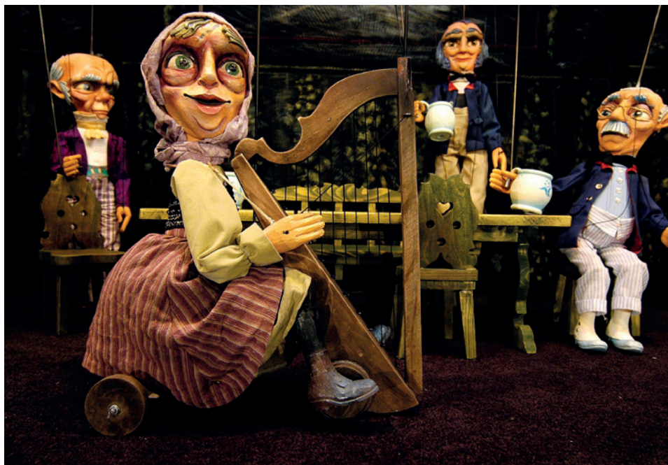
Fig. 14: Tomáš Dvořák's production of Iva Peřinová's play The Handsome Fire Chief, or the Fire of the National Theatre ( Krásný nadhasič aneb Požár Národního divadla ). Scenography by Ivan Nesveda. Naïve Theatre Liberec, 2005.

Puppets Got Talent! ( Loutky hledají talent ), Standing by the Cannon ( U kanónu stál ). For example, his authorial version of the classic fairy tale Cook, Mug, Cook! ( Hrnečku, vař! ) from 2006 was produced three times by three different theatres, which is utterly exceptional in the present context.