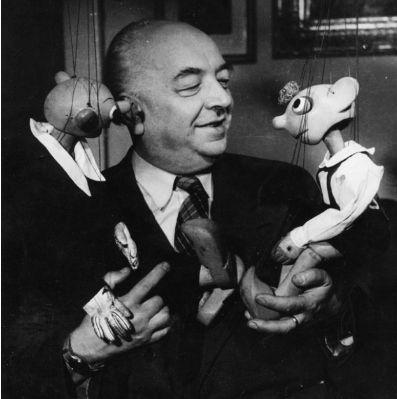
Fig. 13: Josef Skupa.

a compliment to Czech companies that they manage to do this without a dramatic inclination towards appealing kitsch, or pandering to audiences.