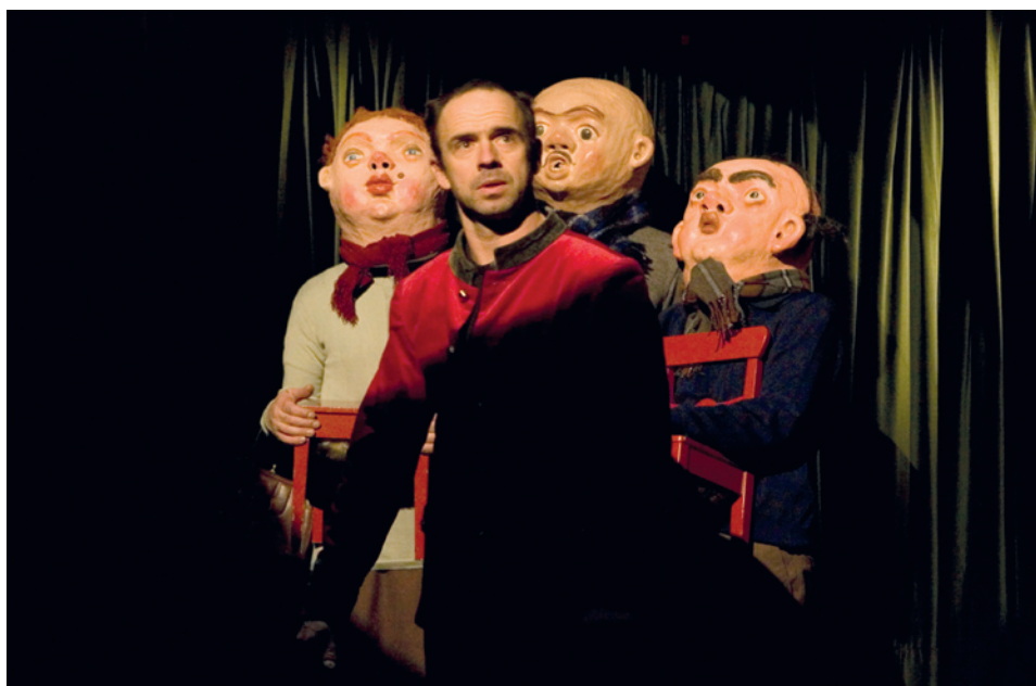
Fig. 1a+b: Forman Brothers' Theatre (Divadlo bři Formanů). Freak Show (Obludárium) , 2007.