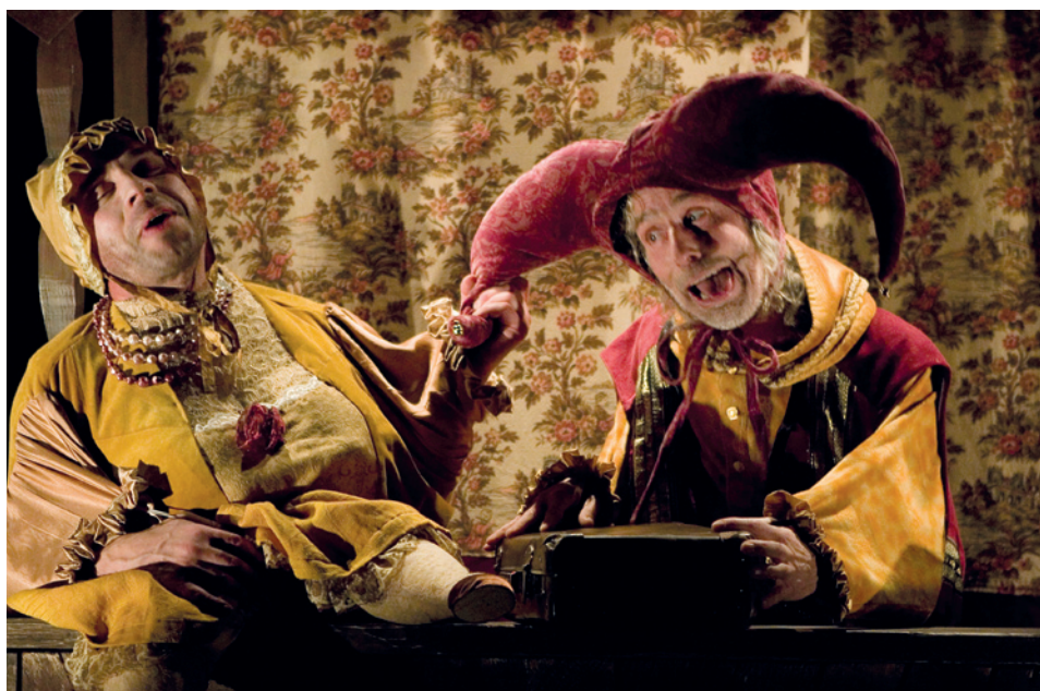
Fig. 2a+b: Forman Brothers' Theatre (Divadlo bři Formanů). Freak Show (Obludárium) , 2007.