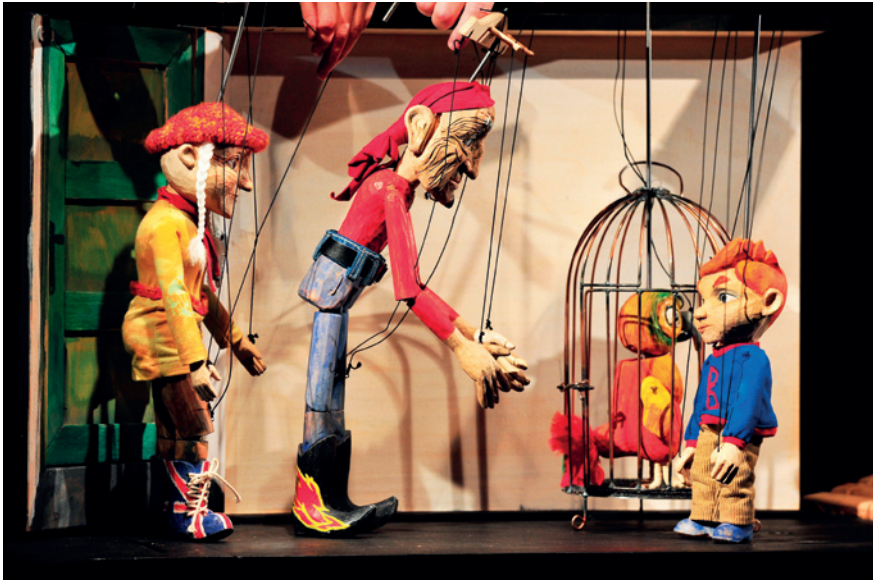
Fig. 10: Michaela Homolová's production of Budulínek . Scenography by Robert Smolík. Naïve Theatre Liberec, 2012.