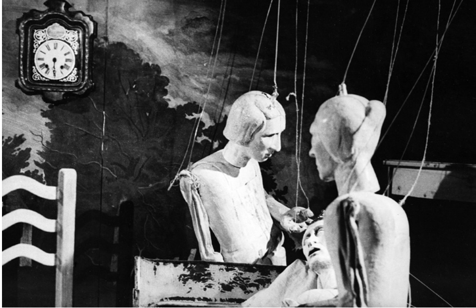
Fig. 7: Karel Makonj's production of Albert Camus's Le Malentendu ( Nedorozumění ). Vedené divadlo Theatre, 1969.

although so far, it was just on the formal level. On the other hand, the new purportedly Socialist social order, which was against private business, also discontinued the activities of travelling puppeteers, whose families had passed their craft down through several generations. Traditional marionette puppeteers were already seen as a fading curiosity by artistic circles in the early twentieth century, but a forced and complete discontinuation of their activities, including activities of families with clear artistic qualities, and a radical turn from the most typical Czech marionettes to stick-puppets, which were not unknown but definitely non-traditional, was proven to be a short-sighted decision over time.