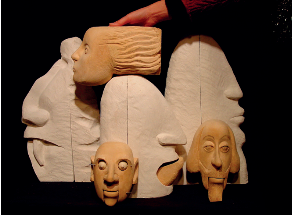
Fig. 16: A sculptural work in progress.

and the stable funding that is needed to grow, as well as the necessary staff in order to bring into the picture Czech artists living abroad as well. Cultural centres are an important asset for traditional arts and for the communities they represent. They are a bridge with the 'old country' for those who live outside its borders and for connecting artists on both sides of its frontiers. It does take time, money and experience to meet specific goals, which is why experience in raising funds via events and networking is fundamental.