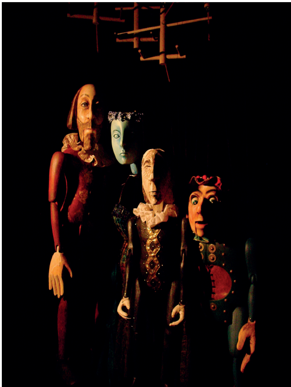
Fig. 10: Shakespeare, Ophelia, Hamlet and the Fool.