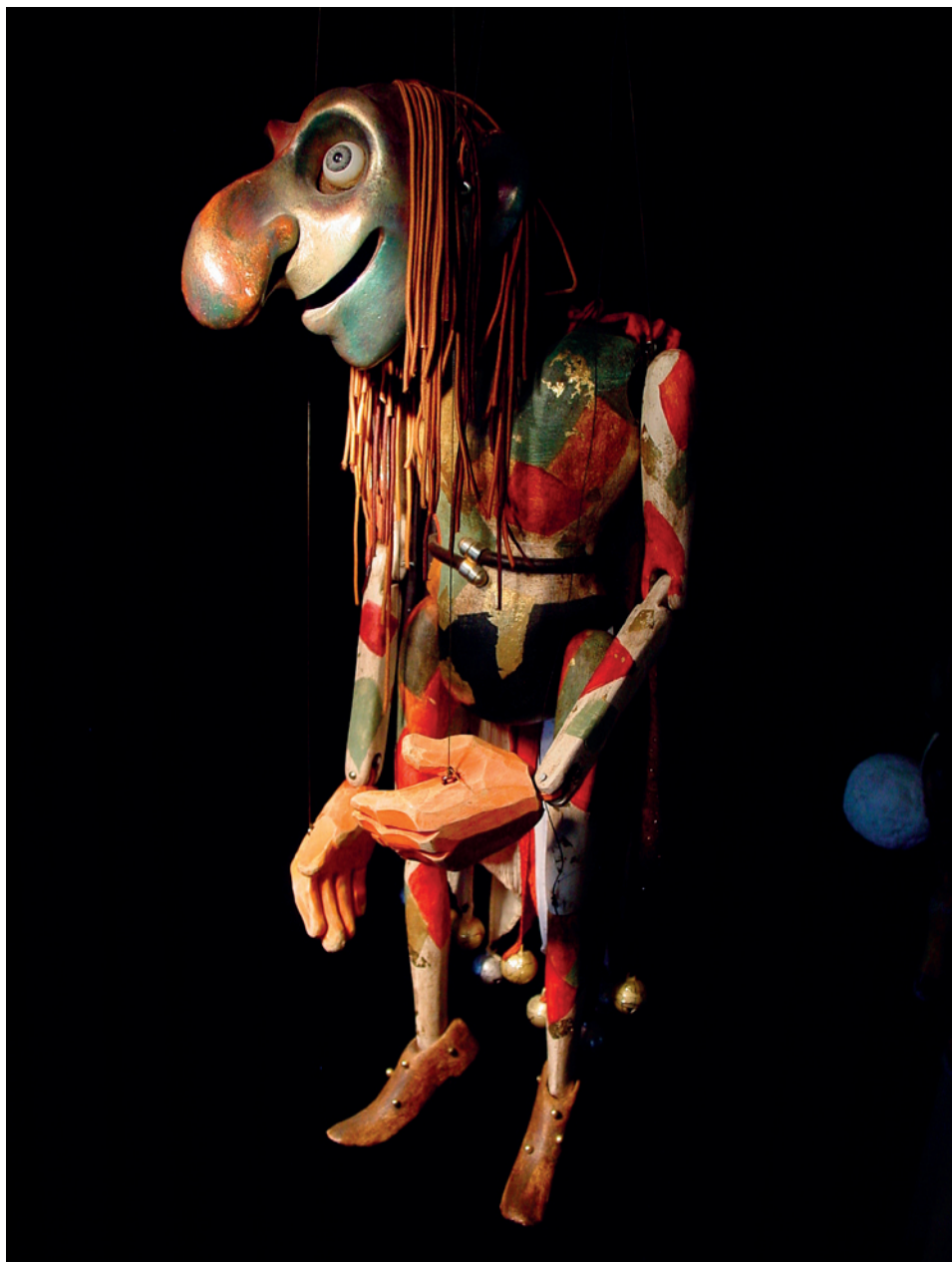
Fig. 3: Harlequin.