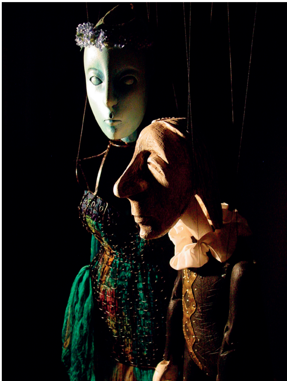
Fig. 12: Ophelia and Hamlet.