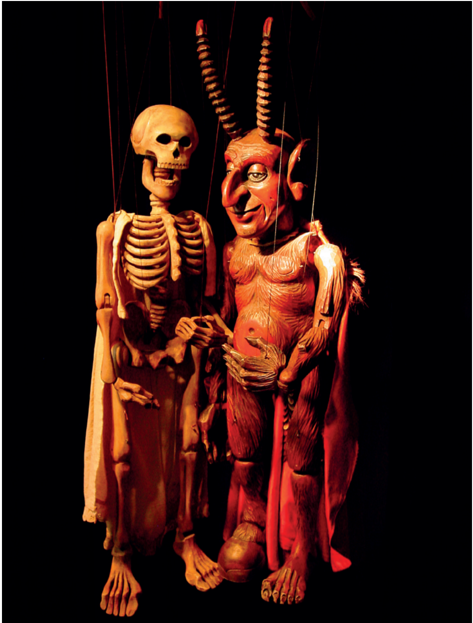
Fig. 9: Skeleton and Devil.