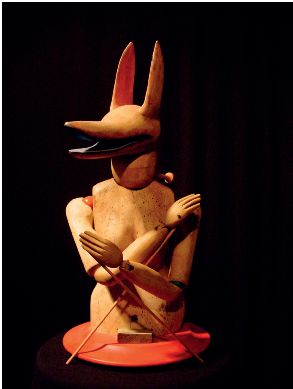
Fig. 15: Vixen.