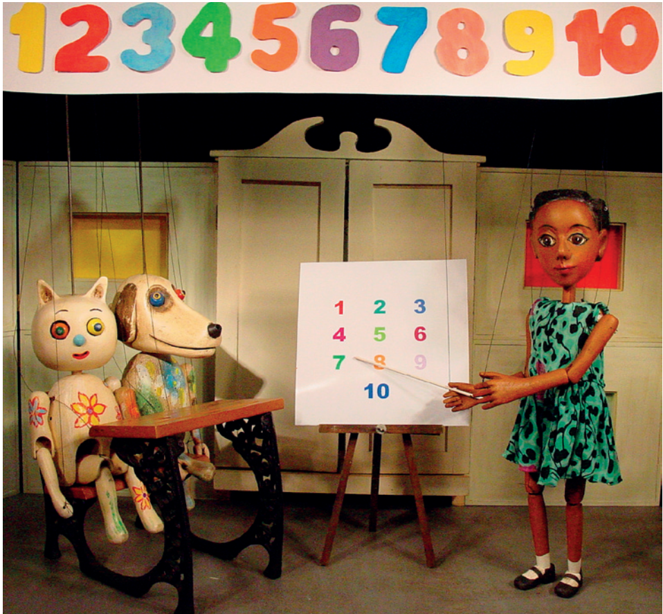
Fig. 5: Cat, Dog and Piccolina.

ters. The impact of such programmes went beyond the mission of acquainting youth with a different culture. Marionettes triggered reactions that would deserve a more in-depth study of how individual youths, generally closed to activities falling outside their range of interest, quickly found a medium to express themselves, to challenge and question, to gain self-confidence, and to feel that there is a whole world out there worth exploring.