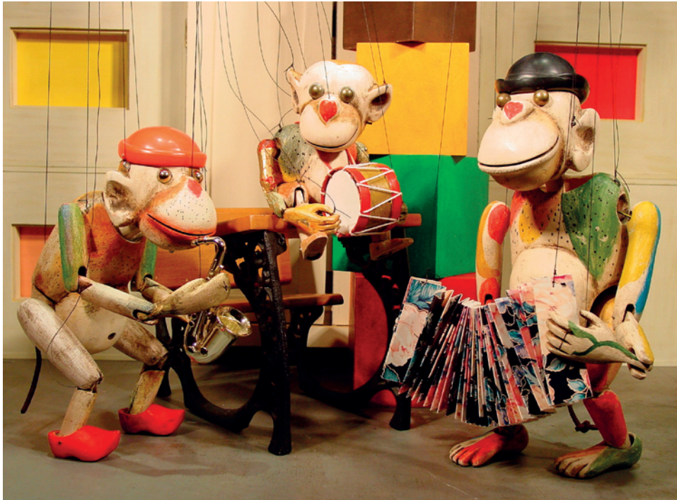
Fig. 8: Three Monkeys playing musical instruments.