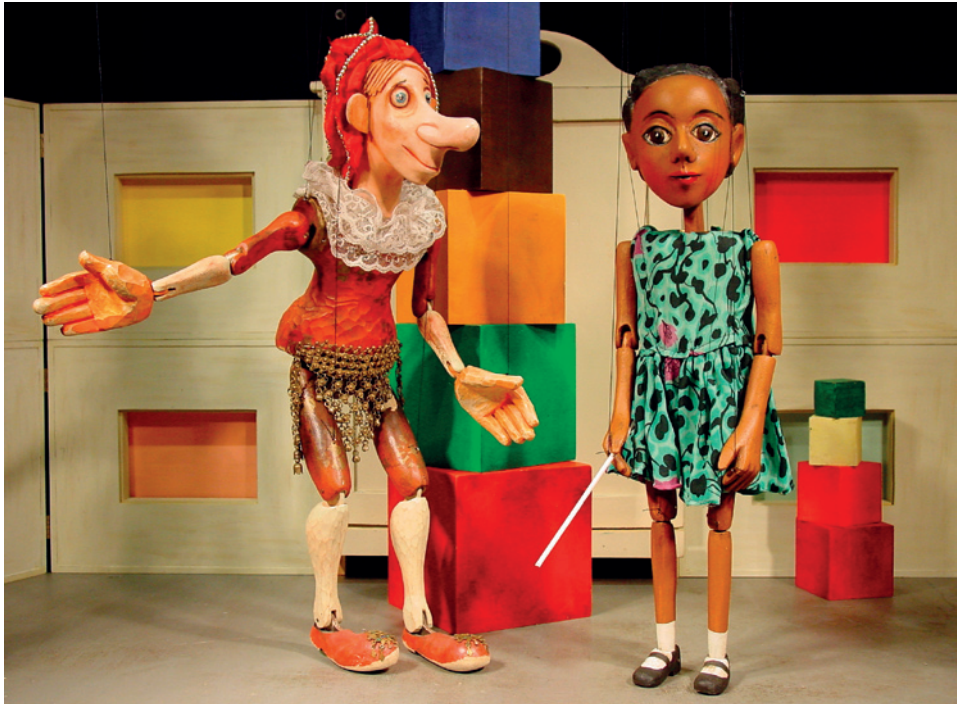
Fig. 6: Jester and Piccolina.

education, as well as psychological development. Countless examples describe the depth of such encounters. 1 In our experience, many teenagers (aged between fourteen and eighteen years) would exhibit aggressive behaviour in their schools and challenge authority, as is the case in most urban public schools. However, once a residency with Yorick's Marionette Theatre started, the behaviour of such challenging individuals changed; their interest kept growing and they gradually became seriously involved. Boys and girls who had been withdrawn opened up and expressed themselves. The notion that marionettes are for little children only, would literally melt at the sight of Dušan performing in front of teenage audiences with the Jester, Mr. Bones and Mr. Pounds (a weightlifter). The humoristic expressions carried by the cast helped to facilitate contact between the teenagers and puppeteers.