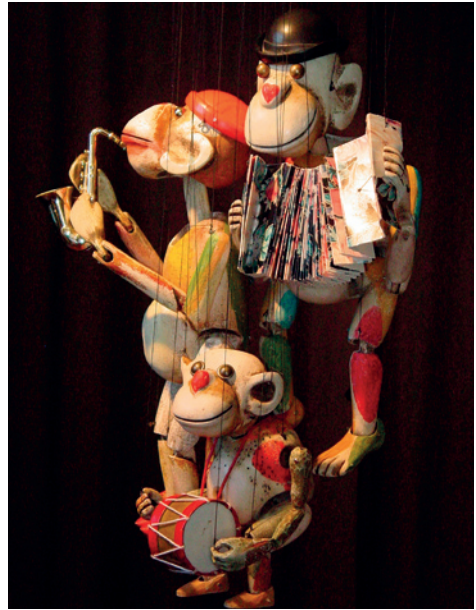
Fig. 7a–d: Piccolina and Pompon (a); Tap Man (b); Geppetto and Pinocchio (c); Three Monkeys playing musical instruments (d).