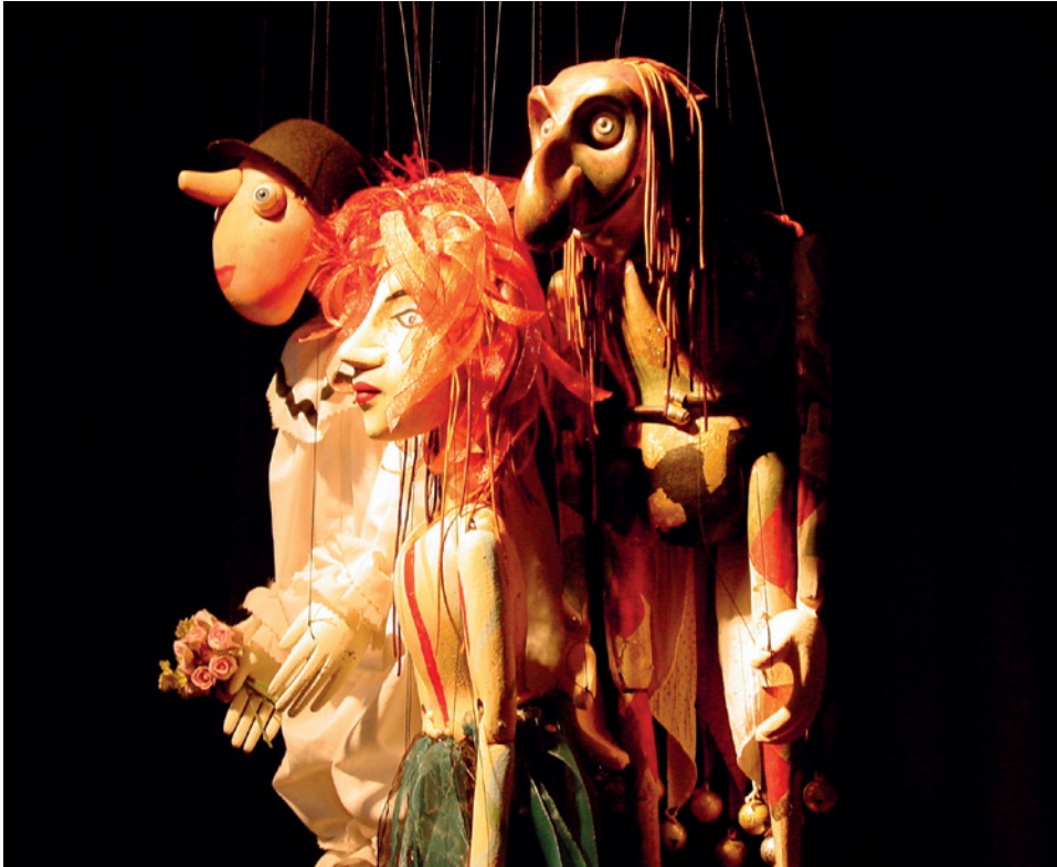
Fig. 4: Pierrot, Colombine and Harlequin.