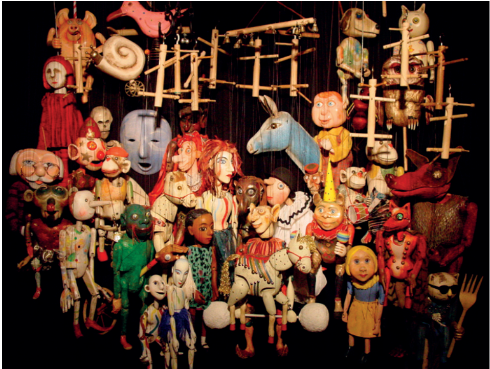
Fig. 1: A world of Marionettes.

production. The play received attention and was featured in regional newspapers and magazines.