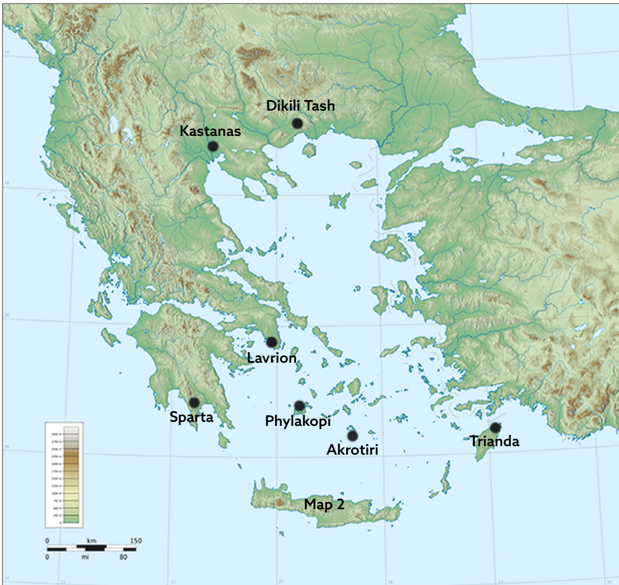
Map 1 / Map of the Aegean showing major sites mentioned in the text. (Illustration by author)