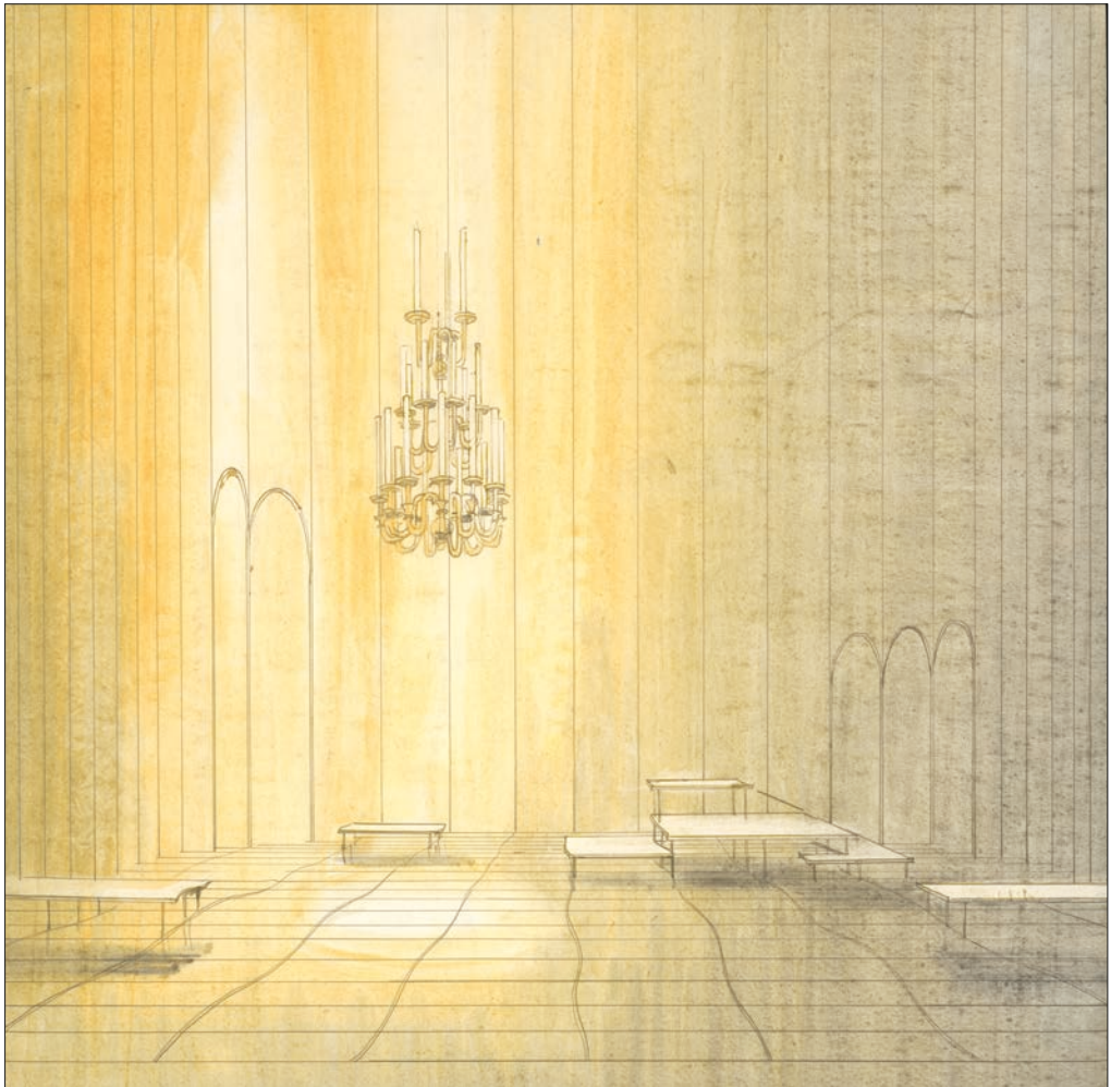
Fig. 2: Ladislav Vychodil: Twelfth Night or What You Will (direction: T. Rakovský) Slovak National Theatre, 1962.

limitations of such an approach very soon. His productions were becoming more functional and minimalist again. He also returned to his previous experiments with light and focused on shaping the space with light as one of the essential elements.