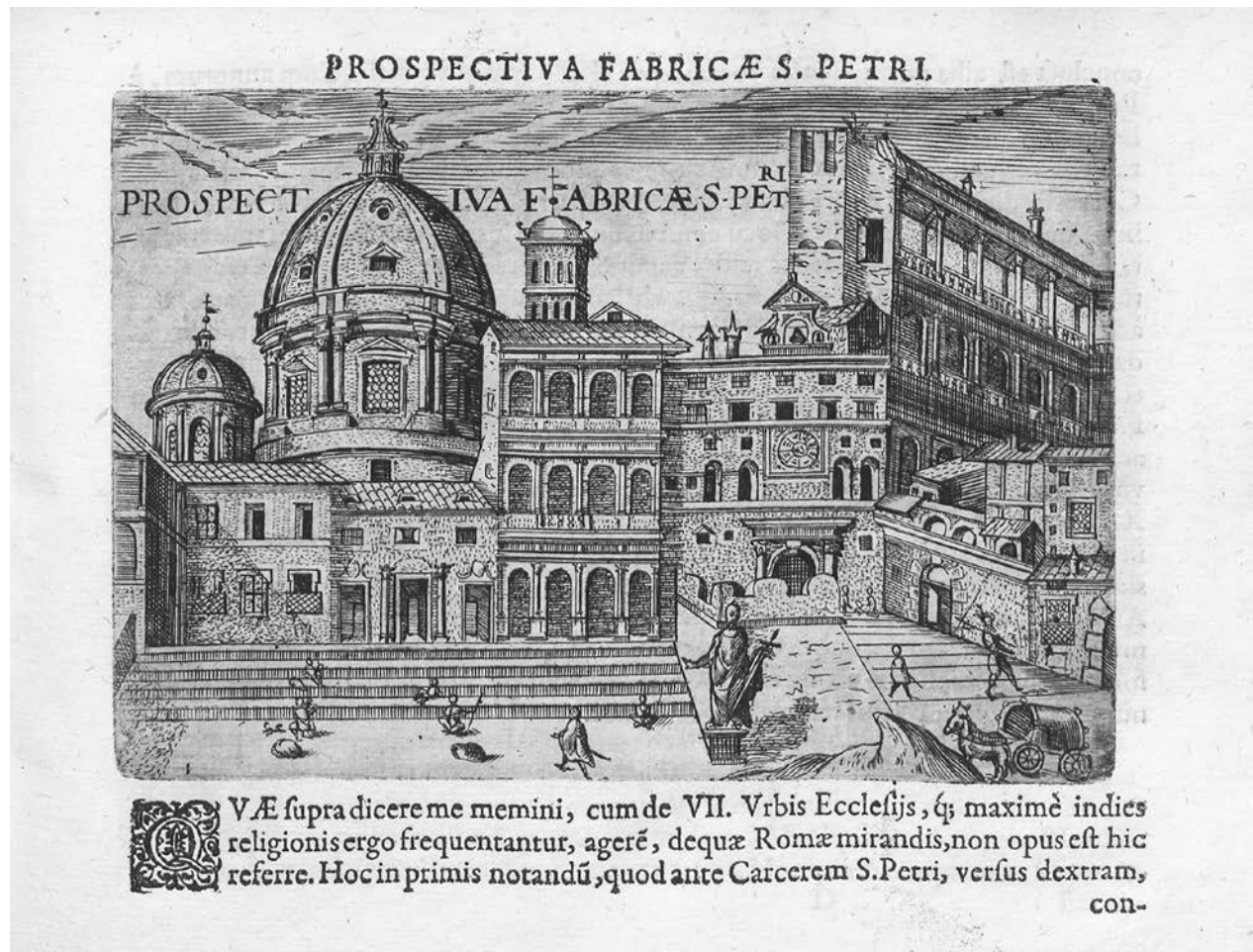
2 – Prospectiva Fabricae S. Petri. Dominicus Custos, Deliciae Urbis Romae. Divinae et humanae [...] 1600, Augustae Vindelicorum 1600. University of Wrocław Library, Old Prints Department, No. 543136

The only other building deemed to be a worthy rival to St Peter's was St Paul's Cathedral in London, after taking into account the religious differences that determined its aes-