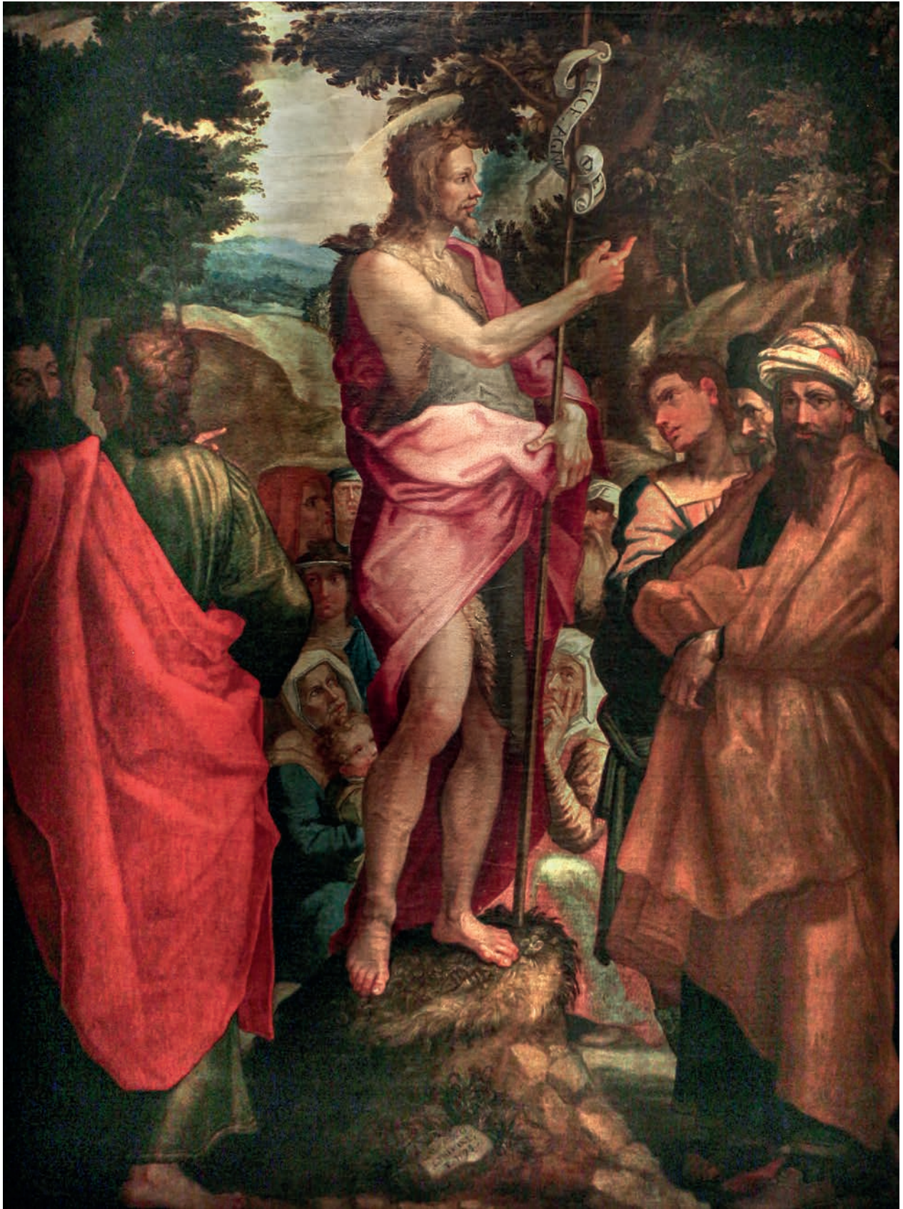
1 – Galeazzo Ghidoni, St John the Baptist Preaching , 1598. Cremona, Museo Civico