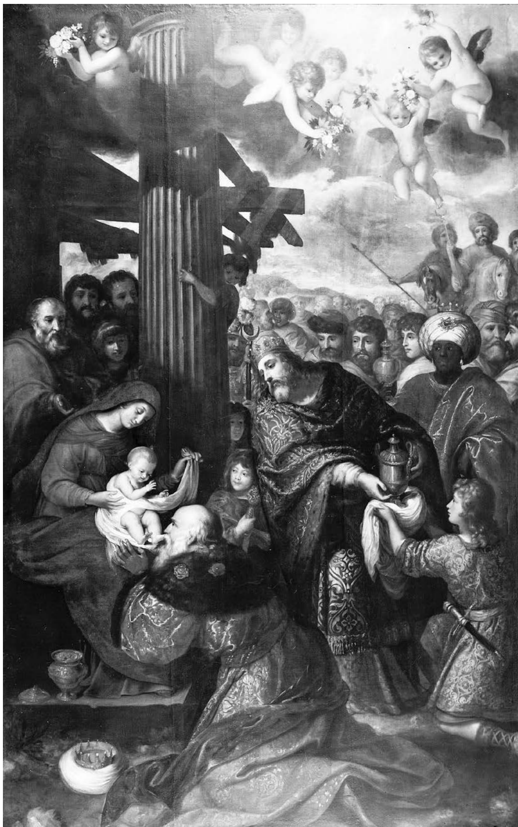
8 – Giovanni Battista Ghidoni, The Adoration of the Three Kings , 1640. Valtice, church of the Assumption of Our Lady