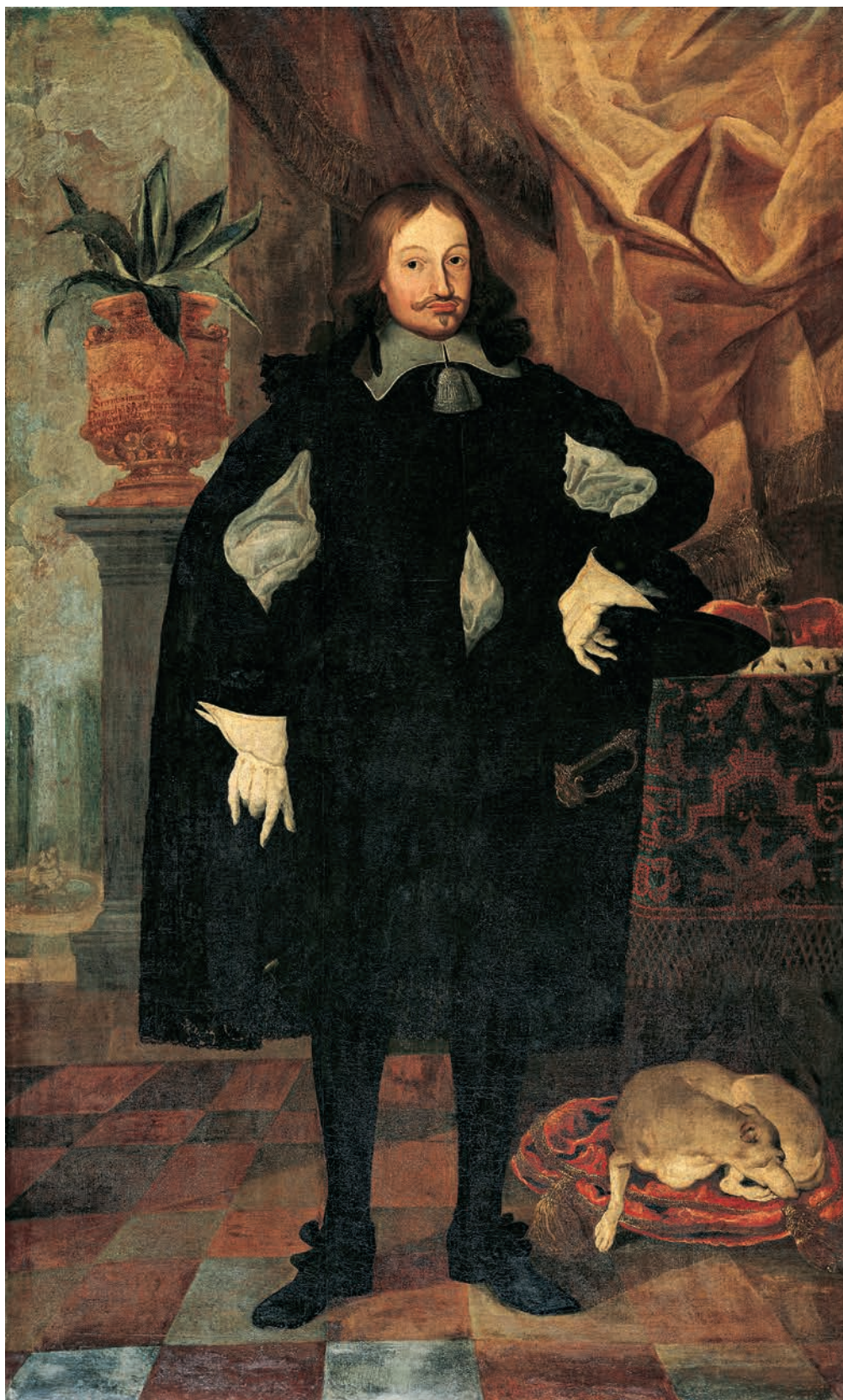
10 – Giovanni Battista Ghidoni (?), Prince Karl Eusebius of Liechtenstein , ca. 1650. Sammlungen des Fürsten von und zu Liechtenstein, Vaduz – Vienna