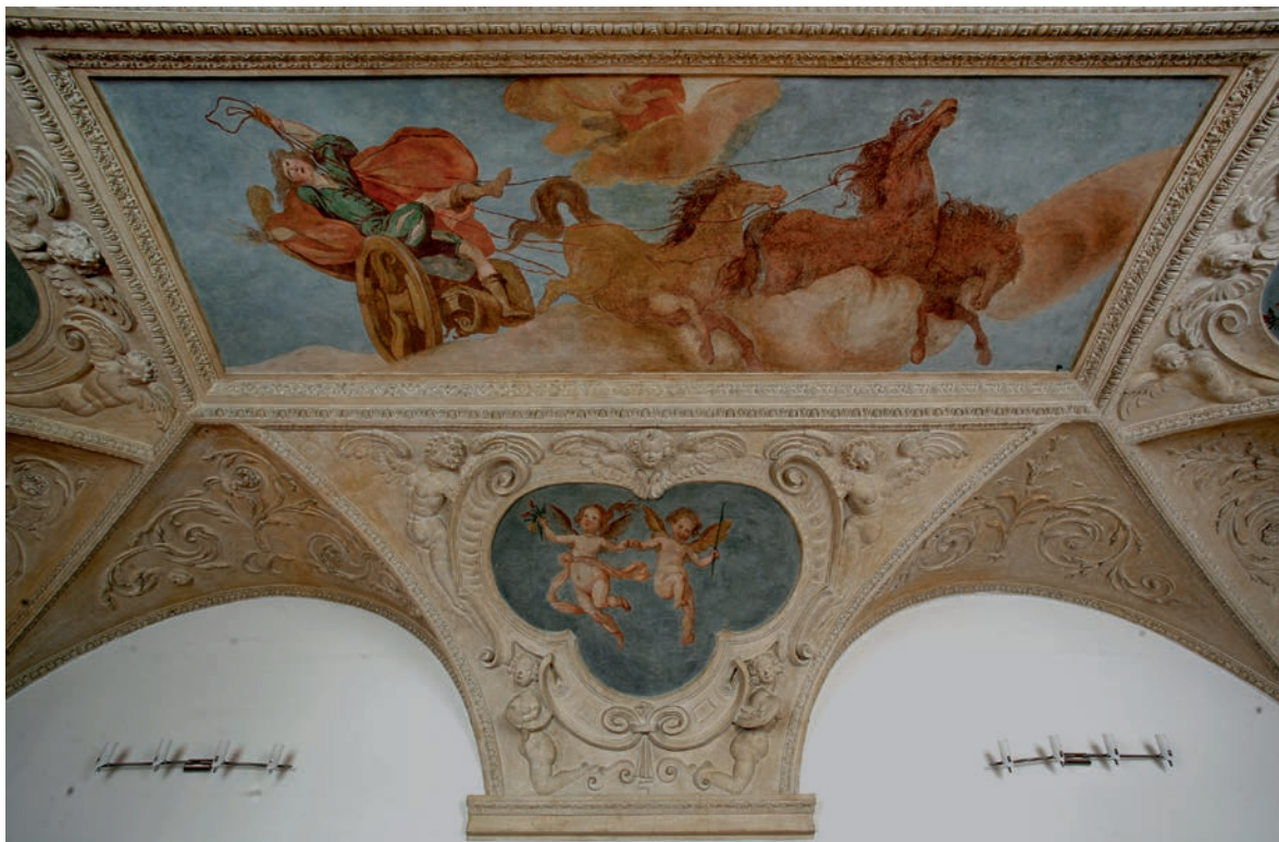
12 – Domenico Pugliani, The Fall of Phaeton , ceiling painting, 1628–1632. Prague, palace of Francesco della Chiesa in Prague New Town (also known as the Losy of Losinthal Palace or the Kinsky Palace)