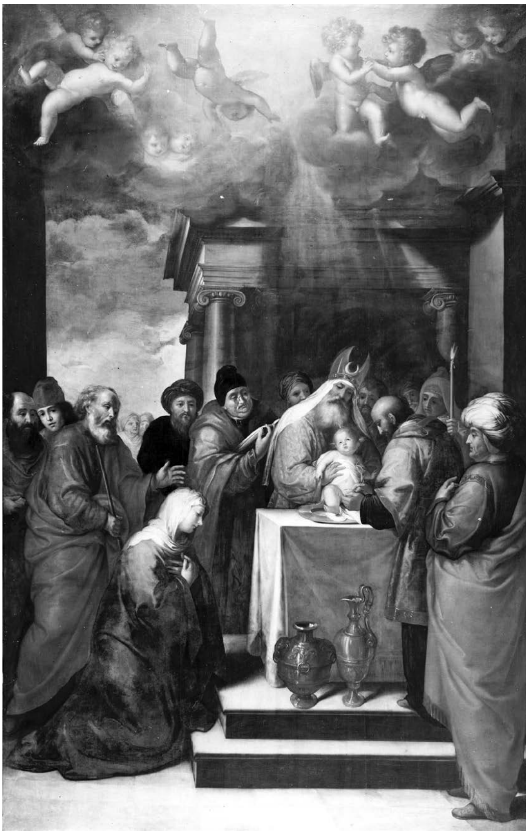
9 – Giovanni Battista Ghidoni, The Circumcision of Christ , 1640. Valtice, church of the Assumption of Our Lady