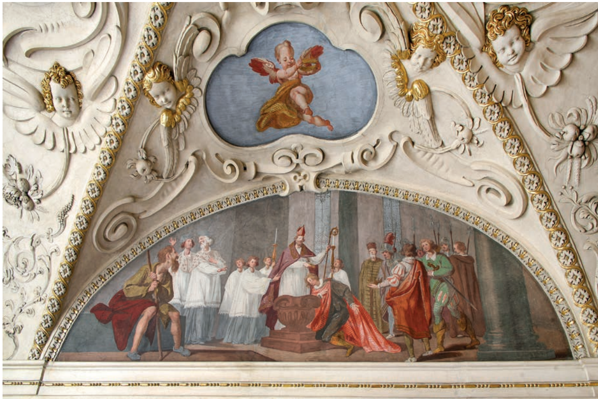
11 – Domenico Pugliani, The Baptism of St Wenceslaus , ceiling painting, 1628–1632. Prague, Wallenstein Palace