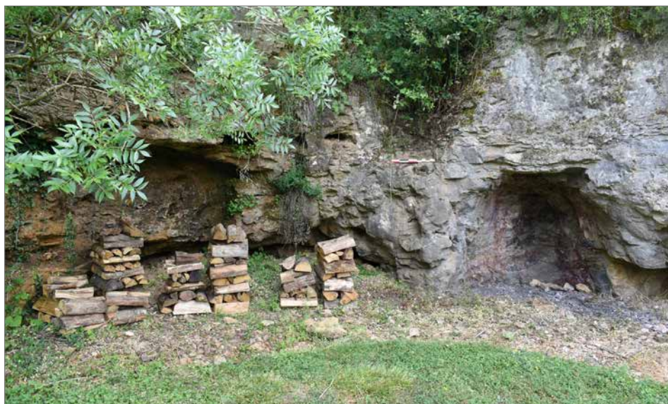
Figure 4. Experimental site for firesetting.

In this protocol there were two miner-experimenters. One carried out the first trial (Melle 1), and the second the other two trials (Melle 2 and Melle 3). Both were men who played sport and had some experience of mining at the Melle site. One of the experimenters, experimenter 1, carried out one of the fire tests and the two tool tests to ensure consistency in the measurements.