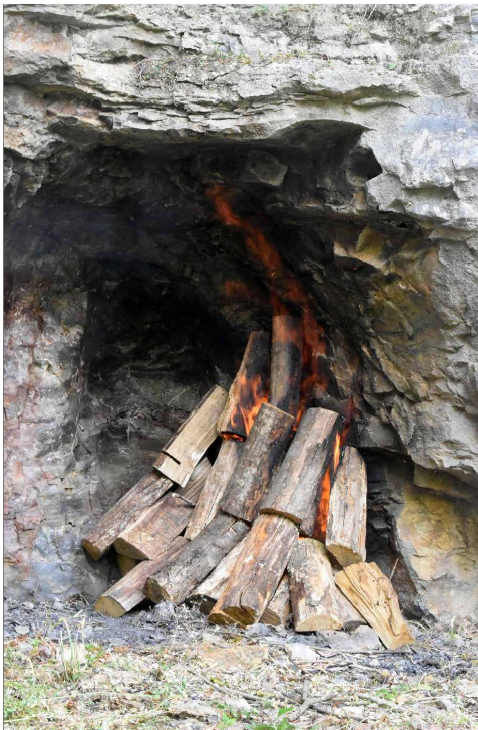
Figure 5. Pyre mounted on the working face.