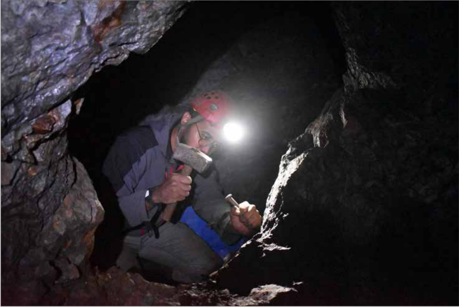
Figure 3. Mining with tools on a shale working face in the Lauqueille mine.

Obr. 3. Těžba s použitím nástrojů na břidlicovém povrchu v dole Lauqueille.