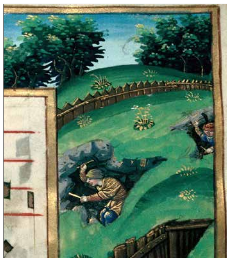
Figure 1. Illustration of mining with a hammer and a handle chisel. After Graduel de Saint-Dié 1510.

and handle chisel pair. The miner would place the handle chisel, on the wall and strike it with a hammer. This method is described in De Re Metallica (Agricola 1556) and is often depicted in ancient iconography (Kutnohorská iluminace 1490; Graduel de Saint-Dié 1510; La rouge myne de Saint Nicolas 1525; Fig. 1). This pair of tools remains the most traditional symbol of the miners. Archaeological evidence of its use can be seen in the characteristic traces visible in certain galleries, or in the handle chisel found on mining sites such as Castel-Minier in Ariège, France (Méaudre, in press). It is rare to find miners' hammers due to the pragmatic reason that a miner would use a single hammer for a day's work, compared to a dozen handle chisel. In addition, the types of hammers used by the miners are similar to those used in other areas of metallurgical production. Schnitzler (1990) found some of these hammers in mines, providing insight into their size and weight. This initial mining method relied solely on human labour.