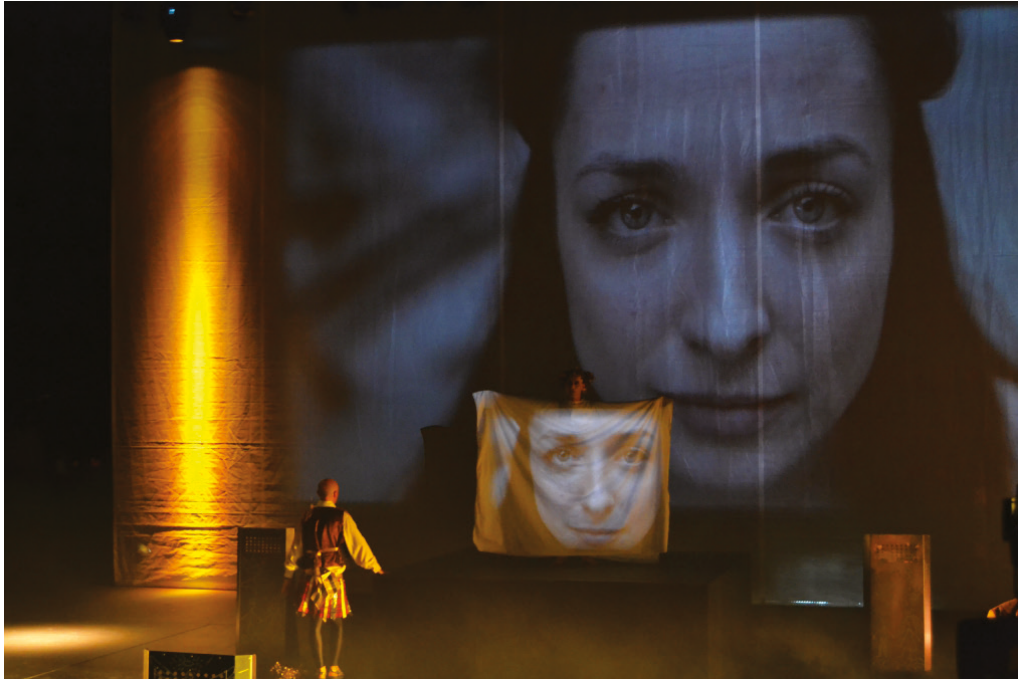
Fig. 4: Antigone : Reduction , New Stage Workshop, Alexandrinsky Theatre, St. Petersburg, 2014. Dir. Anfisa Ivanova.