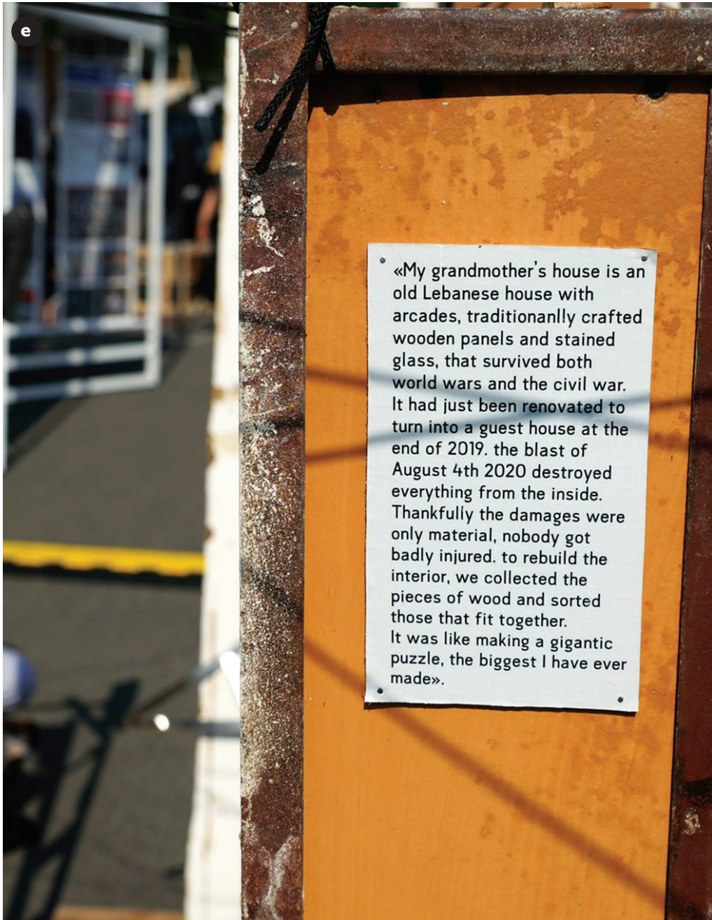
Fig. 9a-e: Puzzles – SE Lebanon. PQ 2023.