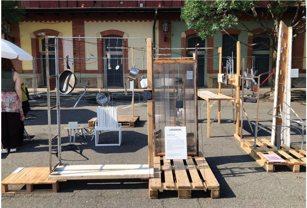
Fig. 4: Puzzles – SE Lebanon. PQ 2023.