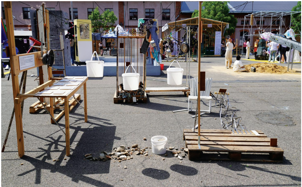
Fig. 5: Puzzles – SE Lebanon. PQ 2023.