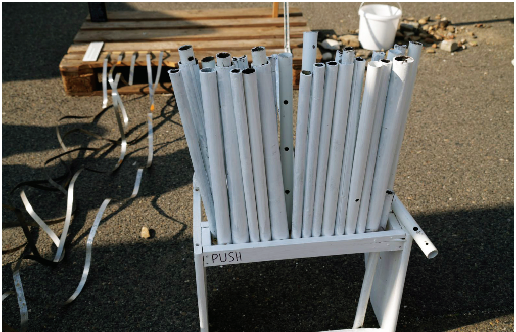
Fig. 7: Puzzles – SE Lebanon. PQ 2023.