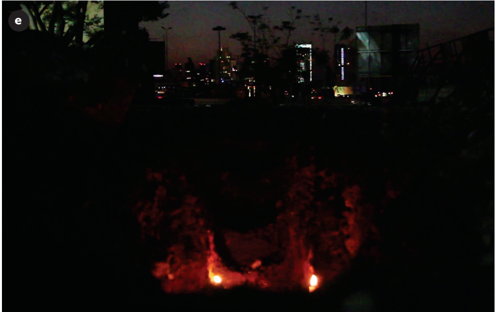
Fig. 3a-e: Stills from A Breath into a Hole . Lebanon, 2020.