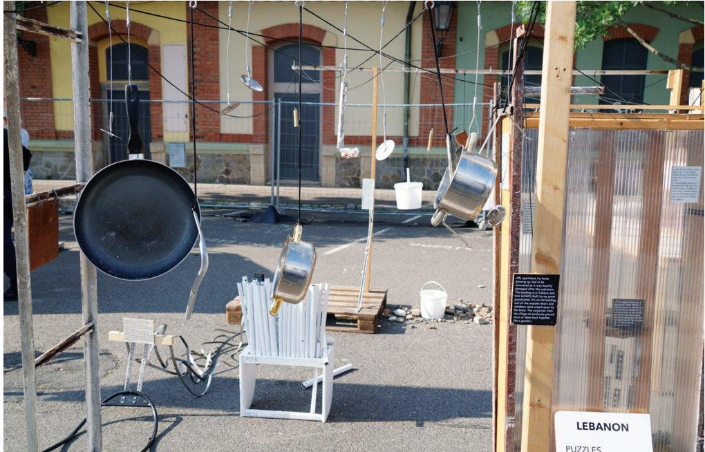
Fig. 8: Puzzles – SE Lebanon. PQ 2023.

a zero-budget project to testify to the issues that resulted from the Lebanese financial crisis, including how artistic expression and representation are impacted.