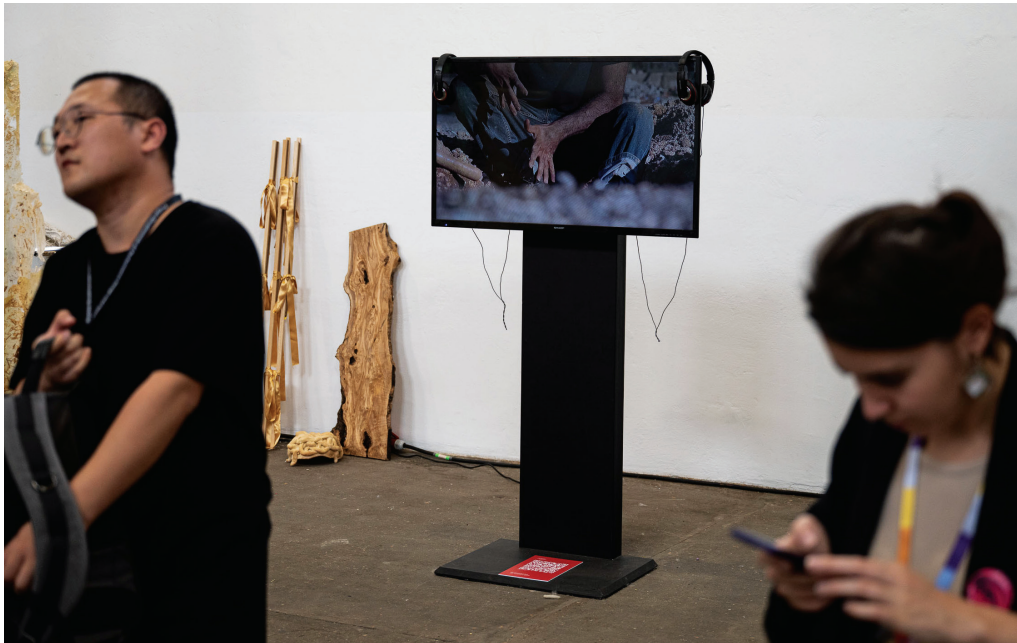
Fig. 2: A Breath into a Hole – ECR Lebanon. PQ 2023.