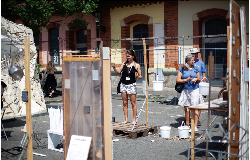
Fig. 6: Puzzles – SE Lebanon. PQ 2023.