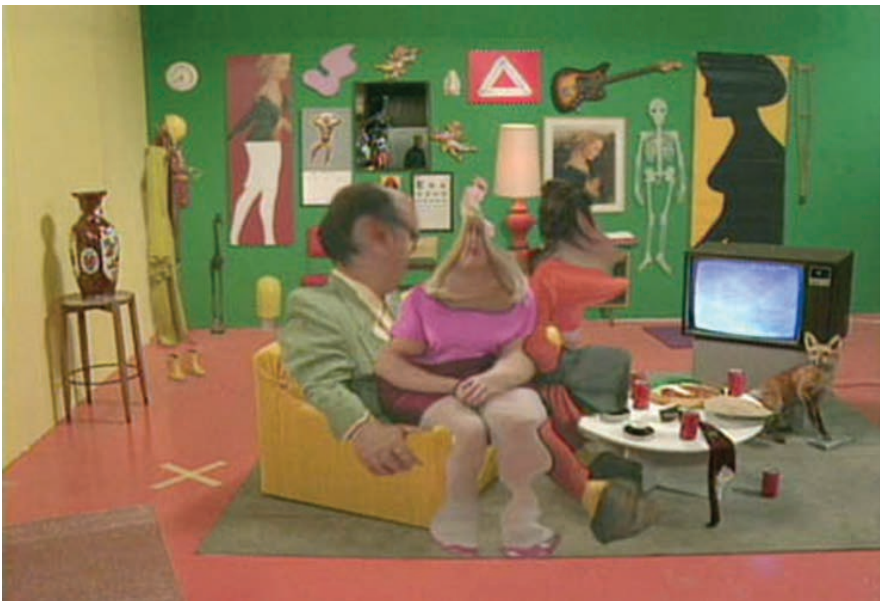
Figure 7. Still image from *Corpus Callosum (2002), 92 minutes, digital video