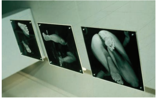
Figure 2. Crouch, Leap, Land (1970), 3 black and white photographs, perspex, metal, suspended, 140 × 36 cm each, total dimensions 161 × 36 cm. Collection: Art Gallery of Toronto