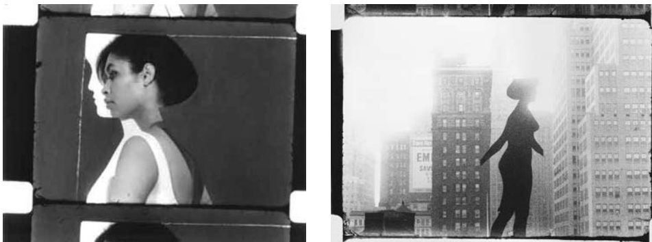
Figure 5. Still images from New York Eye and Ear Control (1964), 34 minutes, 16 mm