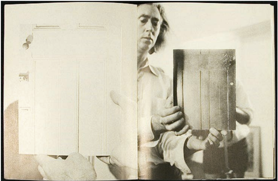
Figure 3. Pages excerpted from the book Cover to Cover (1975), book, 23 × 18 cm, published by the Press of Nova Scotia College of Art & Design and New York University Press

Despite the character of Snow's sculpture and photography, the contention that his films prioritize embodied sensory experience is hardly a standard claim in many critical assessments, for his cinematic works are most often considered in terms relating to its structural, conceptual and technical qualities – notions connected to intellectual rather than sensual experiences. 2 Borrowing Deleuze's analysis of the