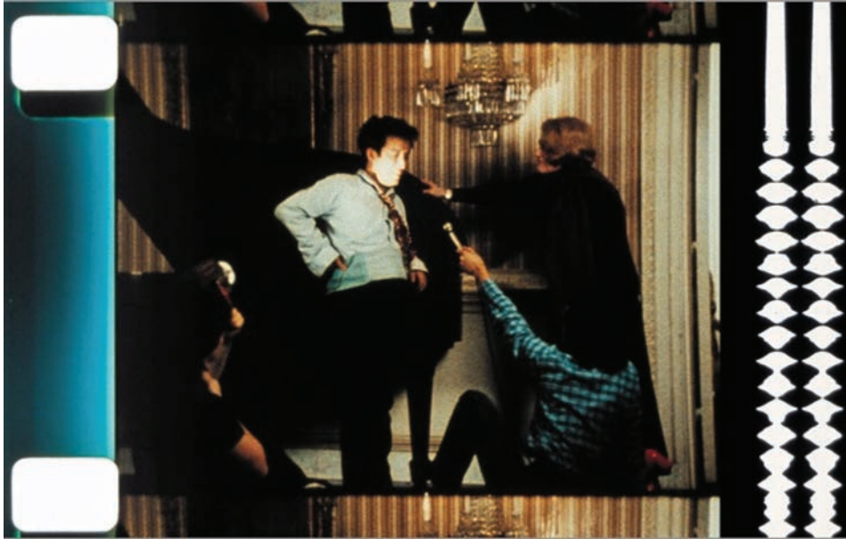
Figure 4. Still image from Rameau's Nephew by Diderot (Thanx to Dennis Young) by Wilma Schoen (1974), 4.5 hours, 16 mm

perception. 6 In moments where the images and sounds align in synchronistic fashion in these works, the effect produced is one of heightened interest, rather than the dismissal of one form as merely supporting the mimetic nature of the other, as is too often the case with sound and music in cinema. Snow's use of sound in his films is deeply related to his conception of how cinema interprets and represents embodied experience – in the description for *Corpus Callosum (2002), he describes the low-pitched electronic drones which fill the bulk of the soundtrack as representing “the nervous system” of the work.