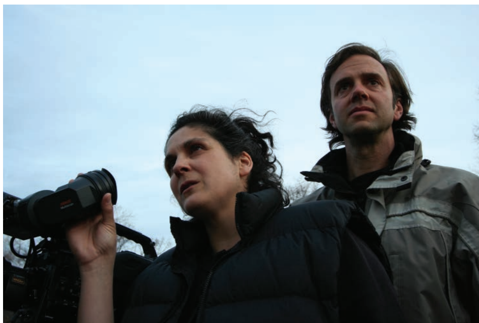
Figure 1. Jennifer Baichwal and cinematographer Nicholas de Pencier

a distance, we hear Baichwal's brother sob and we see the ashes as it passes behind the limbs of the family members standing alongside the fast moving water. While this is an intensely personal film, the camera does not invade the private space of the family. It is a recovery not of the body and not simply a picture of the dead; instead the film gives us a space to reflect on the relationship between east and west, family, death, time and the river. Moving water is an important metaphor of time carrying through Baichwal's films, especially with the masterful Watermark , on the very subject of water, discussed later in this essay. Within the logic and presence of The Holier It Gets , these questions of time, mortality and cultural difference remain unanswerable, even as it is important to know the question. These films are journeys that seek answers knowing that these cannot be found, at least in a totalizing way. At the same time, this is not a postmodern disavowal of truth and history. With this image of the father's ashes floating into the Ganges are the seeds of the complex metaphysical questions explored throughout this filmmaker's body of work, questions that are always also riveted to the particular moment in space and time but that these are moments created in the interstices of chance. 1