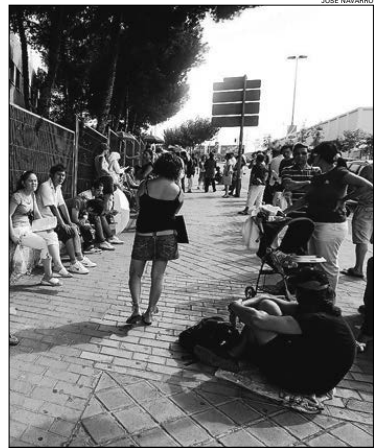
Colas de inmigrantes en las oficinas de Extranjería de Alicante

El retorno voluntario es uno de los temas que se tratan en este convenio de colaboración que pretende prestar una atención personalizada y de apoyo jurídico, así como asesoramiento e información sobre los aspectos legales en materia de extranjería que puedan ser los trámites a seguir y los procedimientos que con carácter general están establecidos. La población atendida ha sido de diferentes nacionalidades, como Brasil, Bolivia, Ecuador, Colombia, Chile, Cuba, Rusia, Guatemala o Venezuela. De igual forma, también se ha atendido a ciudadanos españoles, siendo en total 815 las